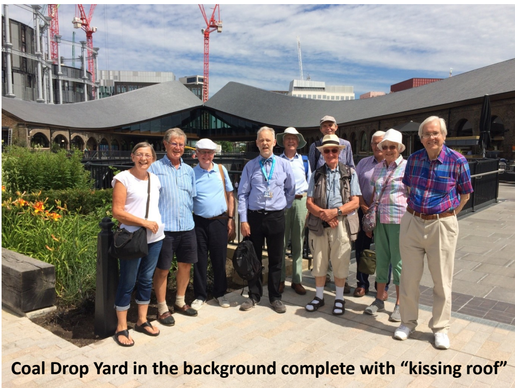
Coal Drop Yard in the background complete with “kissing roof”

Note that ladies really are welcome at Men’s Group events!