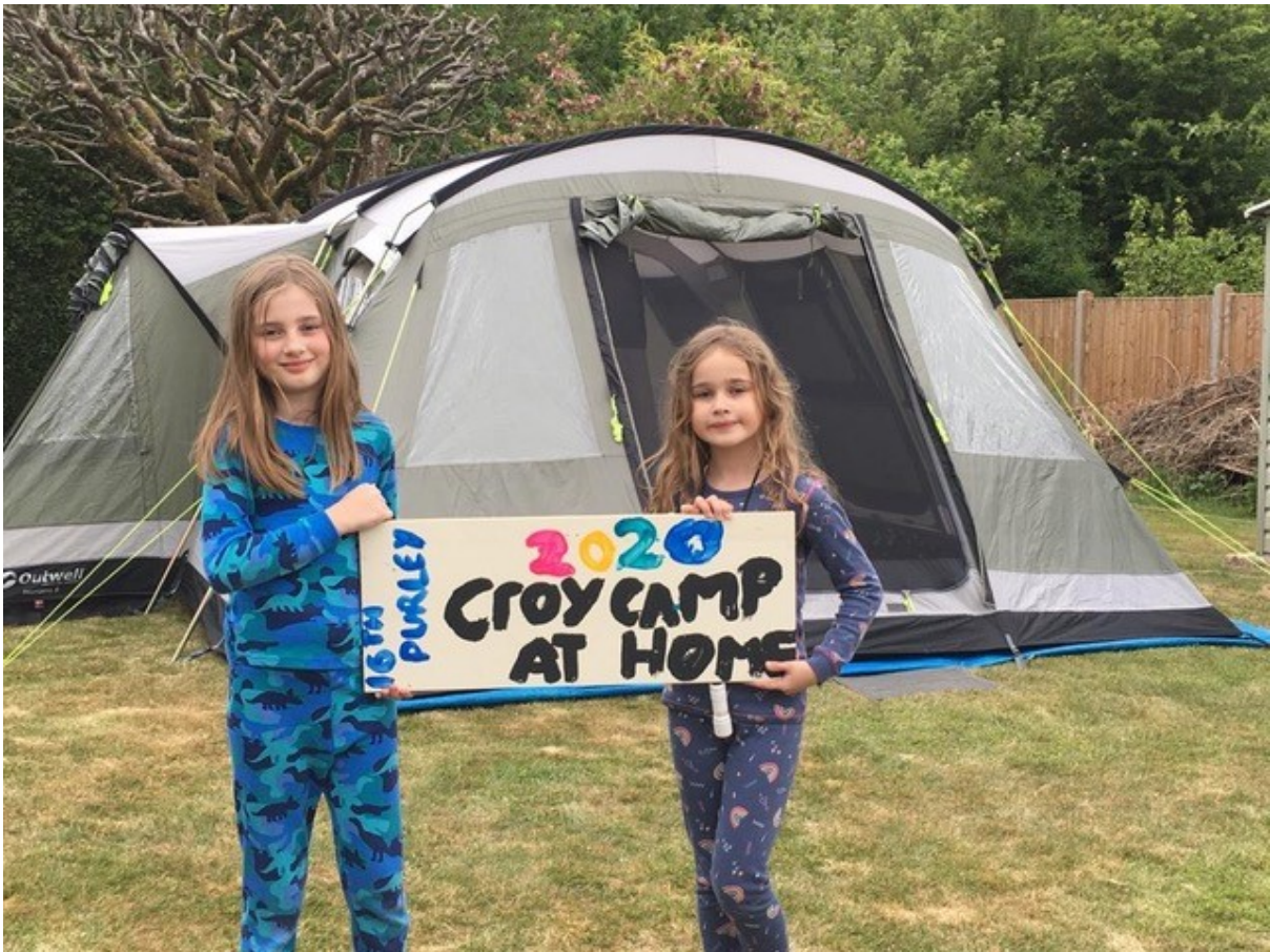
Rachel and Robyn ready for virtual 'CroyCamp 2020'