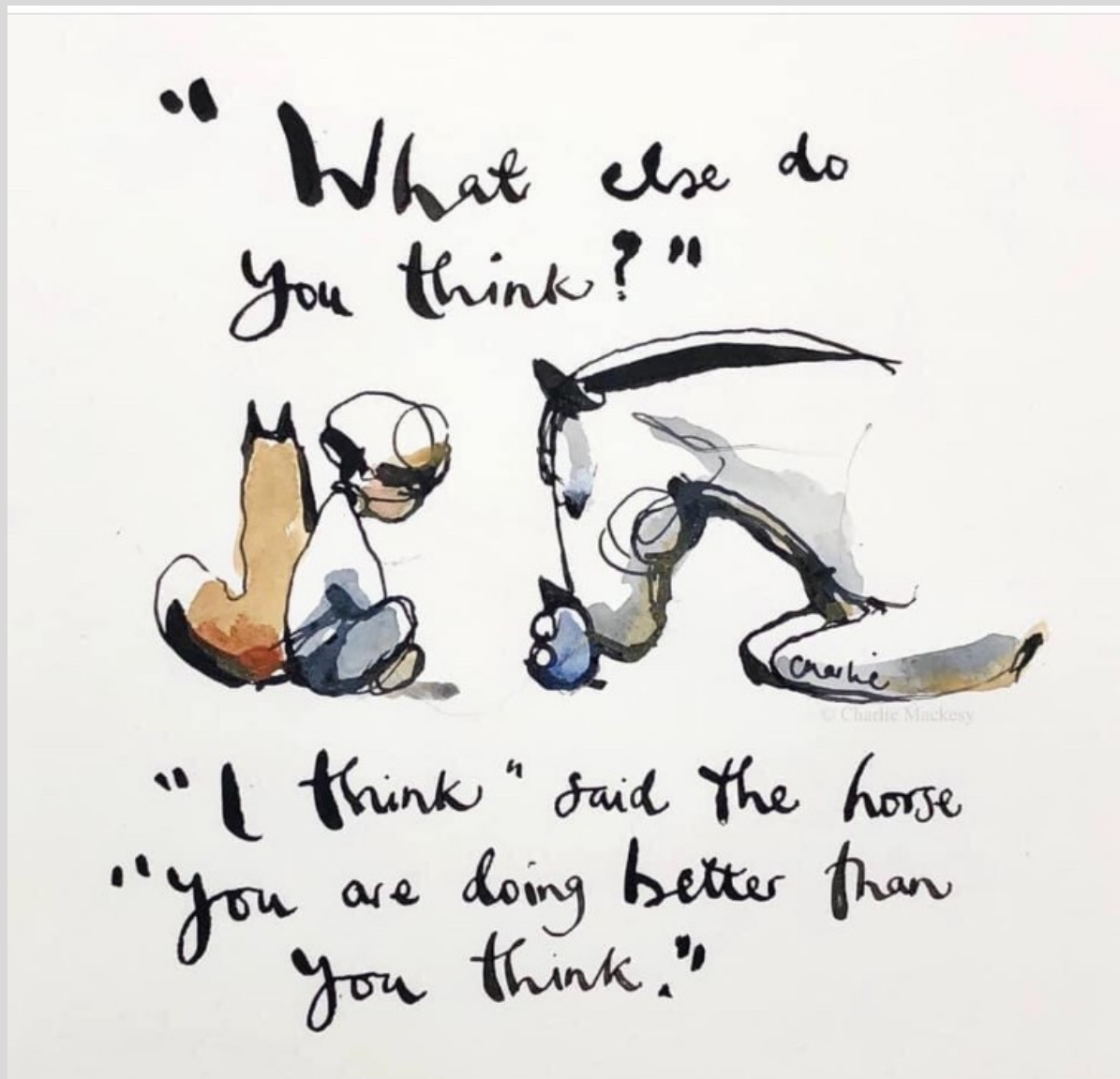
Charlie Mackesy, artist of the horse and his boy