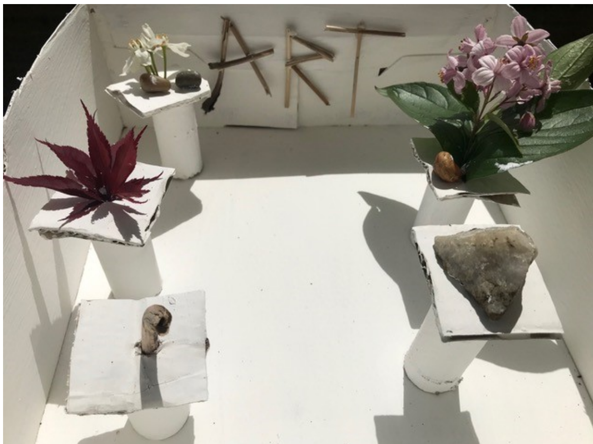
Elsa's Nature Art Exhibit for the Scout's challenge