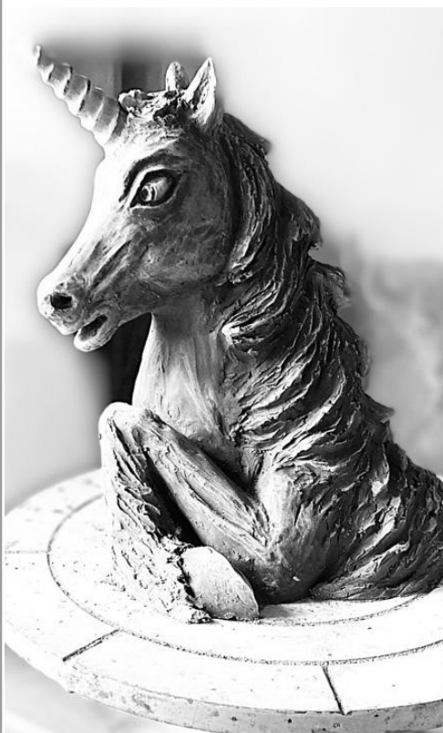
Latest sculpture, made from clay