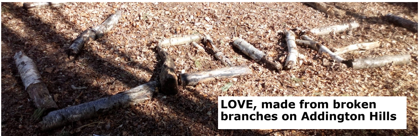
LOVE, made from broken branches on Addington Hills