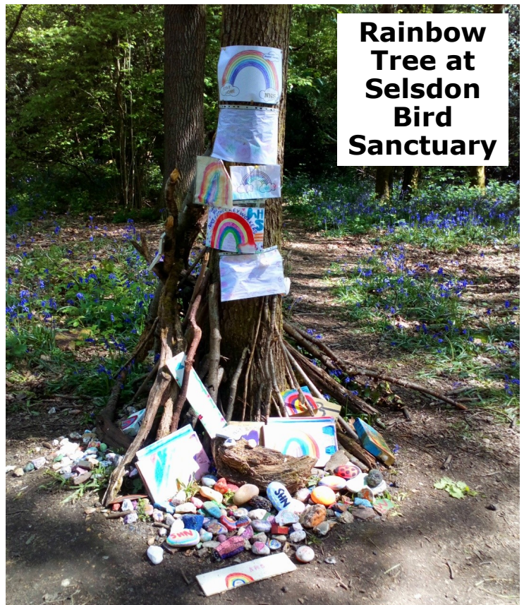
Rainbow Tree at Selsdon Bird Sanctuary