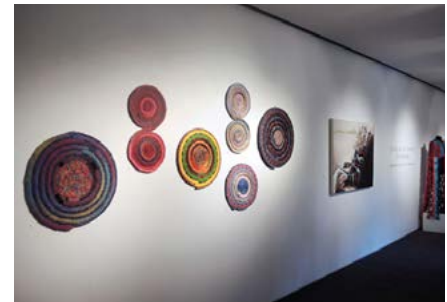
Emma Panting with Peg Moorehouse Gentle as the Dream she weaves , 2015