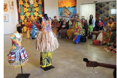
Kolose - The Art of Tuvalu Croche By Fafine Niutao i Aotearoa, 2014