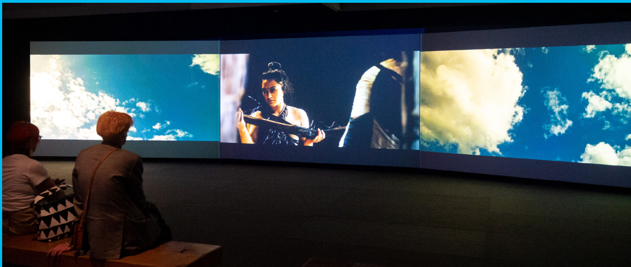
Image: Lisa Reihana: Te Wai Ngunguru - Nomads of The Sea , 2019, 3-channel 3D UHD video (Pātaka installation detail)

17 Parumoana Street, Porirua PO Box 50218 PO Box 50218 / Porirua City 5240 New Zealand Tel: +64 4 237 31512 / 021632409 www.pataka.org.nz patakaeducation@porirua.govt.nz