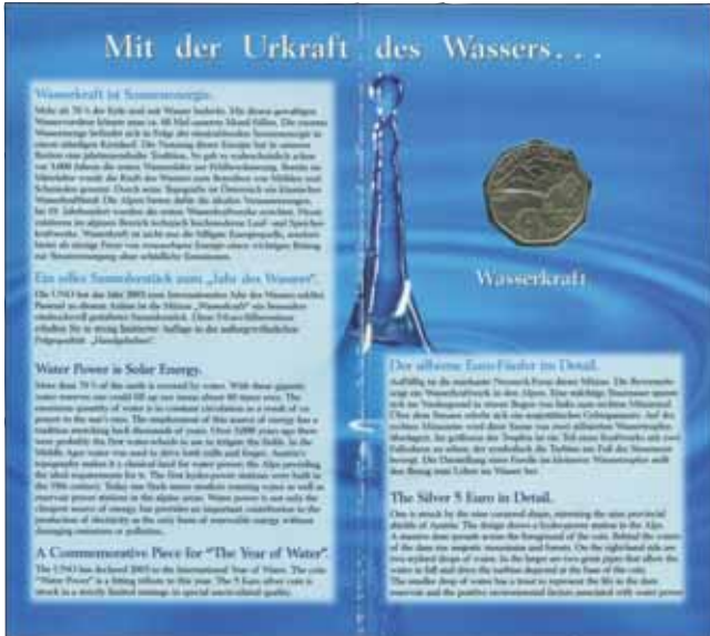
5141 9 €