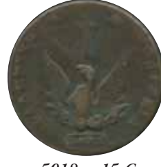
5018 15 €