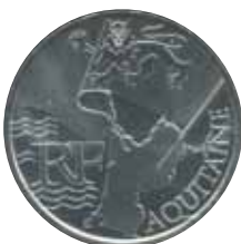
5180 11 €