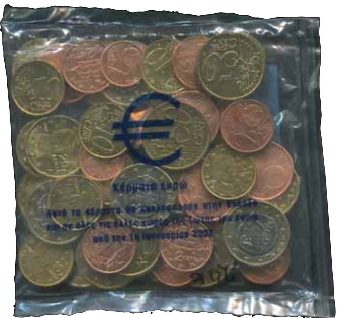
5058 20 €