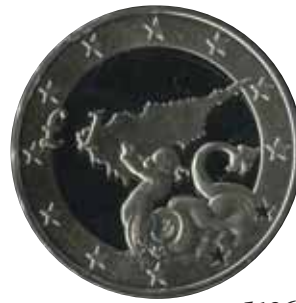
5126 27 €