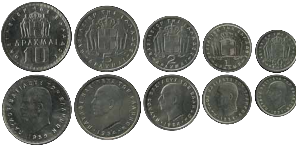
5042 10 €