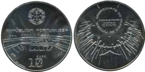
5335 11 €