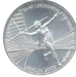
5283 38 €