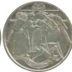
5140 14 €