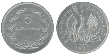
5040 30 €