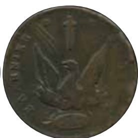
5025 35 €