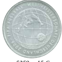
5259 15 €