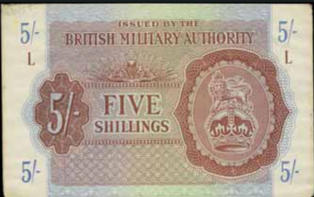
5442 11 €