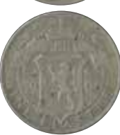
5097 5 €