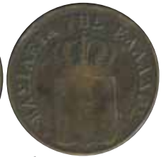
5031 360 €