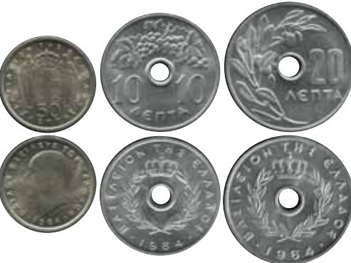
5047 14 €