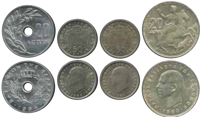
5044 8 €