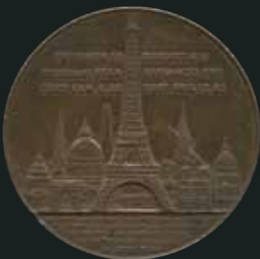
5366 35 €