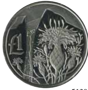
5128 27 €