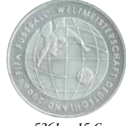
5261 15 €