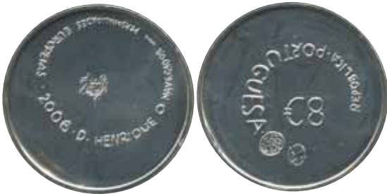
5336 10 €