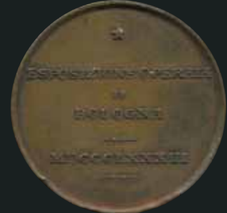
5374 30 €