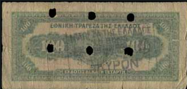
5395 4 €