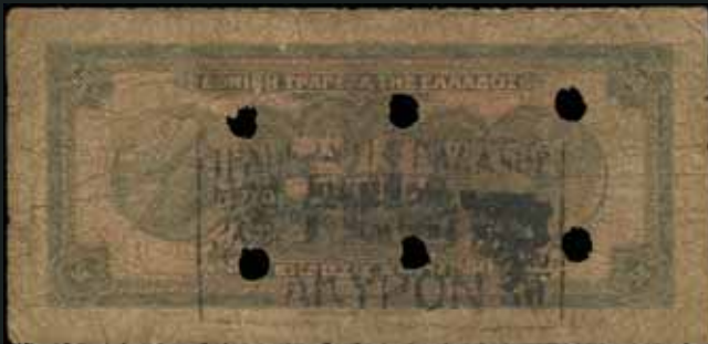
5394 4 €