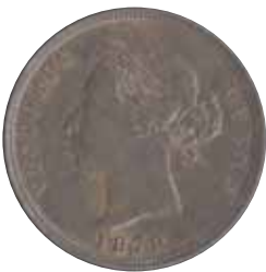
5075 280 €