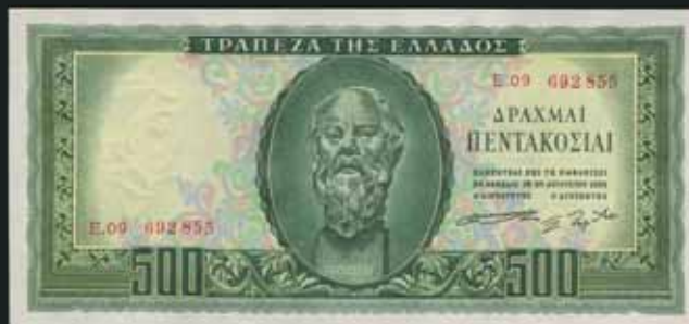
5425 350 €