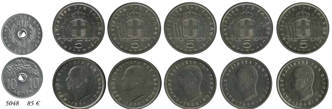
5048 85 €