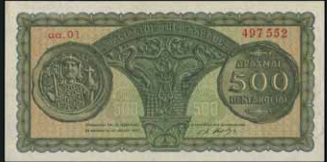
5433 8 €