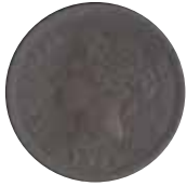
5079 145 €