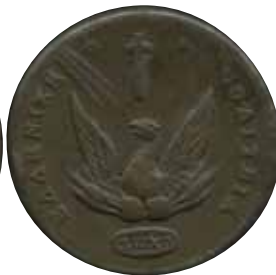
5024 90 €