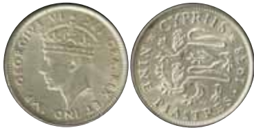
5112 9 €