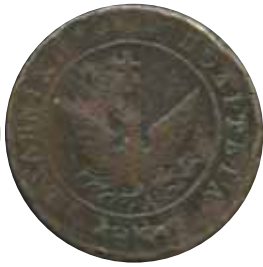
5001 40 €