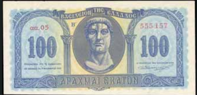
5435 8 €