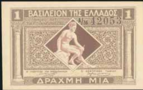
5427 80 €