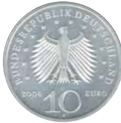
5272 29 €