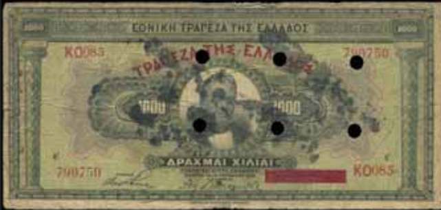
5392 3 €