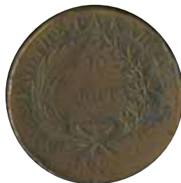
5006 270 €