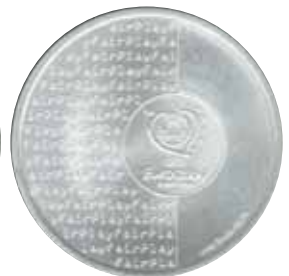
5322 9 €