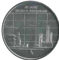
5277 16 €