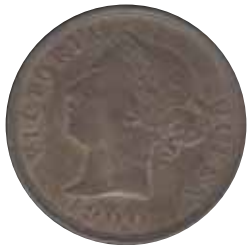
5095 700 €