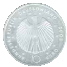
5258 15 €