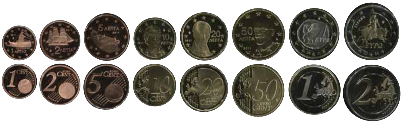
5063 160 €