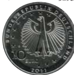
5296 19 €