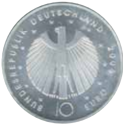
5271 15 €