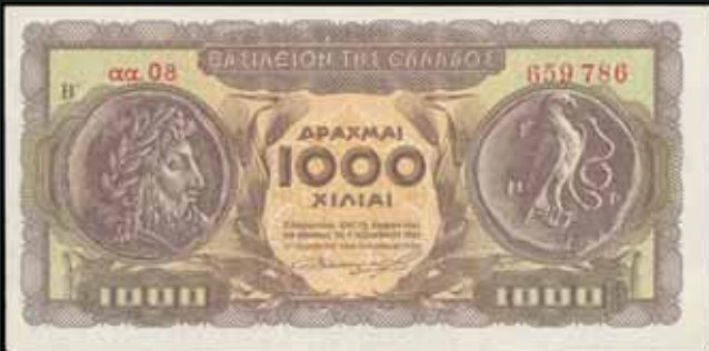
5436 13 €