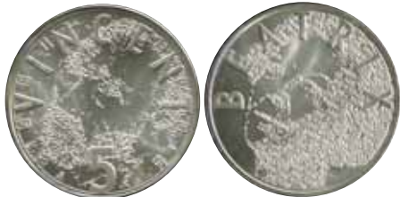
5300 8 €