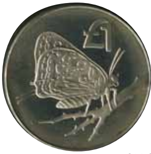
5125 8 €