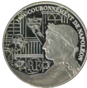
5179 33 €