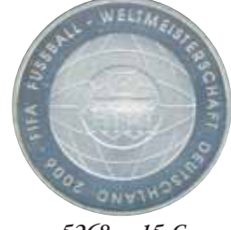
5268 15 €