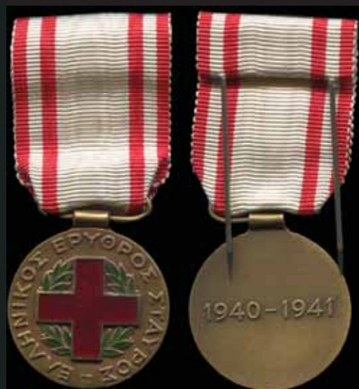
5347 40 €