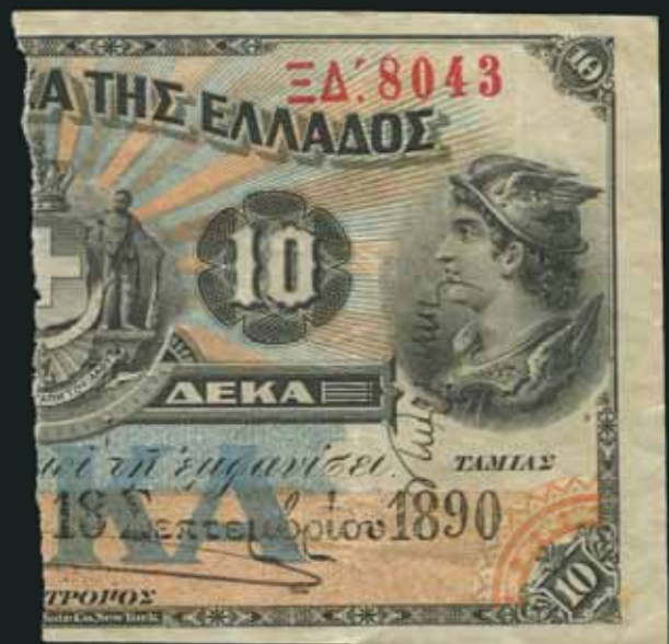
5381 900 €