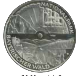
5262 14 €