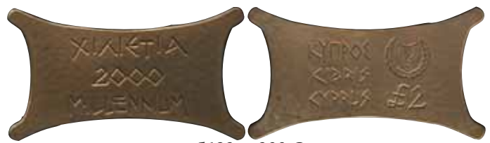
5123 300 €