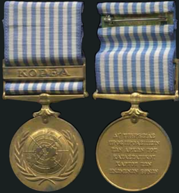
5350 9 €