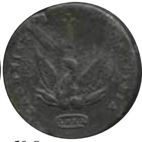
5020 50 €