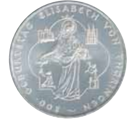
5278 17 €