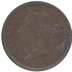
5092 250 €