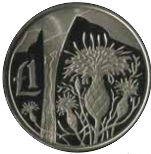
5129 3 €