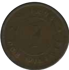
5077 45 €