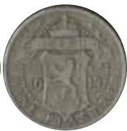
5104 9 €