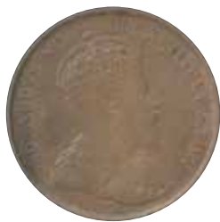
5103 360 €