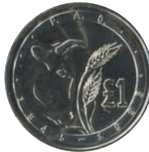
5116 3 €