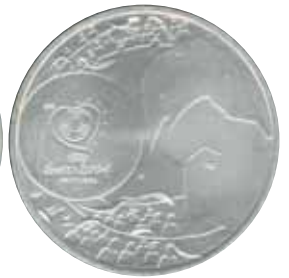
5325 9 €