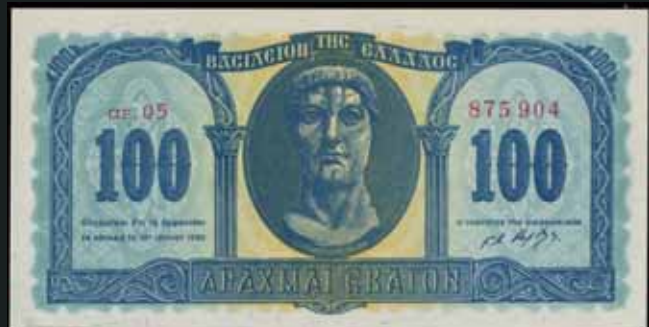
5432 6 €