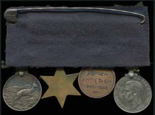
5345 205 €