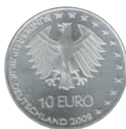
5287 38 €