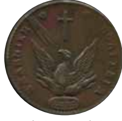
5017 175 €