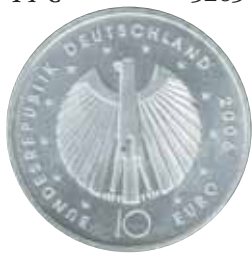
5269 15 €