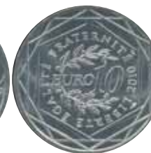
5181 11 €