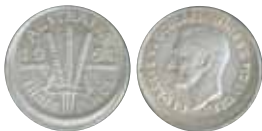
5134 33 €