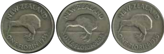
5316 13 €