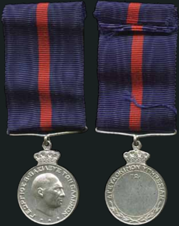
5348 9 €