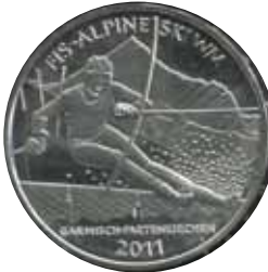
5294 38 €