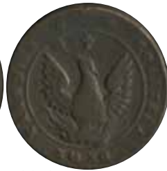
5007 90 €