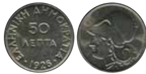
5039 11 €