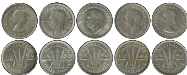
5132 18 €