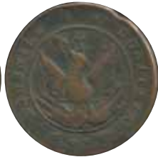
5003 55 €