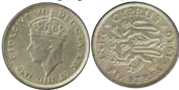
5114 13 €