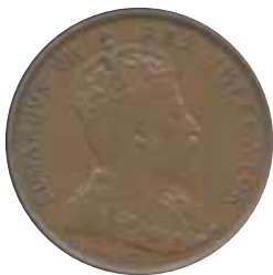
5102 760 €