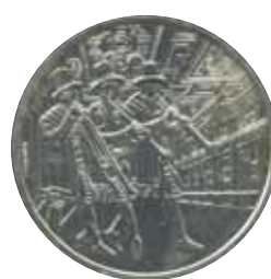
5137 14 €