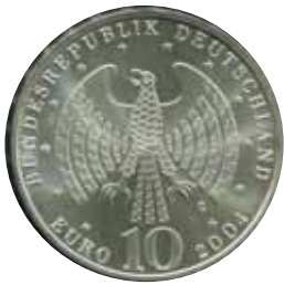
5254 14 €