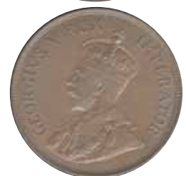
5111 920 €