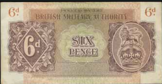
5441 37 €