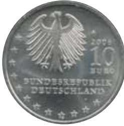
5273 15 €