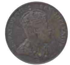
5101 320 €