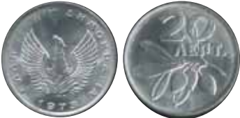
5055 8 €