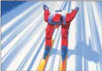
5166 9 €

Fluggefühl und Weitenjagd Der Wintersemester 2012 wurden an der Universität Wien die Fluggefühl und Weitenjagd. Der Wintersemester 2012 wurden an der Universität Wien die Fluggefühl und Weitenjagd. Der Wintersemester 2012 wurden an der Universität Wien die Fluggefühl und Weitenjagd.