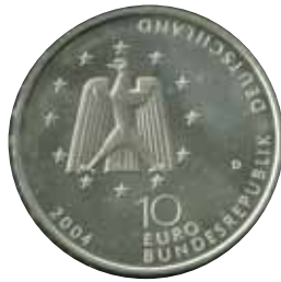
5256 14 €