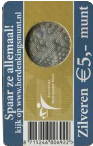
5304 9 €