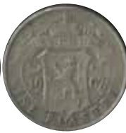
5100 9 €