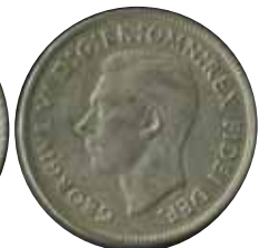
5135 9 €