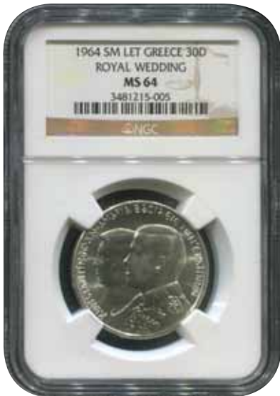
5050 8 €