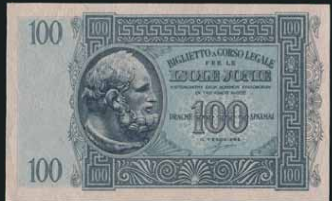
5438 48 €