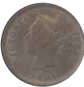
5081 180 €