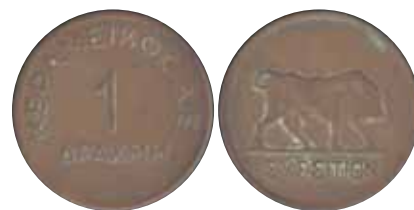
5342 15 €