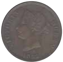
5080 140 €