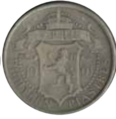
5098 15 €