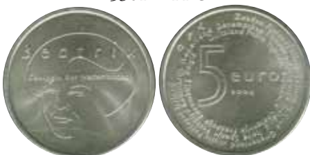
5302 8 €