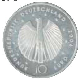
5270 15 €