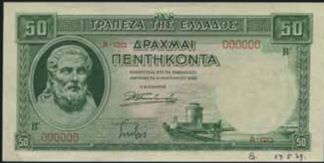
5391 490 €