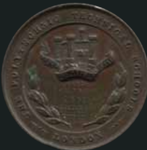
5373 20 €