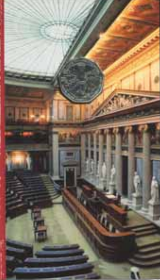
5160 9 €

100 JAHRE WAHLRECHTSREFORM DER EURO-FÜNFER IM DETAIL UNIVERSAL MALE SUFFRAGE THE FIVE-EURO COIN DESIGN