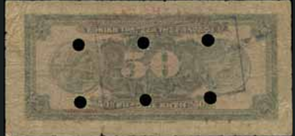
5393 11 €