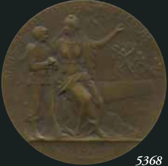
5368 50 €