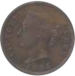
5083 400 €