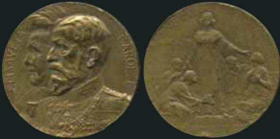
5377 30 €