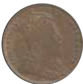
5099 125 €