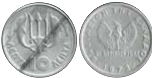
5053 35 €