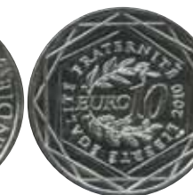
5182 11 €