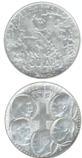
5046 10 €