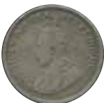
5106 3 €