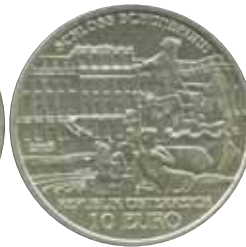
5142 14 €