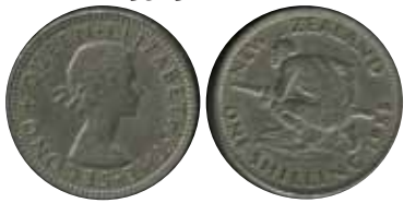
5319 9 €