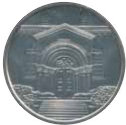
5164 14 €