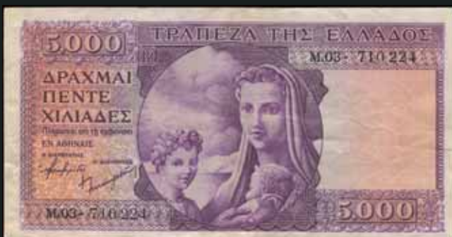
5420 30 €