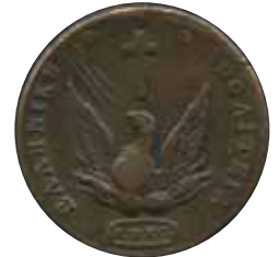
5014 45 €