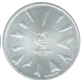
5326 9 €