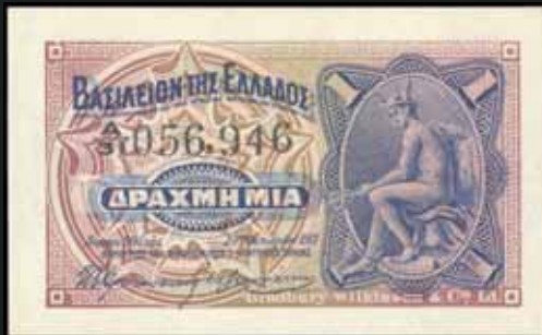
5429 88 €