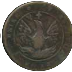
5009 40 €