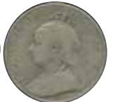
5096 3 €