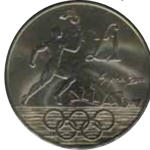
5122 23 €