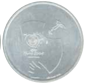
5324 9 €