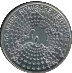
5275 16 €