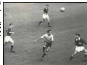
5148 9 €