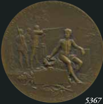
5367 40 €