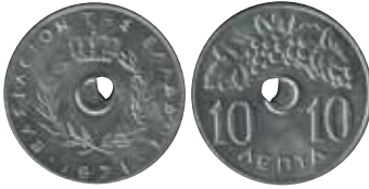
5051 40 €