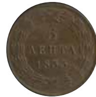
5028 150 €