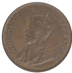
5110 440 €