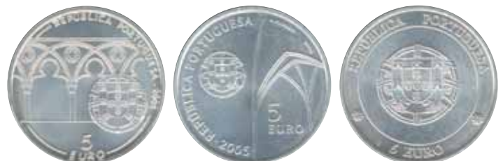
5332 6 €