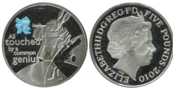
5298 55 €