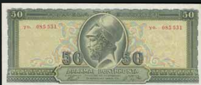
5422 15 €