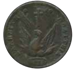
5015 30 €