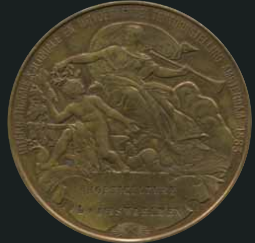
5376 40 €