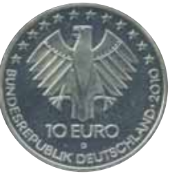
5290 18 €