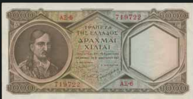
5418 14 €