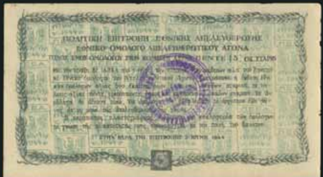
5445 70 €