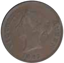
5088 105 €