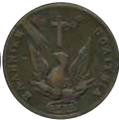
5011 25 €