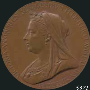
5371 55 €