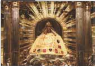
5162 9 €

„Die Kirche unserer Lieben Frau zu Zell“ Der Legende nach wurde Mariä Himmelfahrt im Dezember 1117 gegründet. Die Kirche unserer Lieben Frau zu Zell ist ein Wallfahrtsort. Die Kirche unserer Lieben Frau zu Zell ist ein Wallfahrtsort. Die Kirche unserer Lieben Frau zu Zell ist ein Wallfahrtsort.