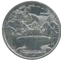
5175 14 €