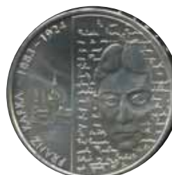
5281 16 €