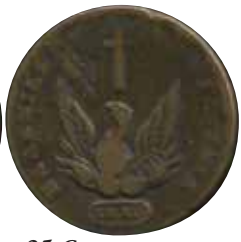
5013 25 €