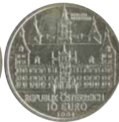
5139 14 €