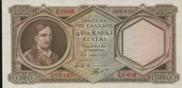
5417 31 €