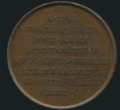
5363 20 €