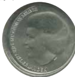
5299 14 €