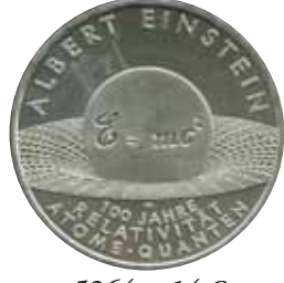
5264 14 €