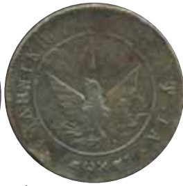
5002 40 €