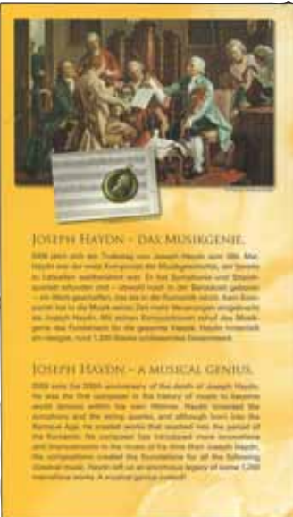
5172 9 €

ANLÄSSLICH DES 200. TODESTAGES VON JOSEPH HAYDN JOSEPH HAYDN - DAS MUSIKGENIE JOSEPH HAYDN - A MUSICAL GENIUS