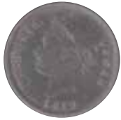
5074 64 €