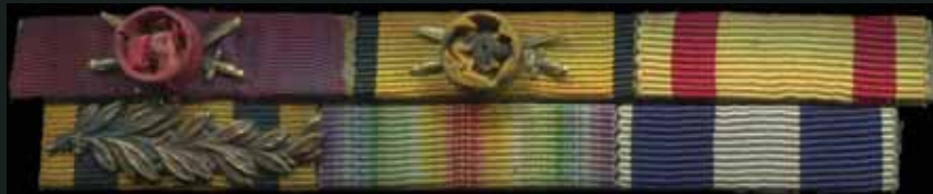
5344 300 €