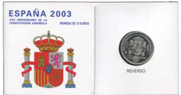
5341 18 €