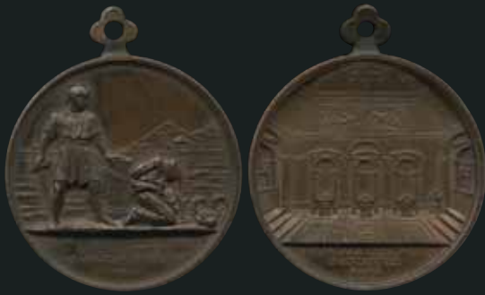
5375 40 €