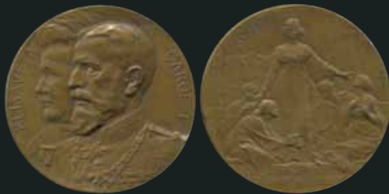
5378 33 €