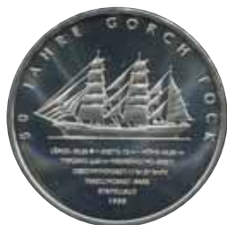
5282 16 €