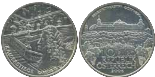
5159 14 €