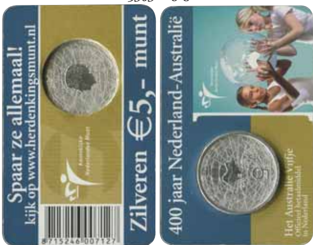
5306 9 €