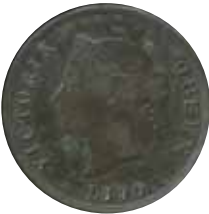
5087 40 €