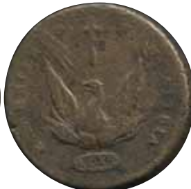
5022 15 €