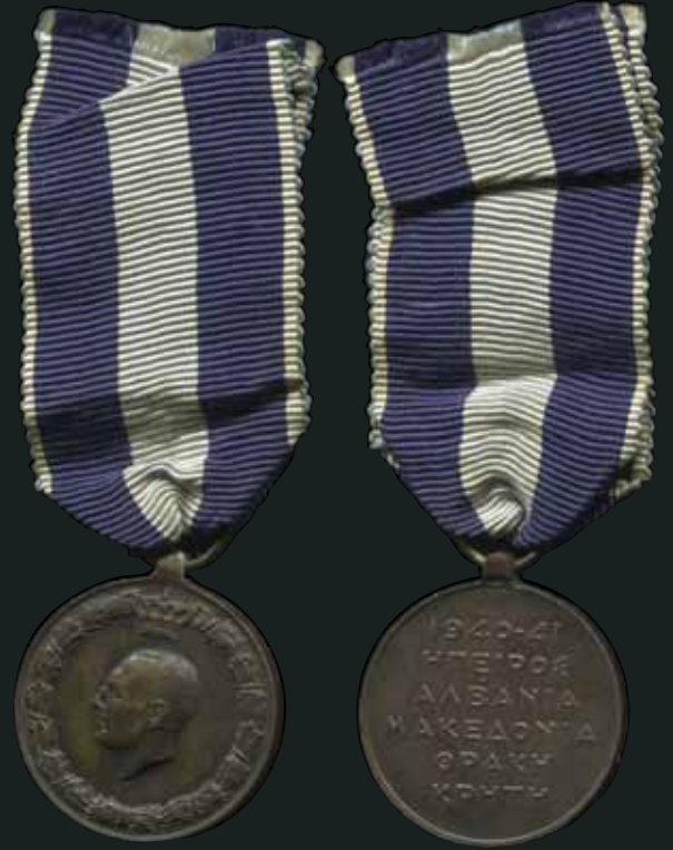
5349 2 €