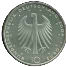
5255 14 €