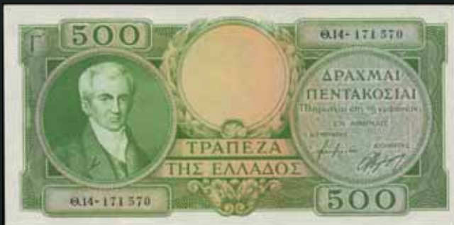
5416 25 €