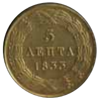
5027 600 €