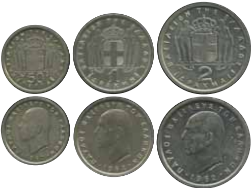
5045 11 €