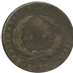
5008 65 €