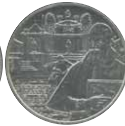
5144 14 €