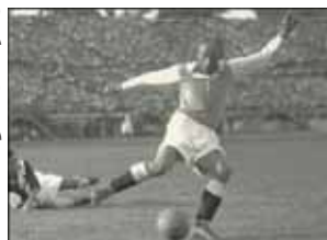
5146 9 €