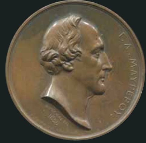
5351 790 €