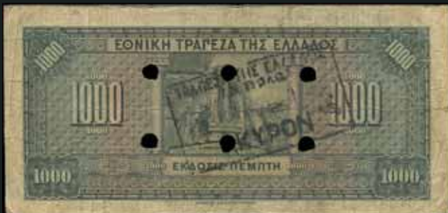
5396 4 €