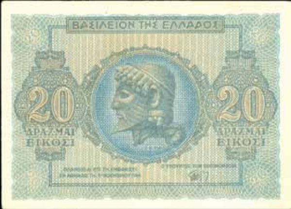
5431 5 €