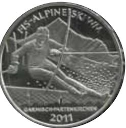
5293 19 €