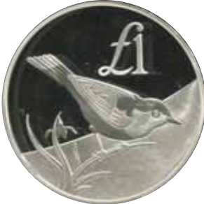
5119 45 €