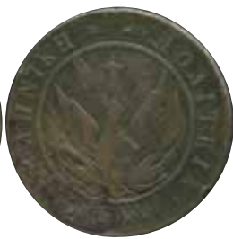
5005 75 €