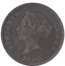
5086 105 €