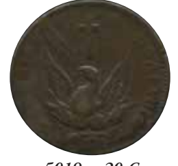
5019 20 €