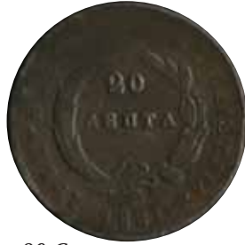
5021 80 €