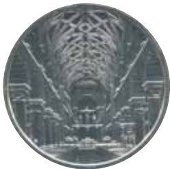
5169 14 €