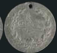
5379 20 €