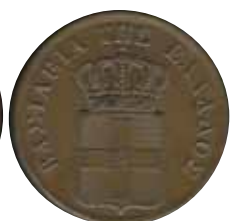
5029 315 €