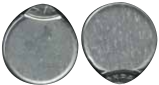
5054 145 €