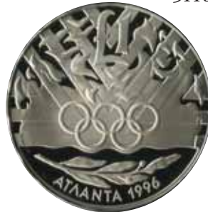
5117 23 €