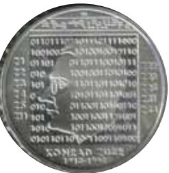
5288 18 €