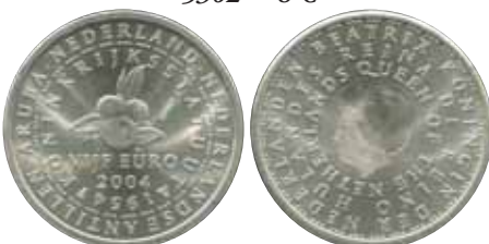
5303 8 €