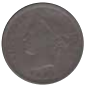
5082 175 €