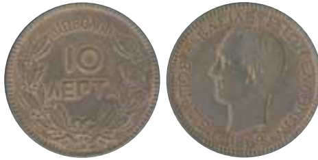
5035 90 €