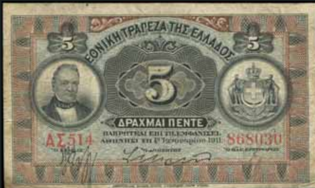
5382 45 €