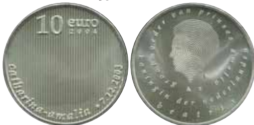
5301 14 €