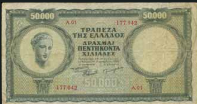
5421 6 €