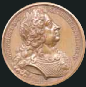
5370 70 €