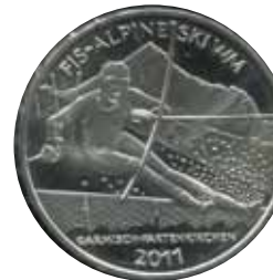
5291 17 €