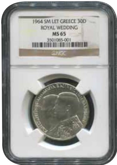
5049 9 €