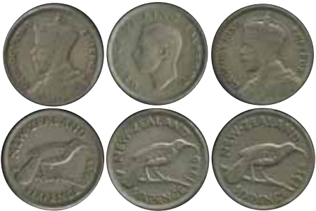
5315 10 €