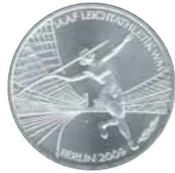
5286 21 €