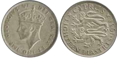
5113 22 €