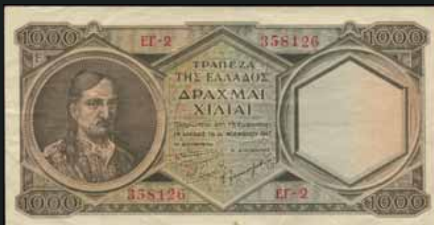
5419 3 €