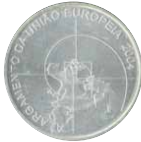
5327 9 €