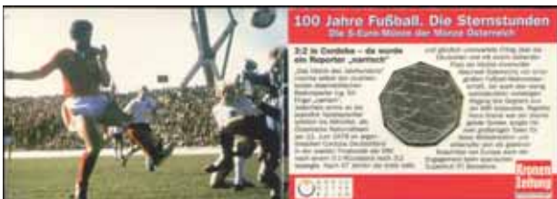
5145 9 €