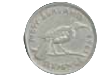
5318 9 €