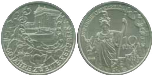
5155 14 €

Hermanns nie endendes Märcchen Hermanns nie endendes Märcchen ist ein Projekt, das die Kultur und die Natur der Steffis verbindet. Es ist ein Projekt, das die Kultur und die Natur der Steffis verbindet. Es ist ein Projekt, das die Kultur und die Natur der Steffis verbindet. 5153 9 €