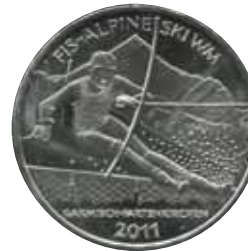
5295 19 €