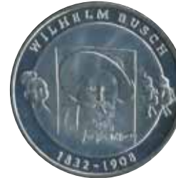
5276 16 €