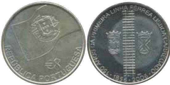
5338 10 €