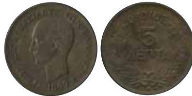
5034 30 €