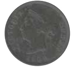
5094 350 €