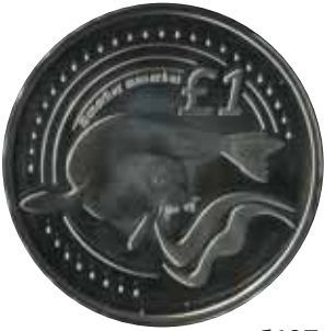
5127 33 €