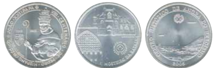
5334 6 €