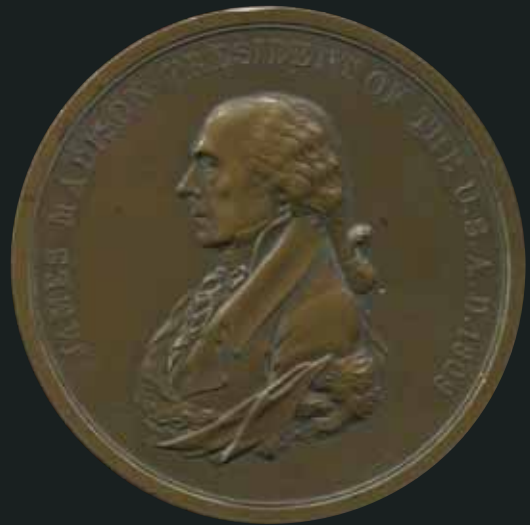
5380 30 €