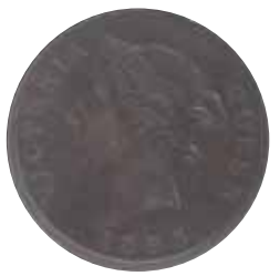
5091 240 €