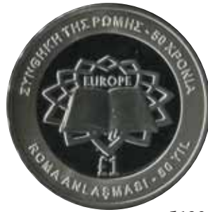
5130 33 €