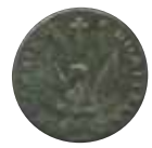
5010 115 €