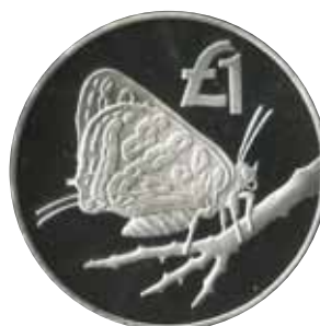
5124 45 €