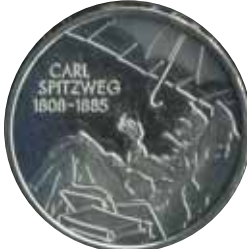
5279 16 €