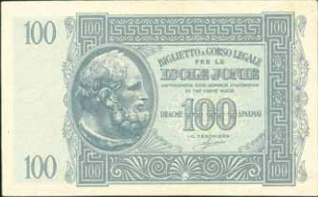
5439 30 €