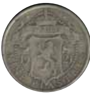
5107 9 €