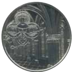
5167 14 €