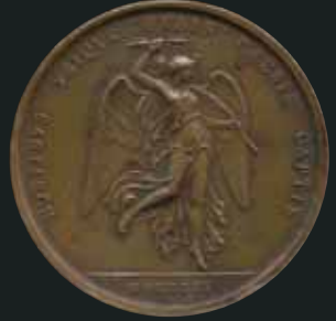
5362 80 €