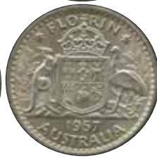
5133 53 €