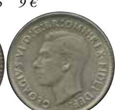
5136 9 €