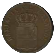
5030 120 €