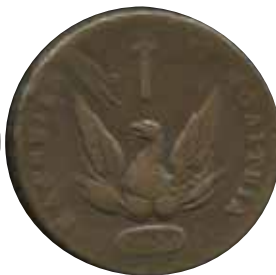
5023 30 €