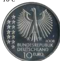
5280 16 €