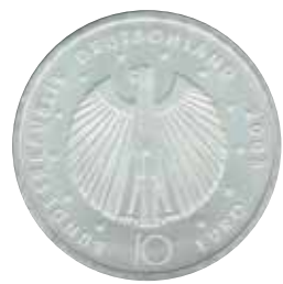
5257 15 €