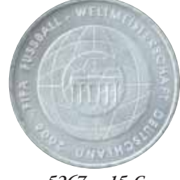
5267 15 €