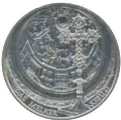
5161 14 €