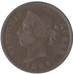
5090 300 €