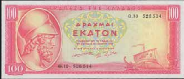
5424 140 €