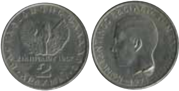
5052 25 €