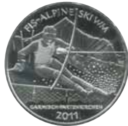
5292 19 €