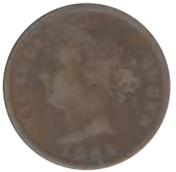
5084 115 €