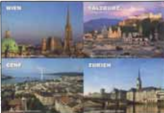
5163 9 €

Das große Finale in Wien An der Endrunde in Österreich und der Schweiz nahmen 16 Mannschaften teil. Das große Finale in Wien ist ein Wallfahrtsort. Das große Finale in Wien ist ein Wallfahrtsort. Das große Finale in Wien ist ein Wallfahrtsort.