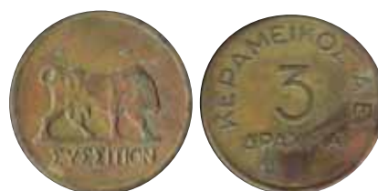
5343 15 €