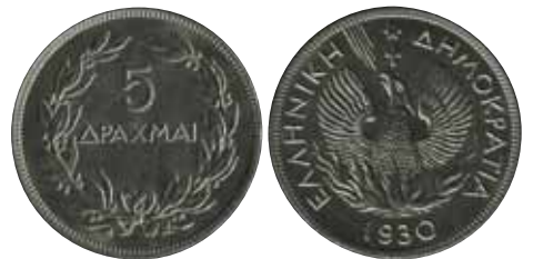
5041 20 €