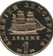
5057 355 €