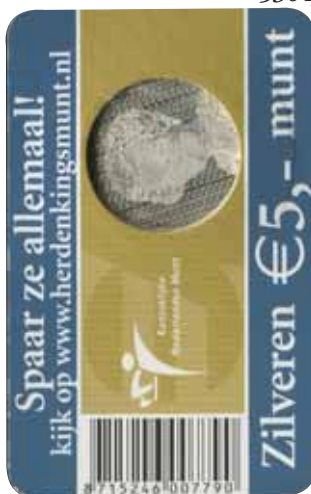
5305 9 €