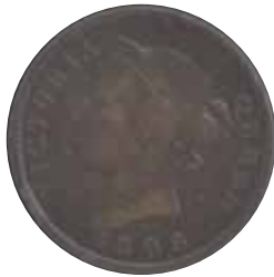
5093 150 €