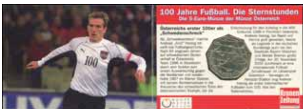
5147 9 €