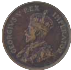
5109 240 €