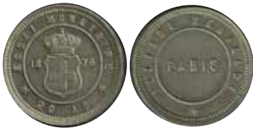
5036 950 €