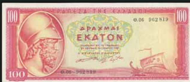
5423 50 €