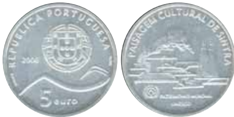
5337 6 €