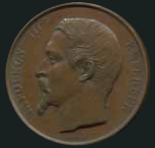
5365 20 €