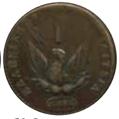
5012 50 €