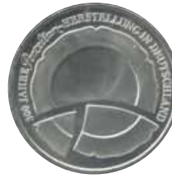
5289 18 €