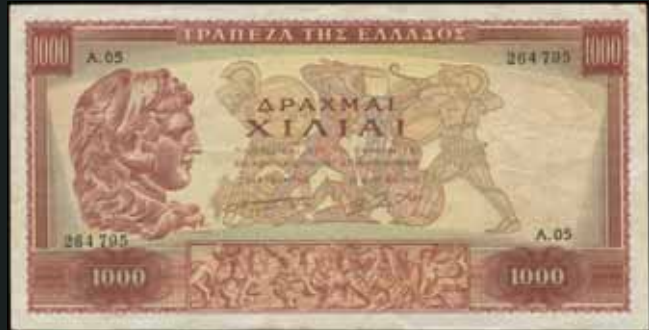
5426 35 €