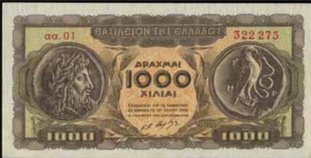
5434 15 €