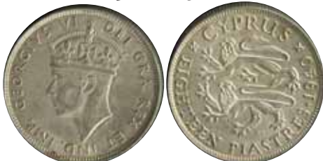
5115 22 €