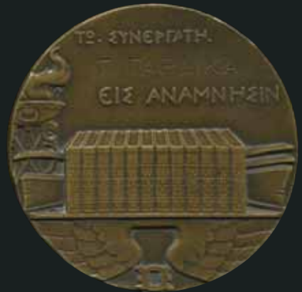
5354 45 €