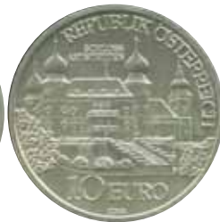
5149 14 €