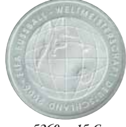
5260 15 €