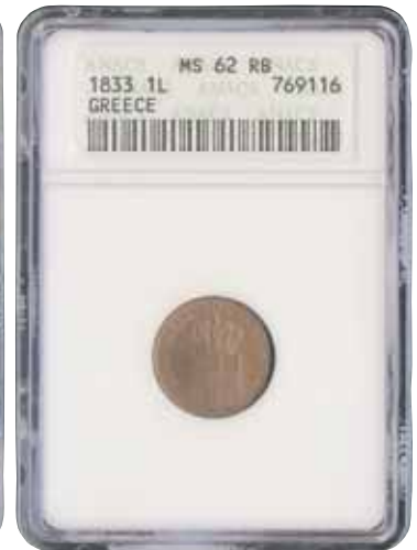
5026 185 €