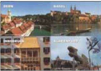
5165 9 €

Anpfiff in der Schweiz Der Anpfiff zum großen Fußballturnier des Österrich und der Schweiz ist ein Wallfahrtsort. Der Anpfiff zum großen Fußballturnier des Österrich und der Schweiz ist ein Wallfahrtsort. Der Anpfiff zum großen Fußballturnier des Österrich und der Schweiz ist ein Wallfahrtsort.