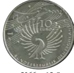
5266 15 €