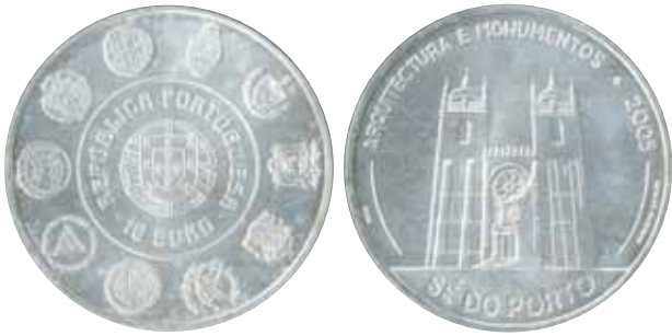
5331 11 €