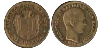
5037 570 €