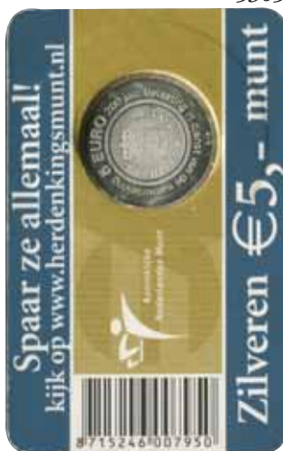
5307 9 €