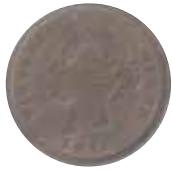
5078 105 €