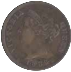
5085 140 €