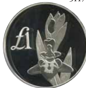
5118 45 €