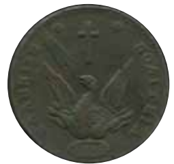
5016 150 €