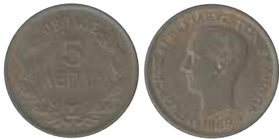
5033 275 €