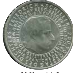
5263 14 €