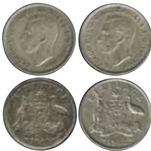
5131 4 €