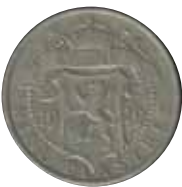
5105 7 €