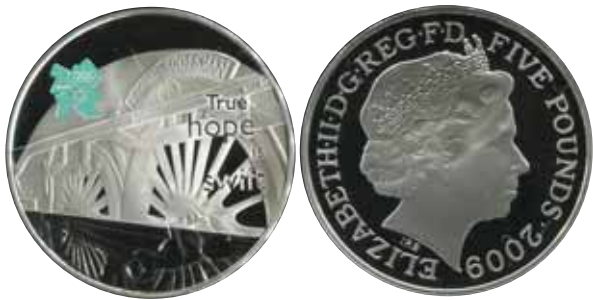
5297 55 €