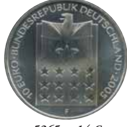
5265 14 €