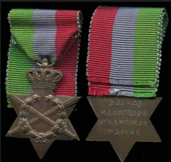
5346 390 €