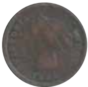
5089 90 €