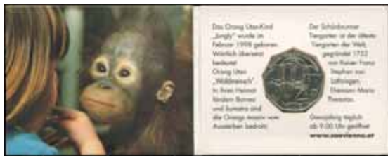
5138 9 €