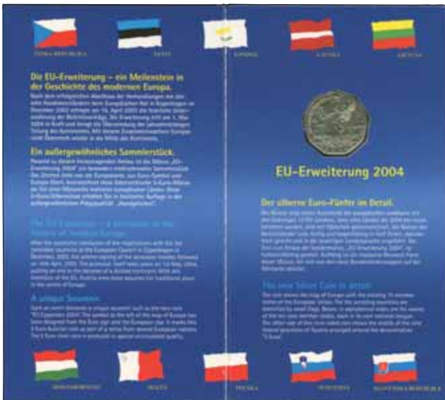
5143 9 €