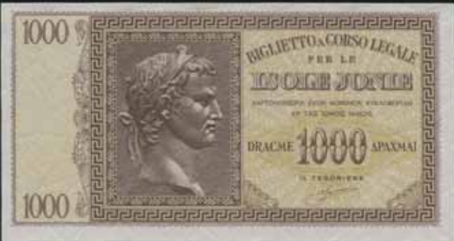
5440 160 €