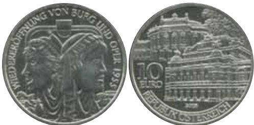
5156 14 €