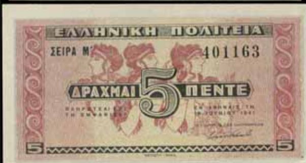
5430 5 €