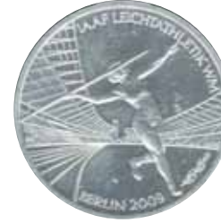
5284 38 €