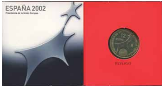
5340 18 €