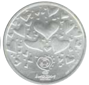
5321 9 €