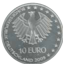
5285 38 €