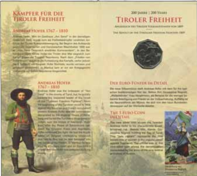
5171 9 €