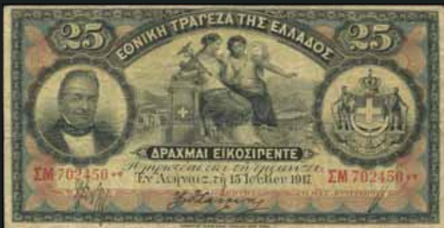
5383 60 €