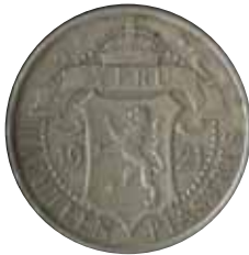
5108 18 €