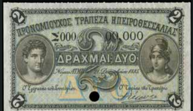
5443 205 €