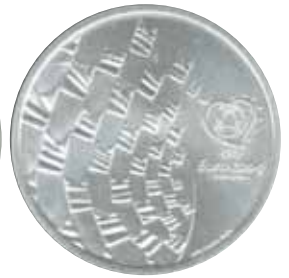
5320 9 €