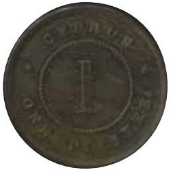
5076 90 €