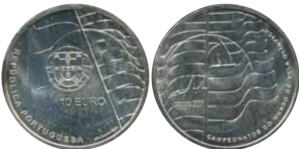
5339 11 €