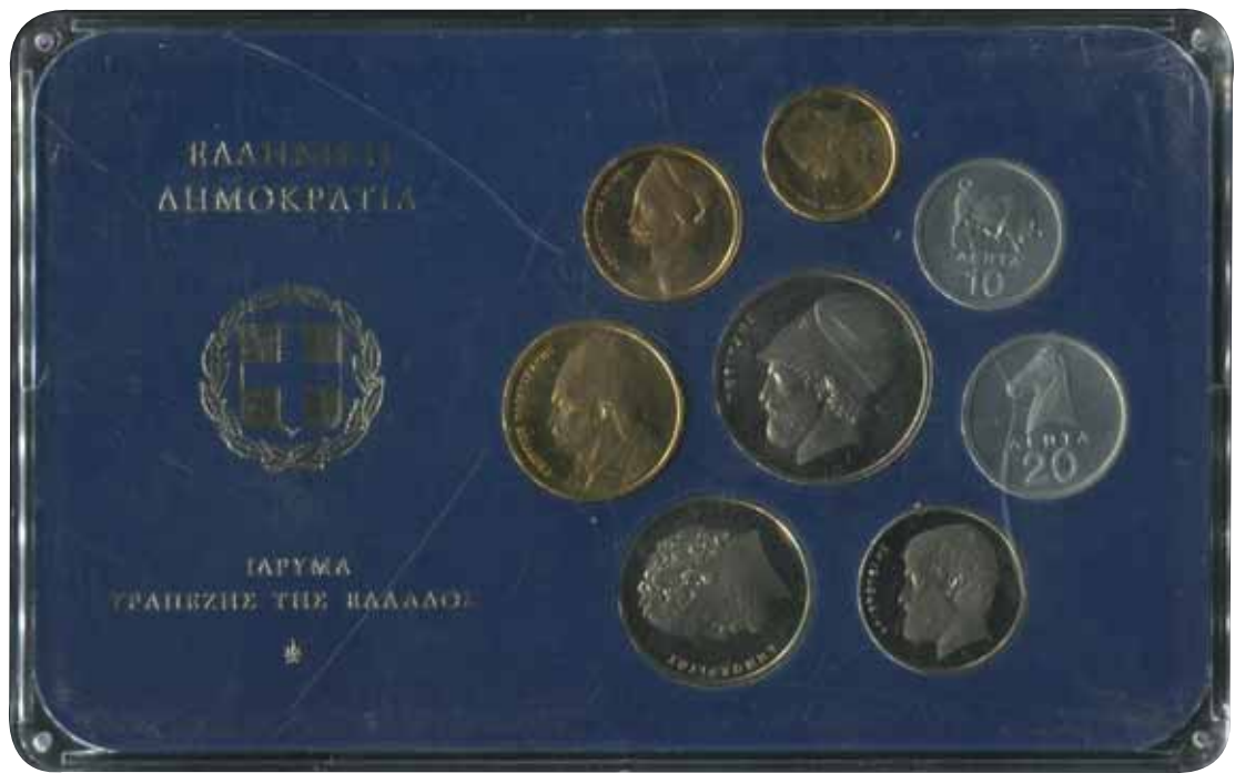
5056 19 €