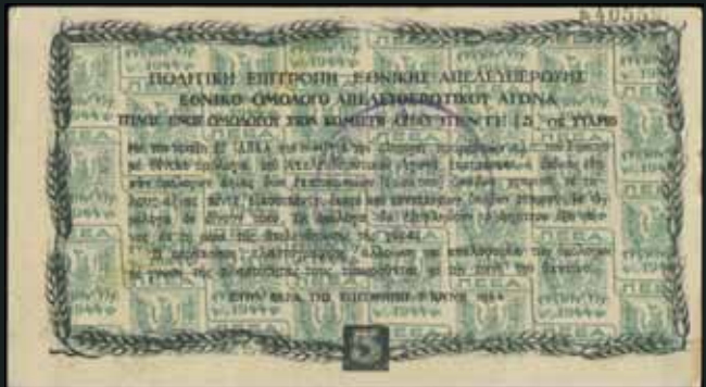
5444 31 €