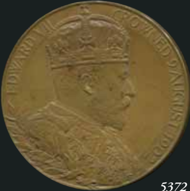
5372 40 €