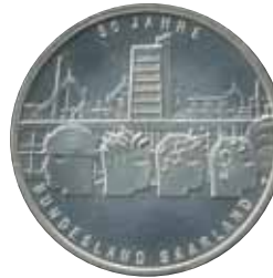
5274 32 €