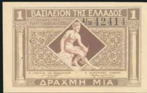
5428 30 €