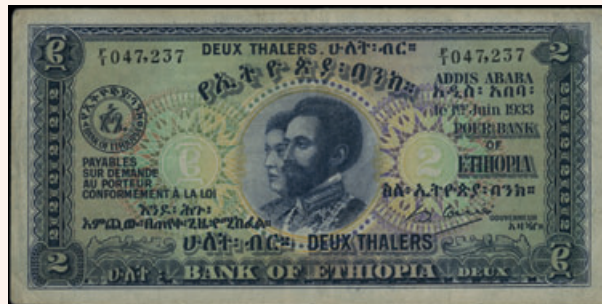
Lot: 6274 (60%)