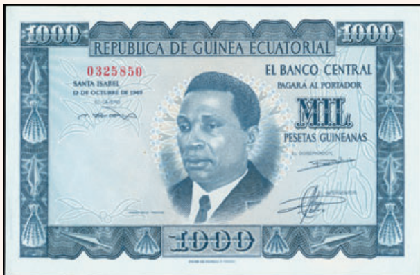
Lot: 6270 (50%)