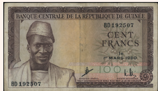
Lot: 6282 (55%)