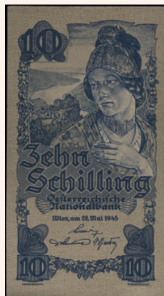
Lot: 6262 (60%)