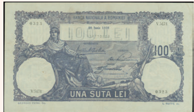
Lot: 6290 (40%)