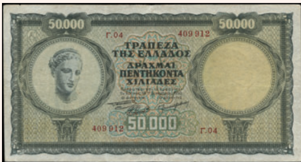
Lot: 6179 (50%)