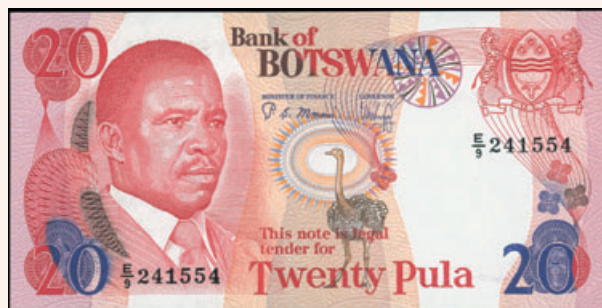
Lot: 6263 (55%)