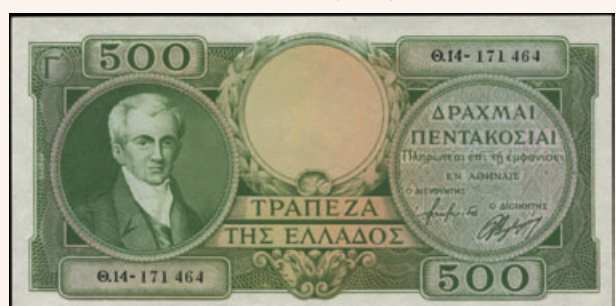
Lot: 6176 (50%)