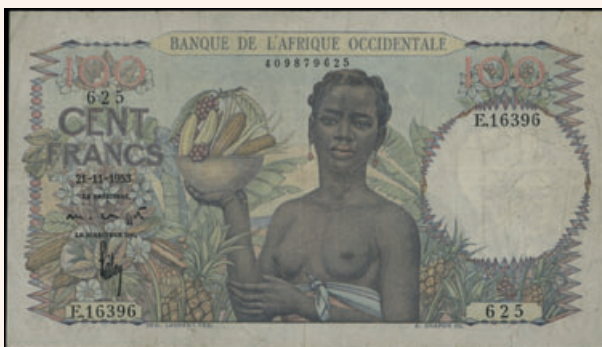
Lot: 6281 (50%)