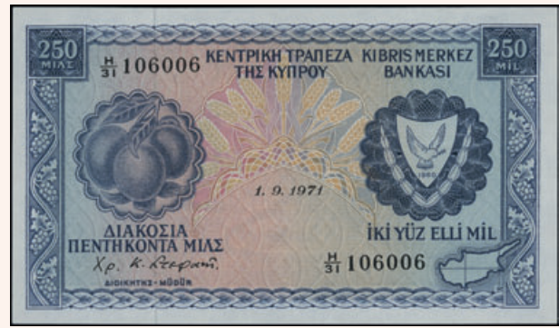
Lot: 6209 (65%)