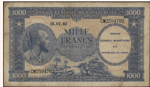
Lot: 6265 (45%)