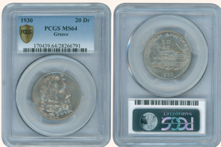
Lot: 6028 (80%)