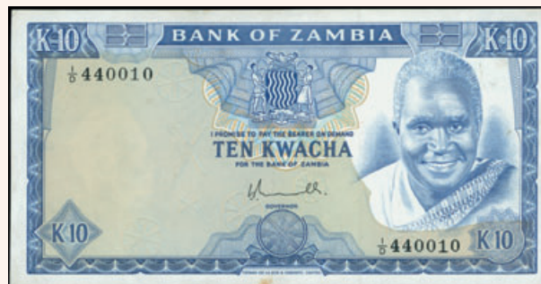
Lot: 6299 (50%)