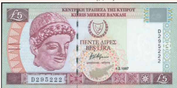
Lot: 6242 (55%)