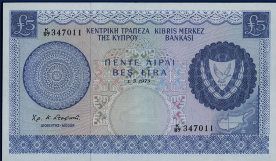
lot 6215 (75%)