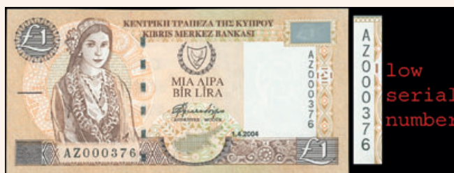
Lot: 6253 (45%)