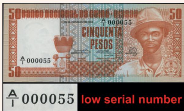
Lot: 6284 (55%)