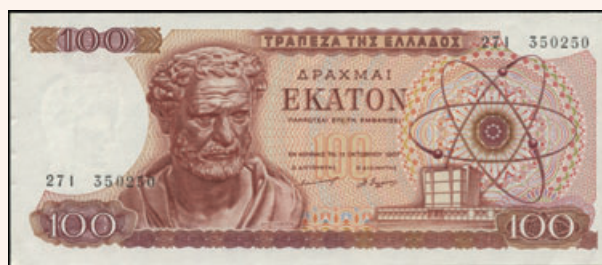
Lot: 6189 (50%)