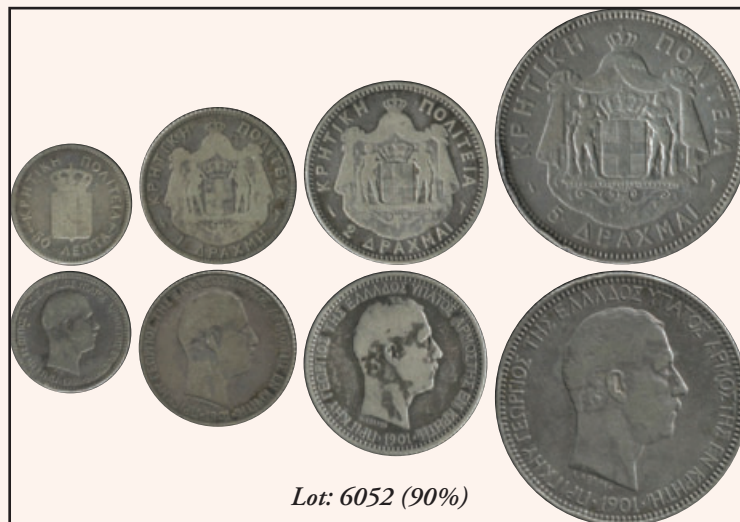
Lot: 6052 (90%)