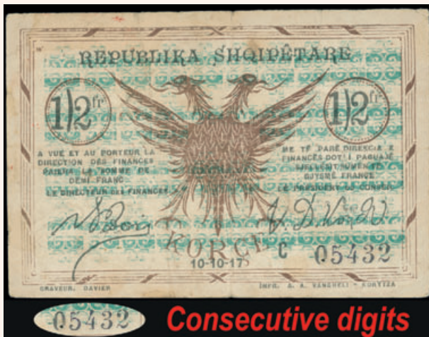
Lot: 6258 (75%)