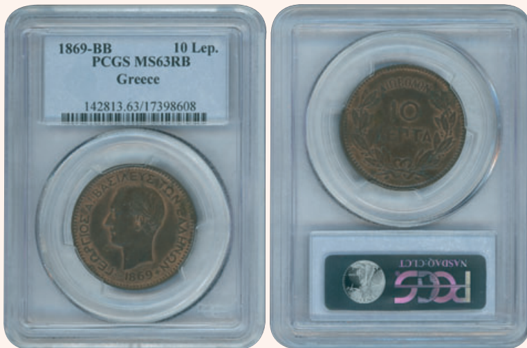
Lot: 6015 (80%)