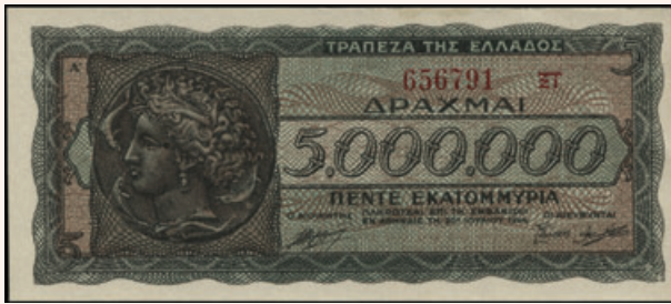
Lot: 6169 (55%)