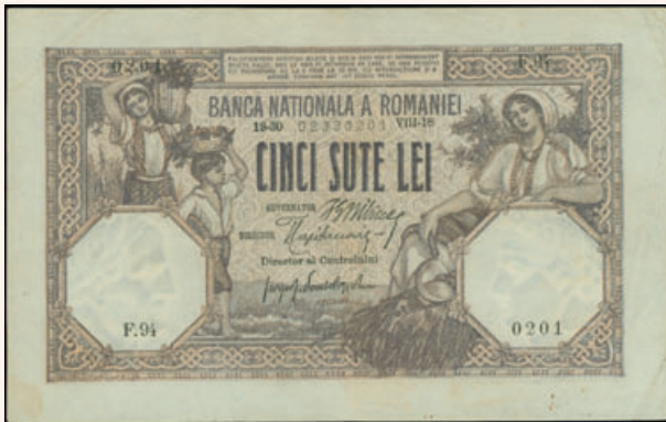
Lot: 6289 (50%)