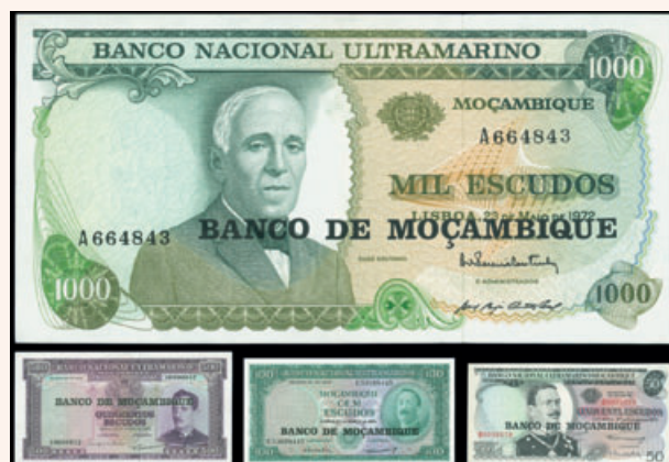
Lot: 6287 (45%)