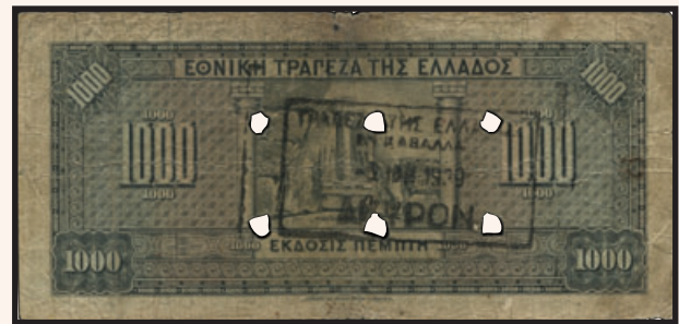
Lot: 6164 (40%)