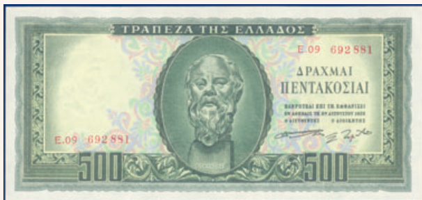
Lot: 6187 (50%)