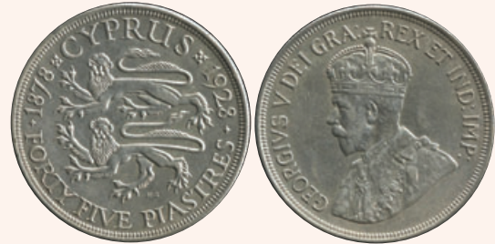
Lot: 6063 (90%)