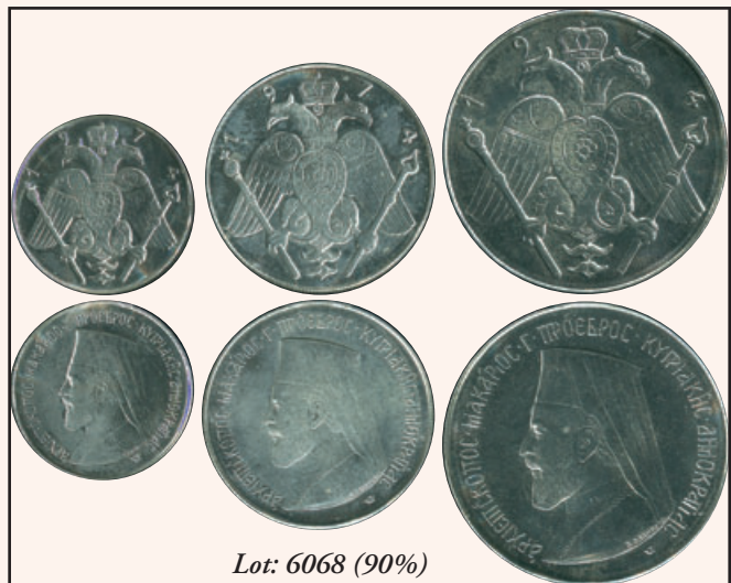
Lot: 6068 (90%)