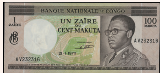
Lot: 6267 (50%)