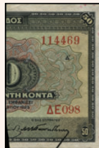
Lot: 6153 (55%)