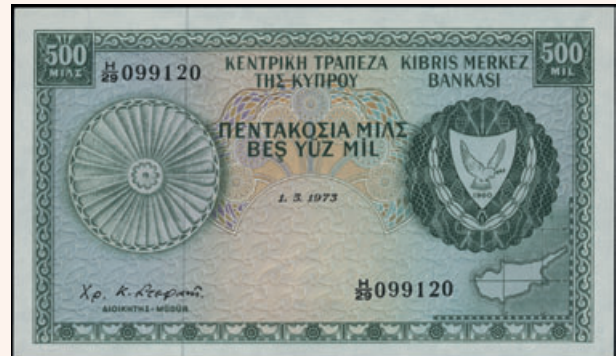
Lot: 6213 (55%)