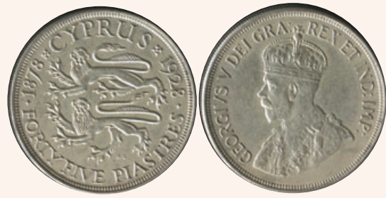
Lot: 6062 (90%)