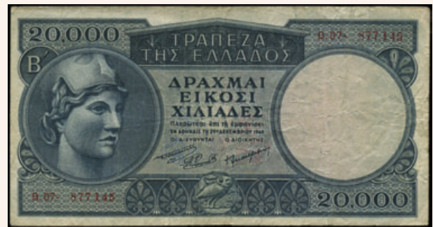
Lot: 6178 (50%)