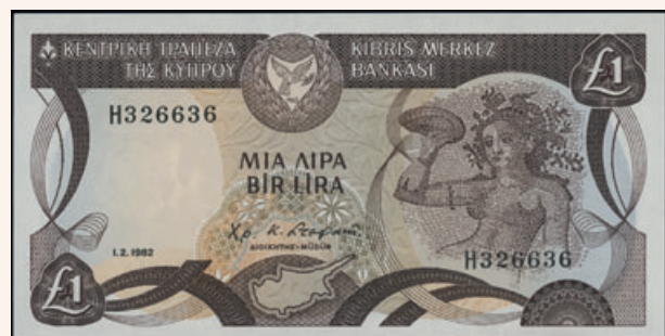
Lot: 6227 (55%)