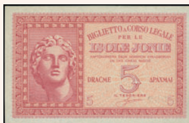
Lot: 6202 (65%)