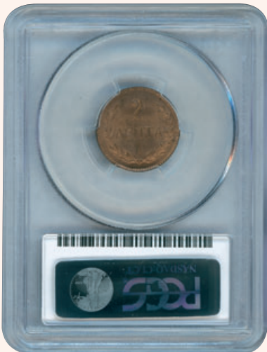
Lot: 6050 (80%)