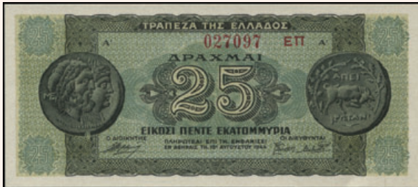
Lot: 6171 (55%)