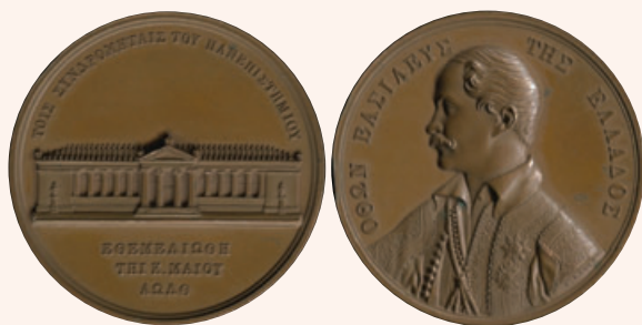
Lot: 6125 (85%)