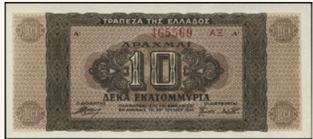
Lot: 6170 (55%)