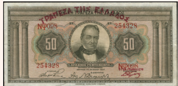
Lot: 6154 (50%)