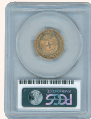
Lot: 6017 (80%)