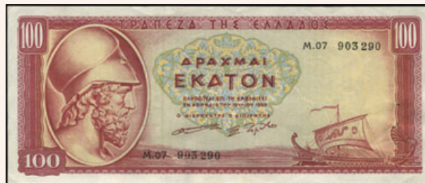
Lot: 6186 (50%)