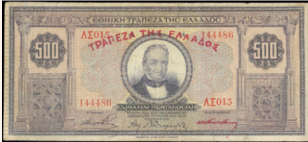
Lot: 6157 (45%)