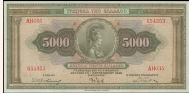
Lot: 6158 (40%)