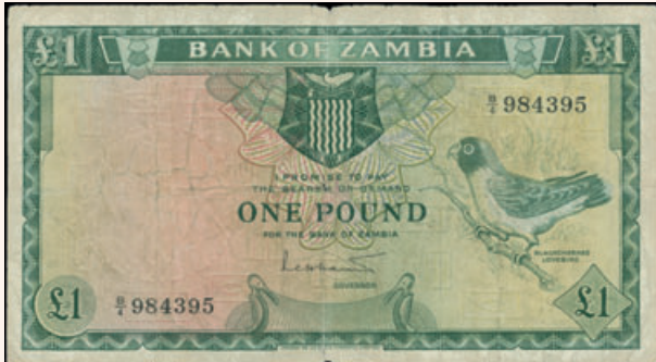
Lot: 6297 (55%)