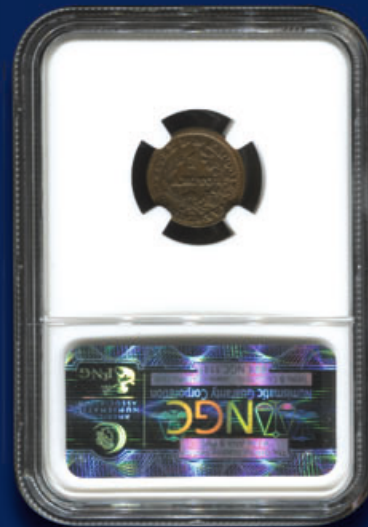
lot 6001 (80%)