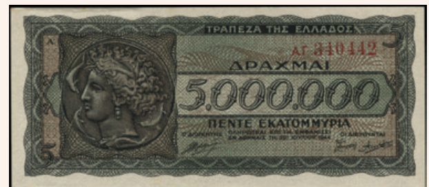
Lot: 6168 (55%)