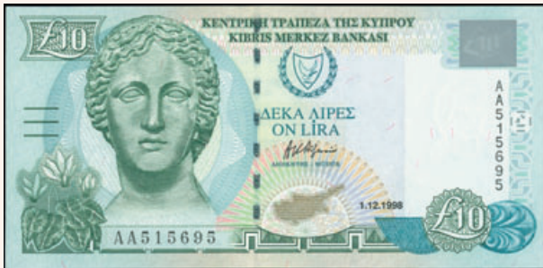
Lot: 6248 (50%)