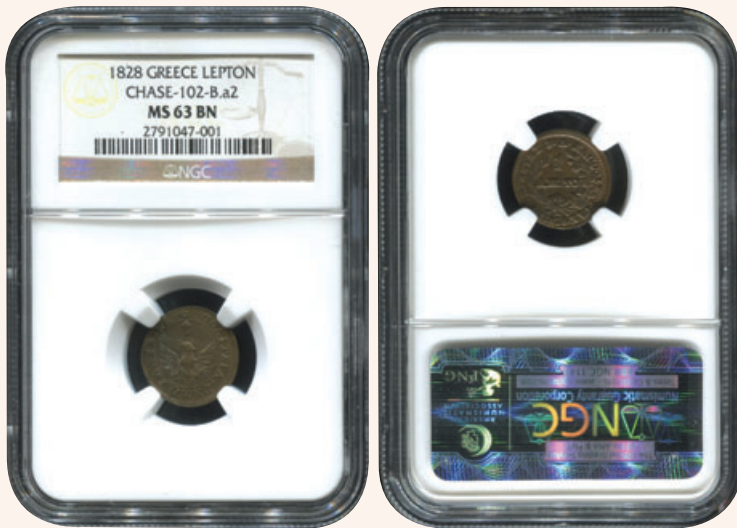
Lot: 6001 (80%)