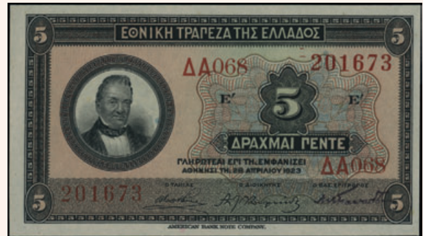
Lot: 6151 (75%)