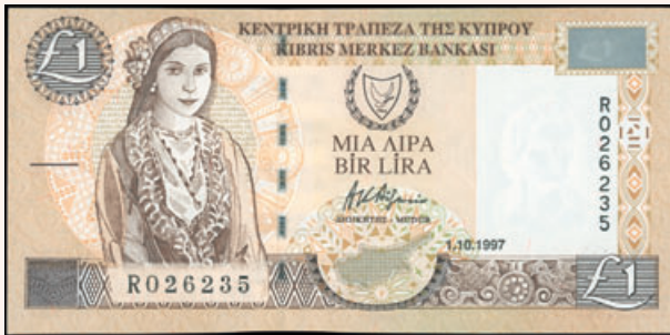
Lot: 6244 (55%)