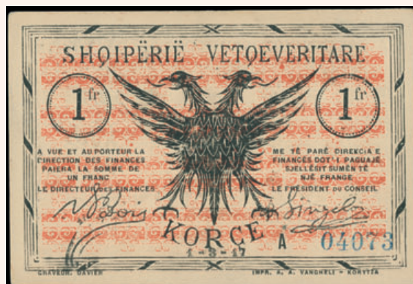
Lot: 6257 (75%)