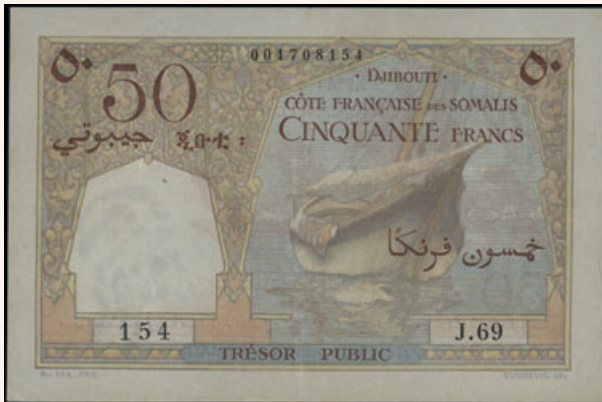
Lot: 6279 (65%)