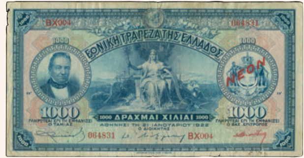
Lot: 6149 (35%)