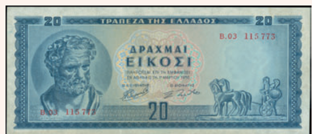
Lot: 6184 (50%)