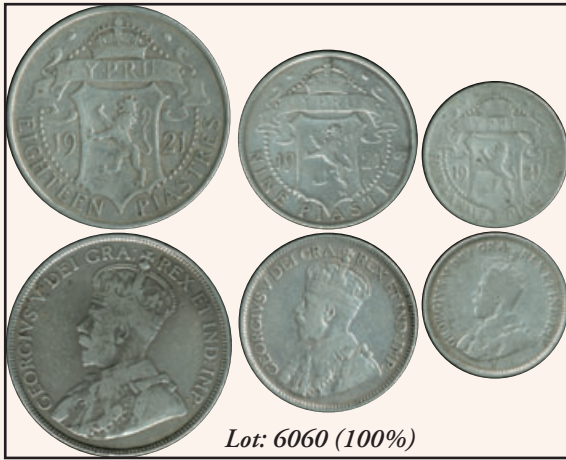
Lot: 6060 (100%)