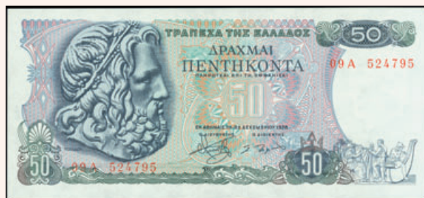
Lot: 6191 (55%)