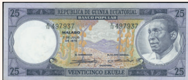
Lot: 6271 (55%)