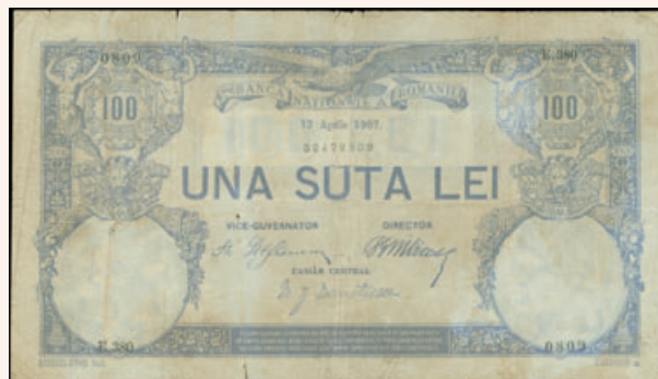
Lot: 6288 (40%)