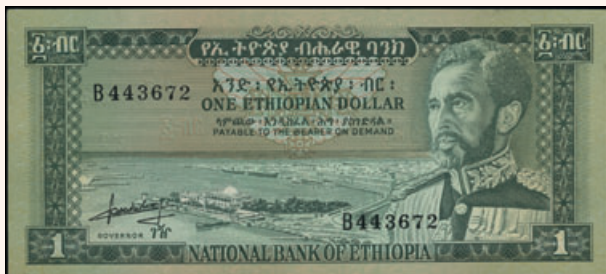
Lot: 6275 (55%)