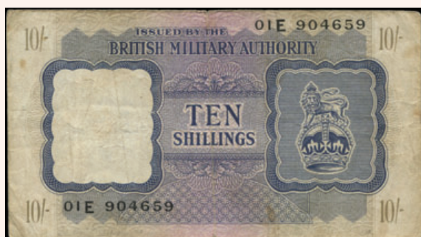
Lot: 6206 (55%)