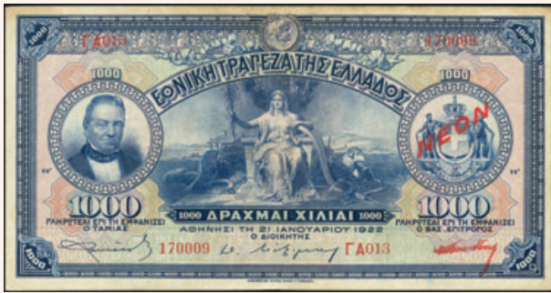
Lot: 6148 (35%)