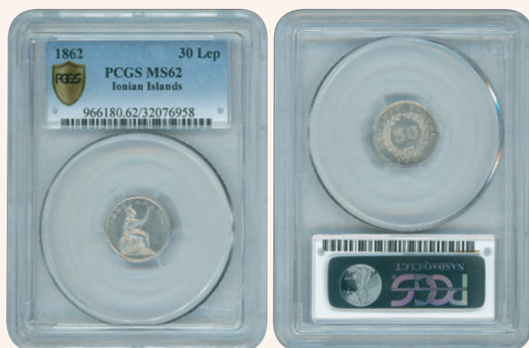
Lot: 6054 (80%)