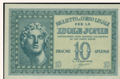
Lot: 6203 (65%)