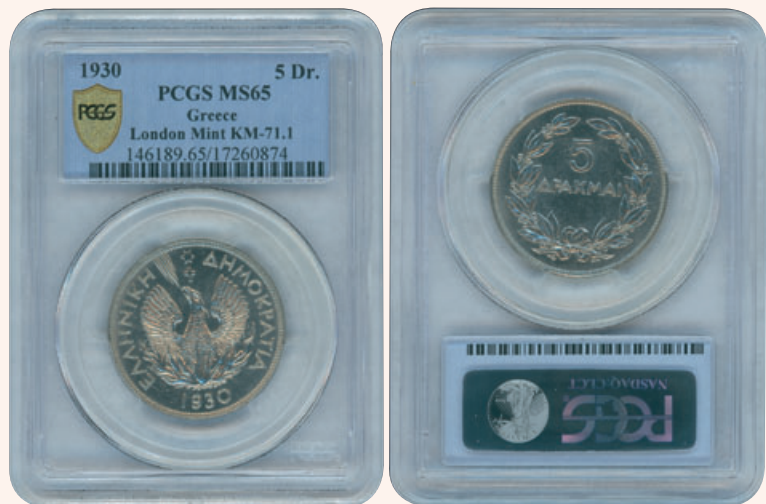
Lot: 6024 (80%)