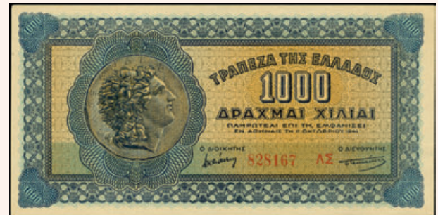
Lot: 6166 (45%)