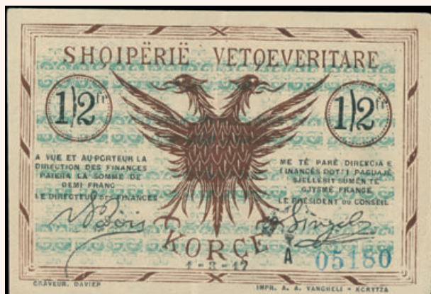
Lot: 6256 (75%)