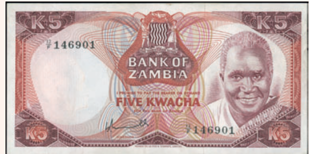
Lot: 6298 (55%)