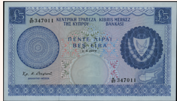
Lot: 6215 (50%)