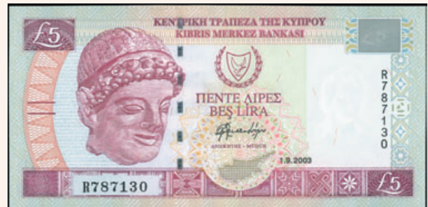
Lot: 6251 (55%)