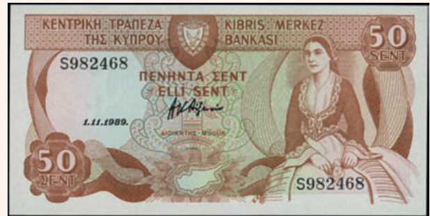
Lot: 6237 (60%)