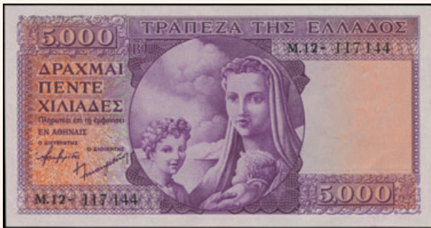
Lot: 6177 (50%)