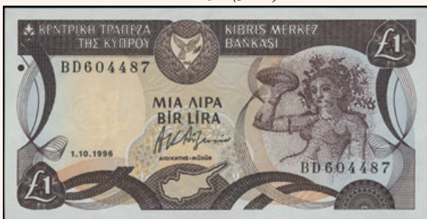
Lot: 6240 (55%)