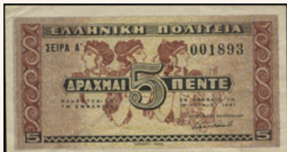
Lot: 6196 (60%)