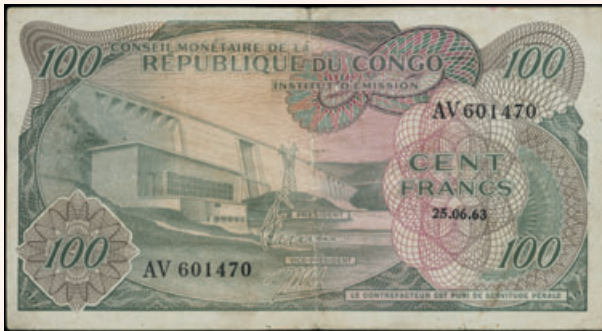
Lot: 6264 (55%)