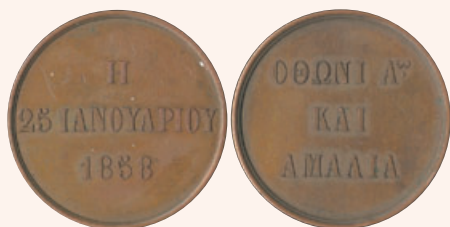
Lot: 6126 (85%)