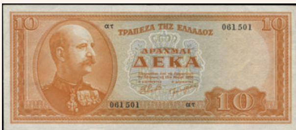
Lot: 6181 (50%)