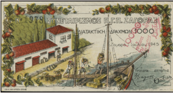
Lot: 6208 (60%)