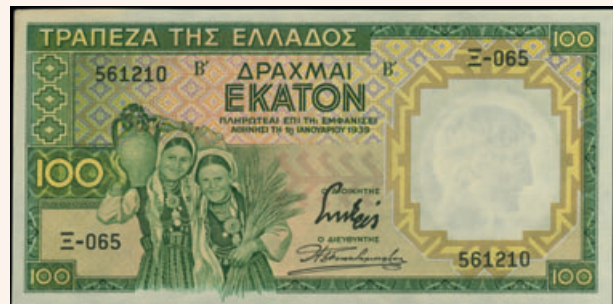
Lot: 6162 (50%)