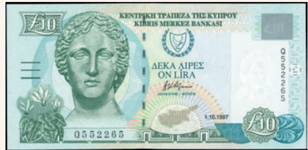
Lot: 6245 (50%)