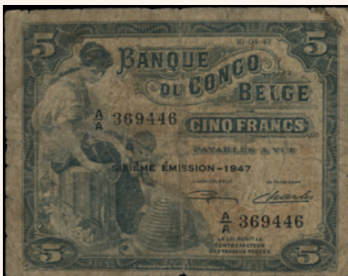
Lot: 6268 (65%)