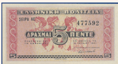
Lot: 6197 (60%)