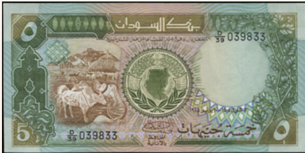
Lot: 6295 (55%)