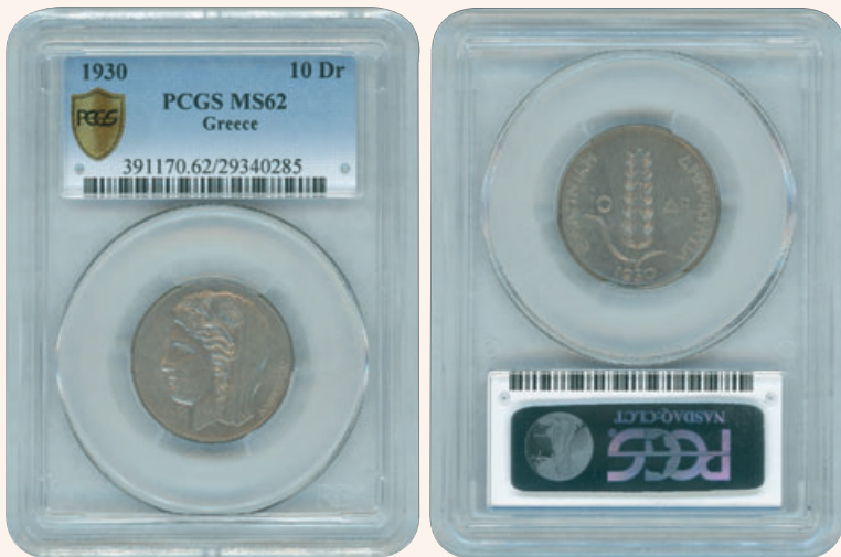
Lot: 6026 (80%)