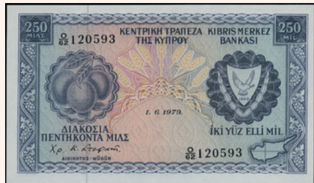
Lot: 6223 (65%)