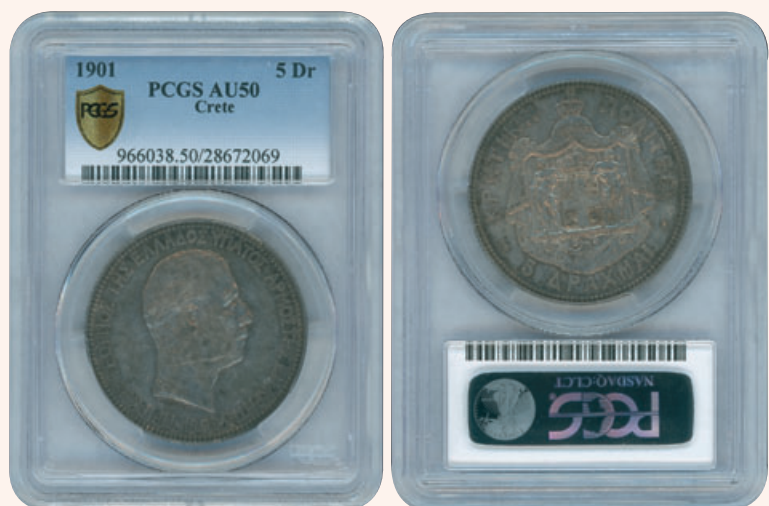
Lot: 6053 (80%)