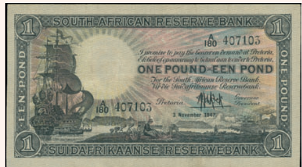
Lot: 6292 (55%)