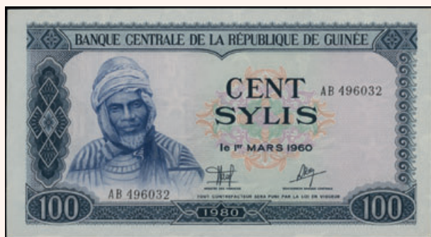
Lot: 6283 (45%)