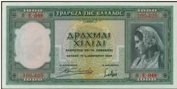
Lot: 6163 (45%)