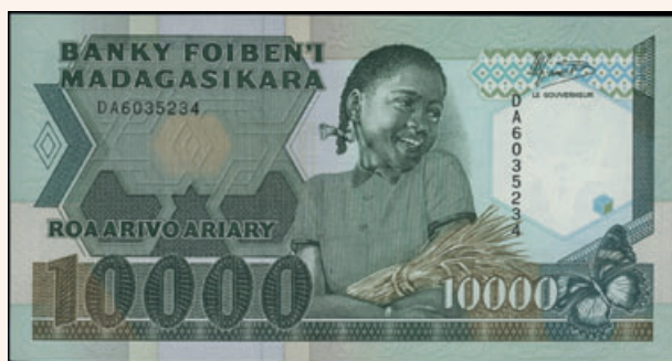
Lot: 6285 (45%)