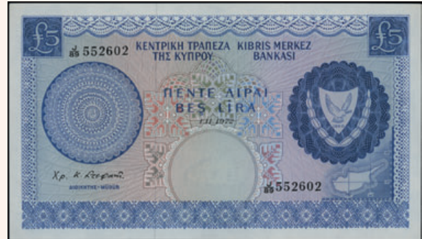
Lot: 6211 (50%)