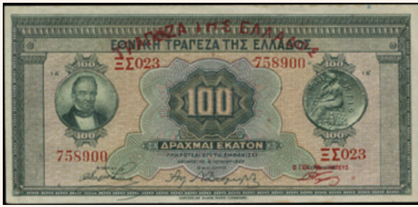
Lot: 6155 (50%)