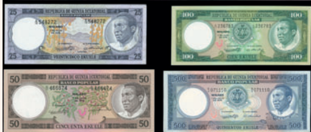
Lot: 6272 (45%)