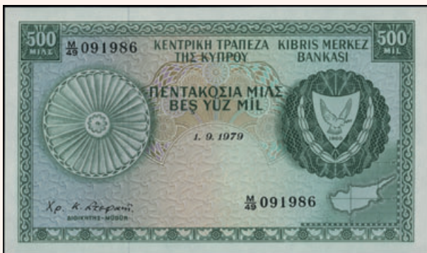
Lot: 6226 (55%)