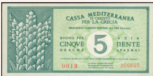
Lot: 6199 (70%)