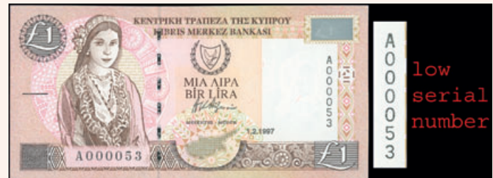
Lot: 6241 (50%)