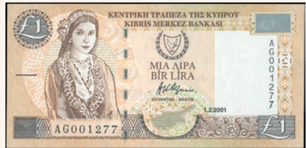
Lot: 6249 (55%)