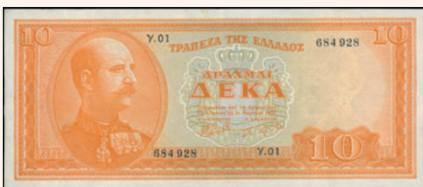
Lot: 6183 (50%)