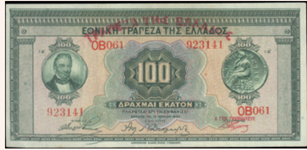
Lot: 6156 (50%)