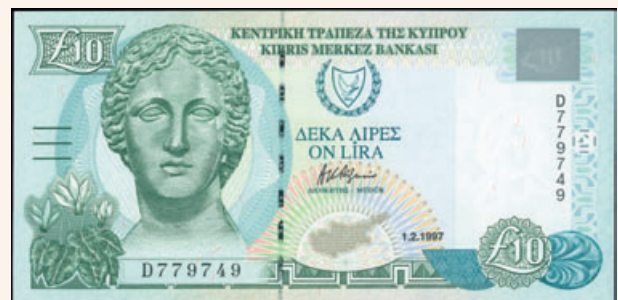
Lot: 6243 (50%)