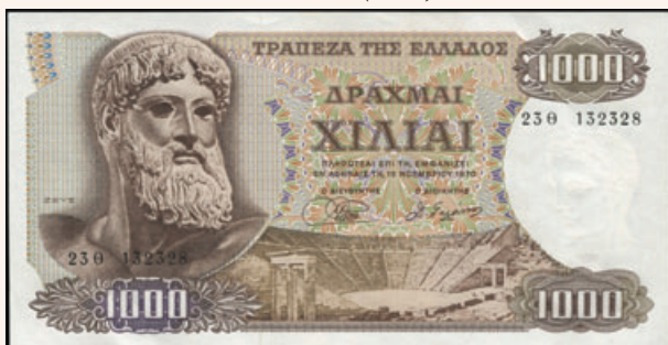
Lot: 6190 (50%)