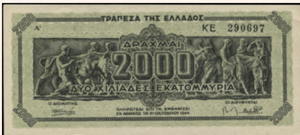
Lot: 6173 (55%)