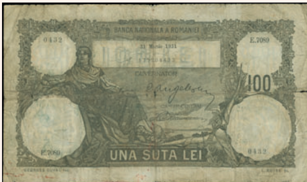
Lot: 6291 (40%)