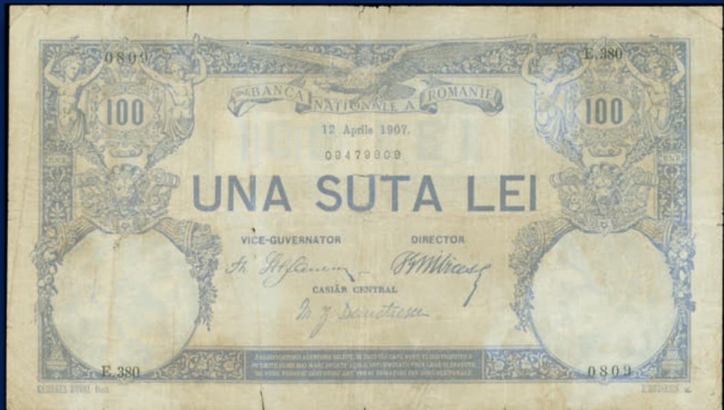
lot 6288 (75%)