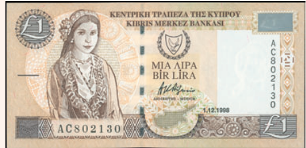
Lot: 6247 (55%)