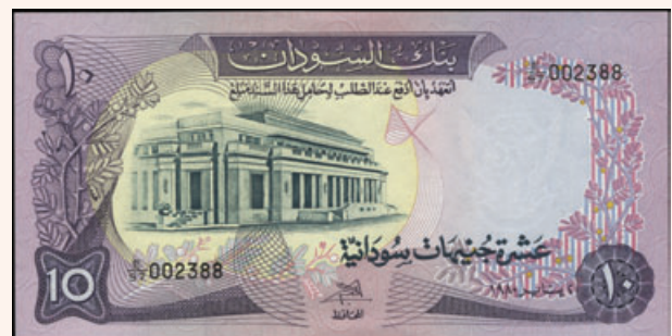
Lot: 6294 (50%)