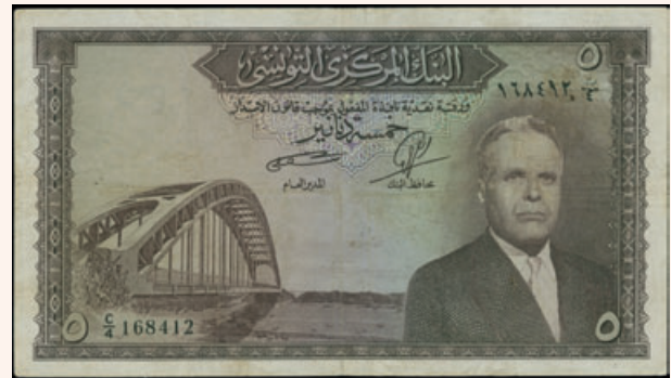
Lot: 6296 (50%)