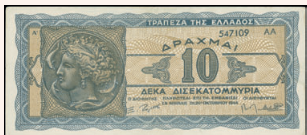
Lot: 6174 (55%)