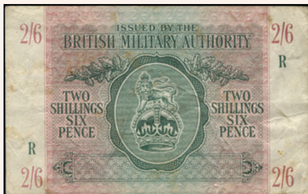
Lot: 6204 (70%)