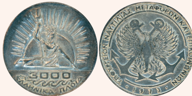
Lot: 6127 (85%)