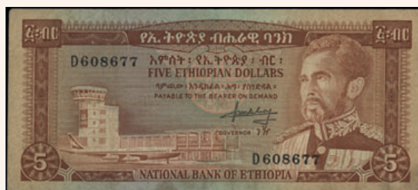
Lot: 6276 (55%)