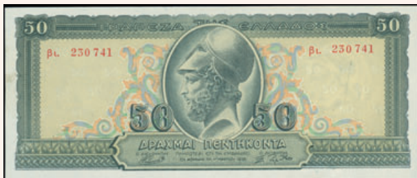
Lot: 6185 (50%)