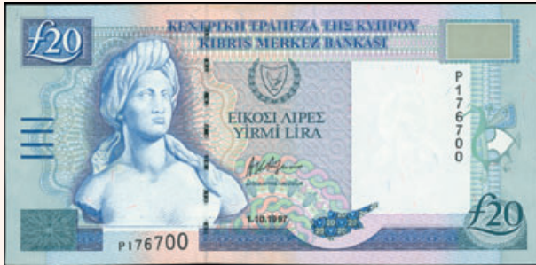
Lot: 6246 (50%)