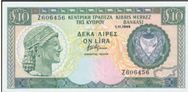
Lot: 6238 (50%)