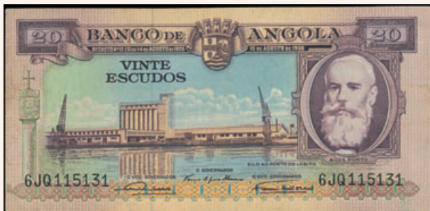
Lot: 6260 (60%)