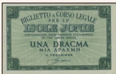
Lot: 6201 (65%)