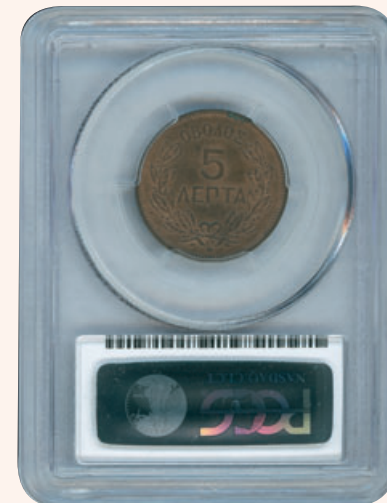
Lot: 6013 (80%)