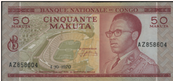
Lot: 6266 (55%)