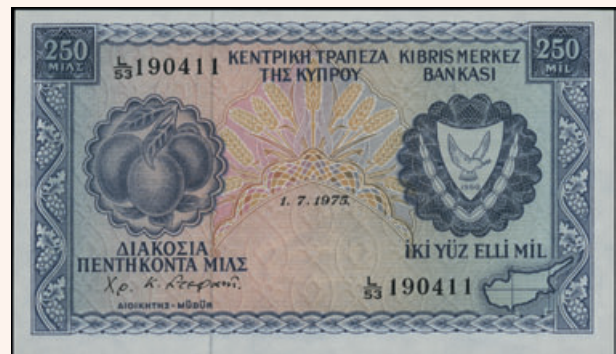
Lot: 6219 (65%)