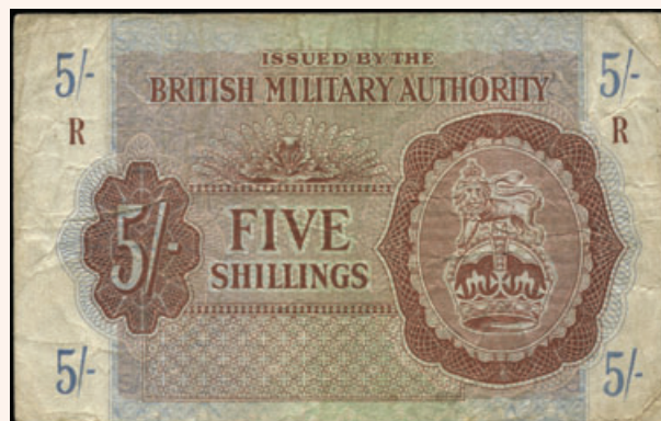
Lot: 6205 (70%)