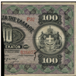
Lot: 6152 (40%)