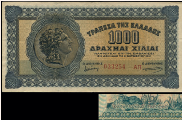
Lot: 6165 (45%)