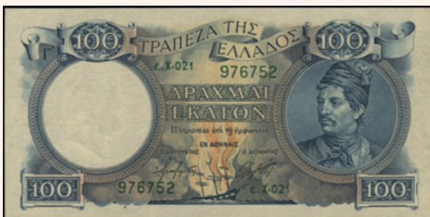
Lot: 6175 (55%)