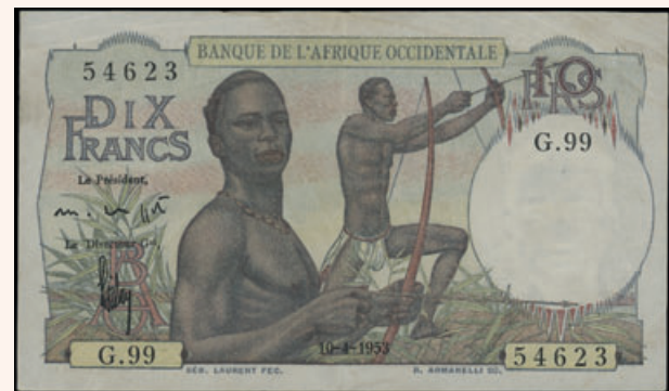
Lot: 6280 (65%)