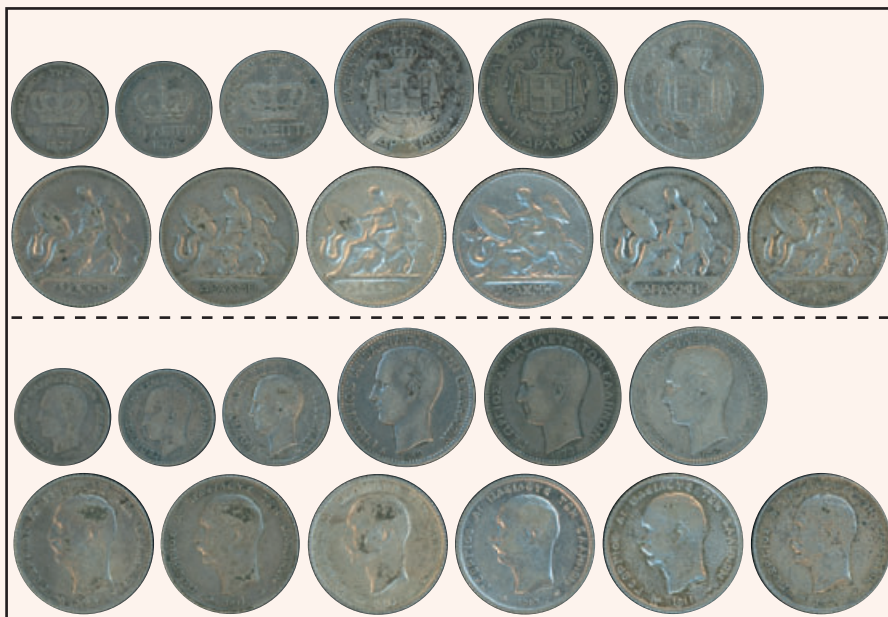
Lot: 6011 (80%)