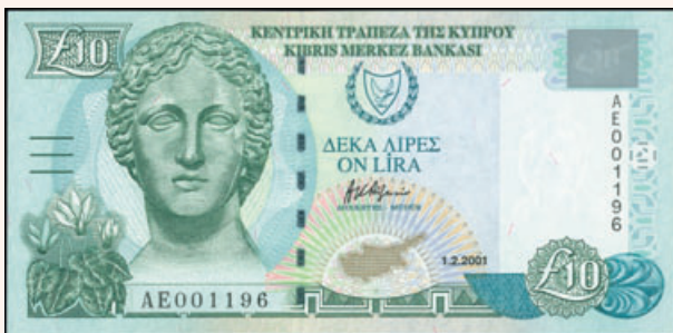
Lot: 6250 (50%)