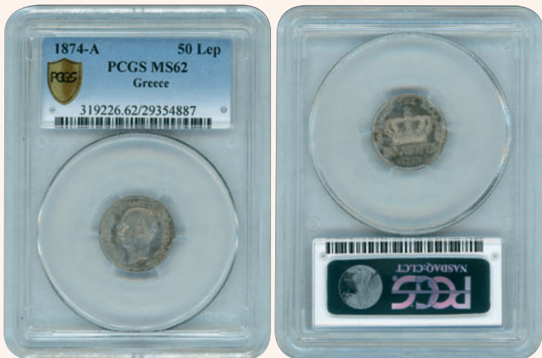
Lot: 6016 (80%)