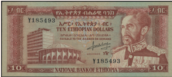
Lot: 6277 (55%)