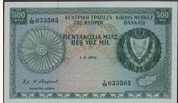
Lot: 6217 (55%)