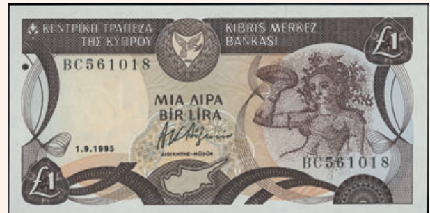
Lot: 6239 (55%)