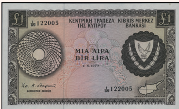
Lot: 6218 (55%)