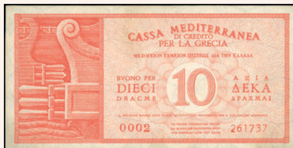
Lot: 6200 (70%)