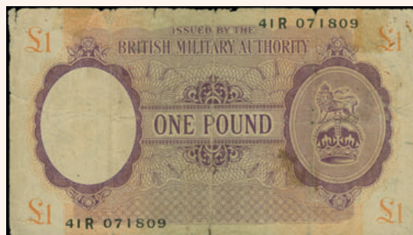
Lot: 6207 (55%)