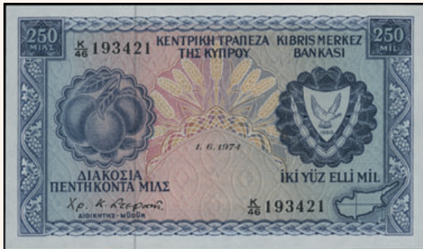
Lot: 6216 (65%)