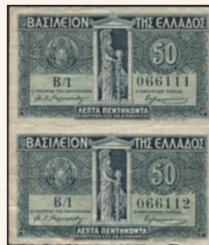
Lot: 6192 (60%)