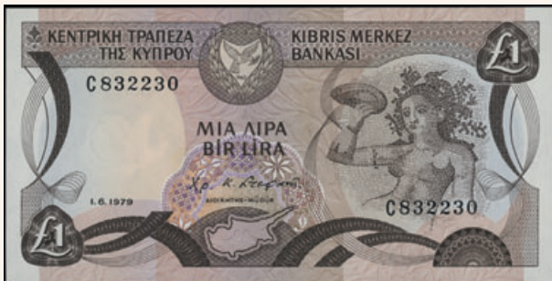
Lot: 6224 (55%)