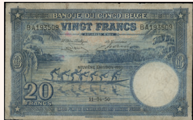
Lot: 6269 (55%)