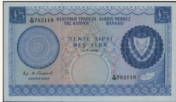
Lot: 6221 (50%)