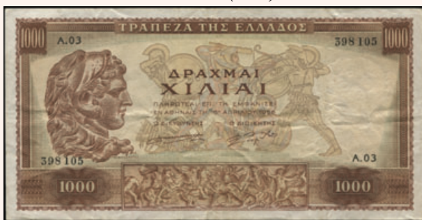
Lot: 6188 (50%)