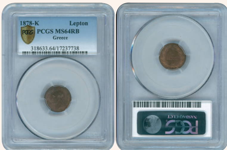
Lot: 6018 (80%)