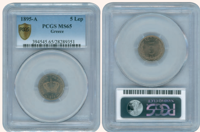
Lot: 6020 (80%)