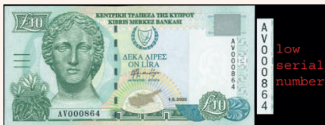
Lot: 6252 (45%)