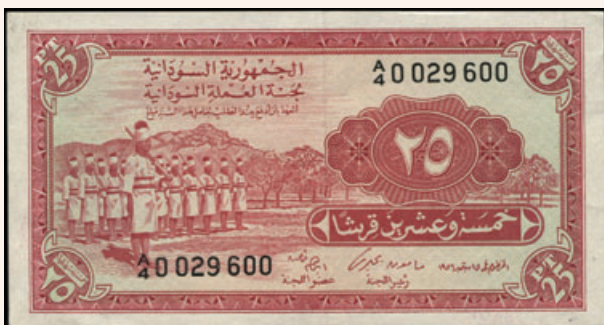
Lot: 6293 (65%)