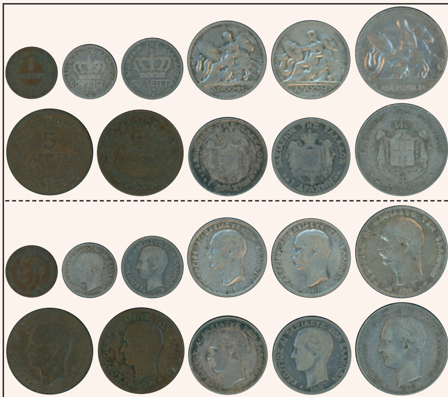
Lot: 6010 (90%)