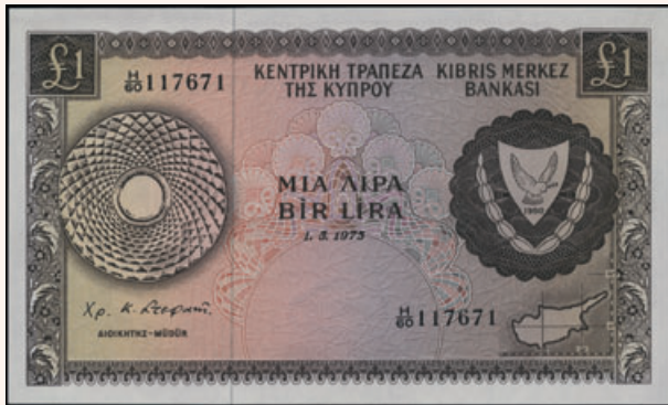
Lot: 6214 (55%)