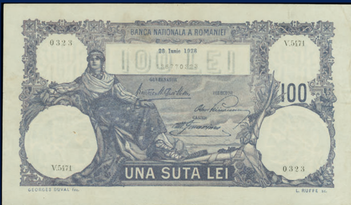
lot 6290 (75%)