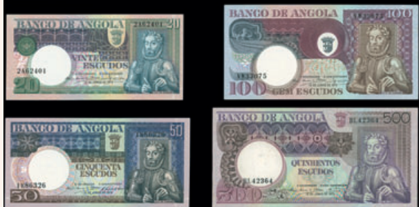
Lot: 6261 (50%)