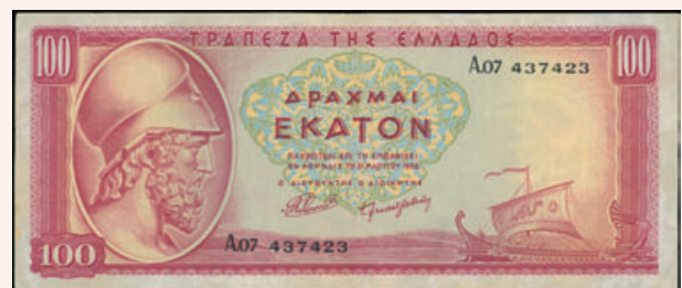
Lot: 6182 (50%)