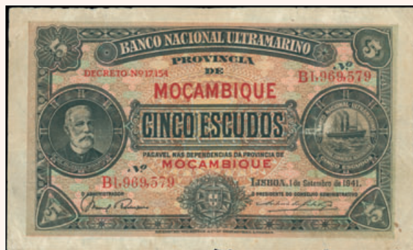
Lot: 6286 (50%)