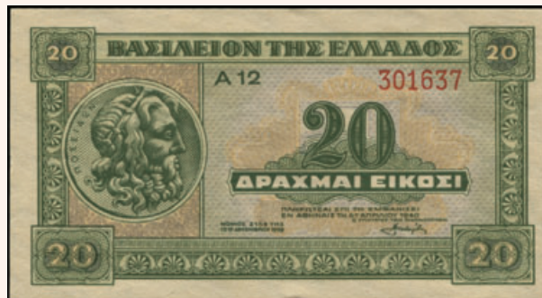
Lot: 6195 (70%)