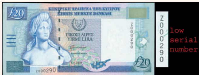
Lot: 6254 (40%)