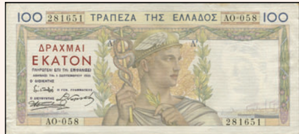
Lot: 6160 (40%)