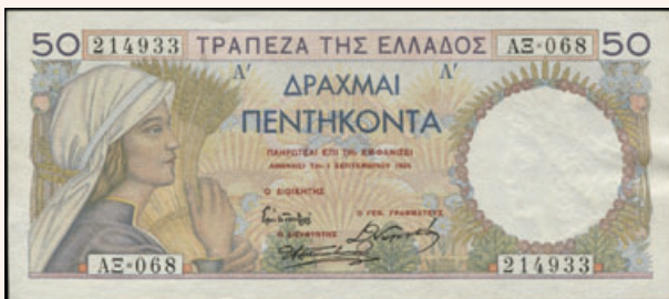
Lot: 6159 (45%)