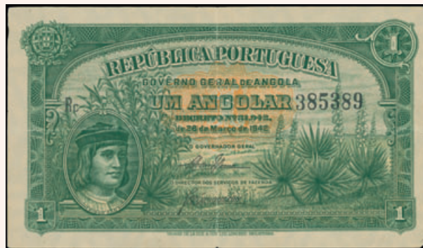
Lot: 6259 (65%)