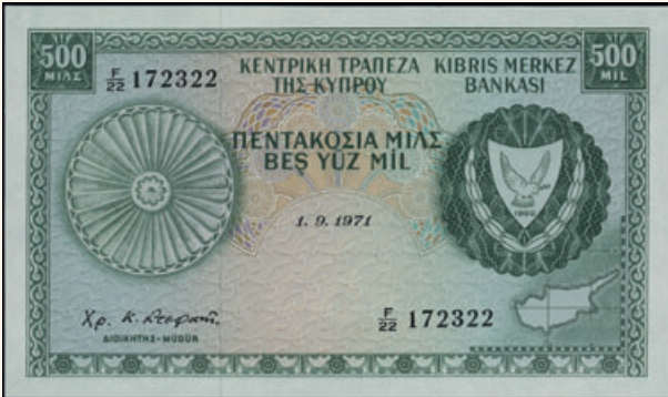
Lot: 6210 (55%)