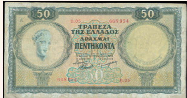
Lot: 6180 (55%)