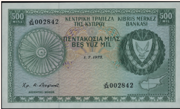
Lot: 6220 (55%)