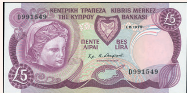
Lot: 6225 (55%)