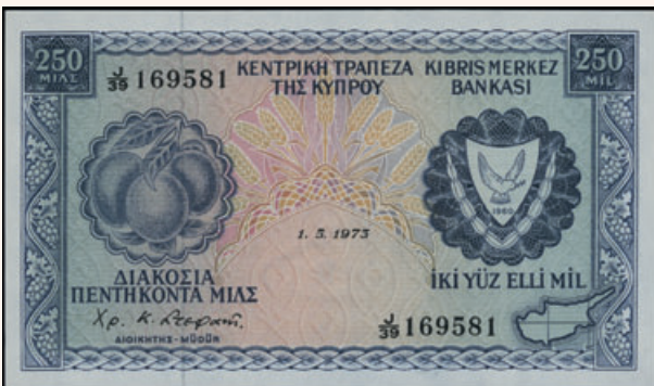
Lot: 6212 (65%)