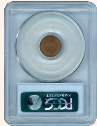
Lot: 6051 (80%)