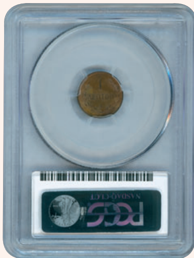
Lot: 6049 (80%)