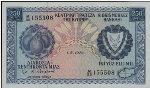
Lot: 6222 (65%)