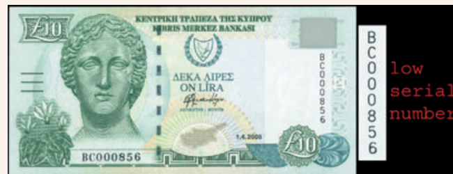
Lot: 6255 (40%)