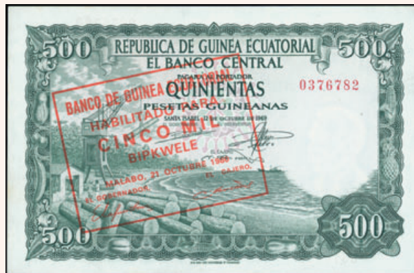
Lot: 6273 (55%)