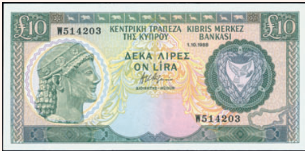
Lot: 6236 (50%)