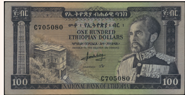
Lot: 6278 (55%)