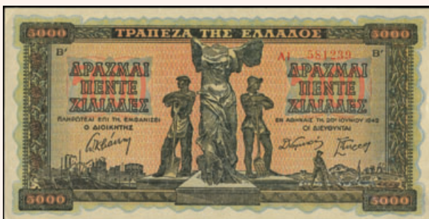
Lot: 6167 (50%)