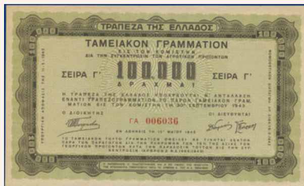
Lot: 6198 (40%)