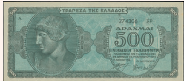
Lot: 6172 (55%)