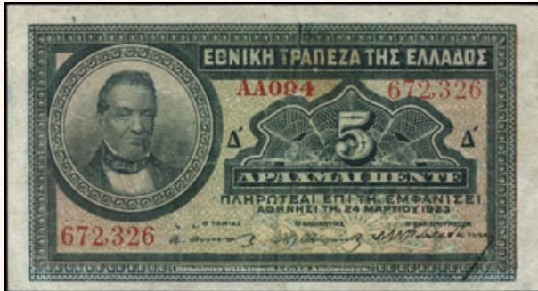
Lot: 6150 (70%)