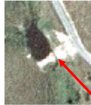
Aerial photo from 2005