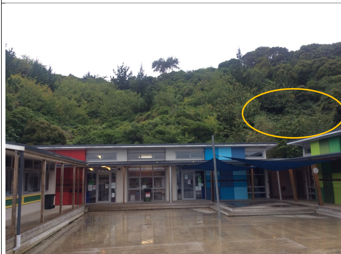
Photo 8. The approximate extent of the black-pohuehue vineland community.