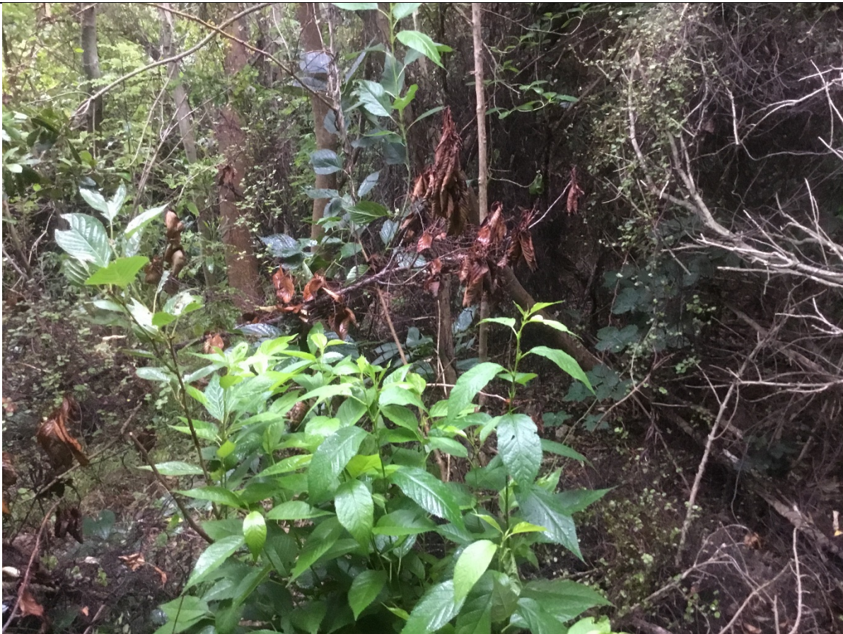
Photo 4. Juvvenile wild cherry, blackberry and pohuehue on the track within the Australian blackwood forest and treeland community.