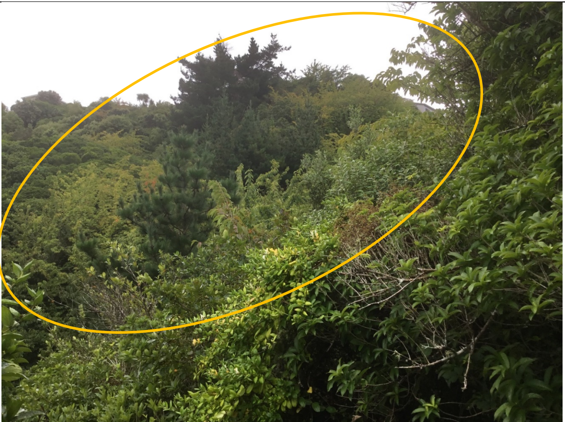
Photo 6. A large area of wild cherry forest and treeland community on the northern slopes, with occasional emergent pines.