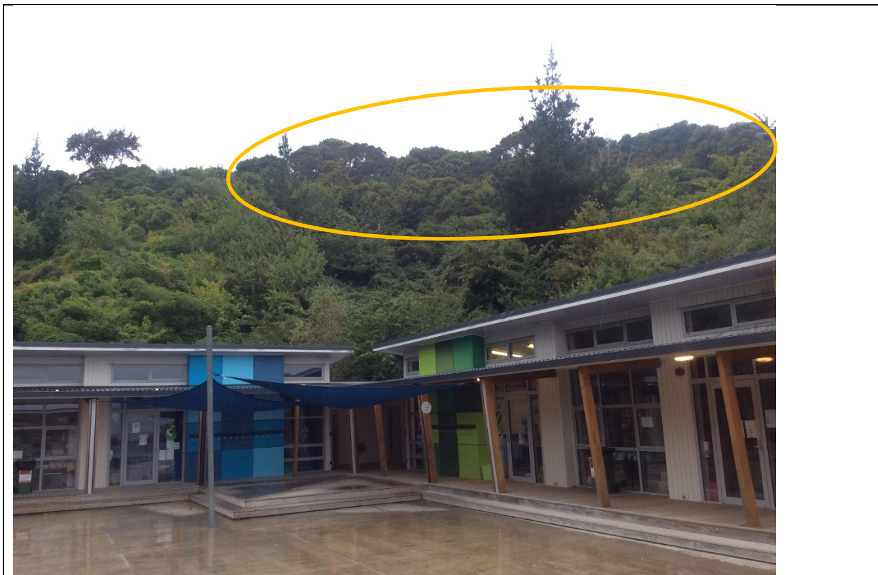
Photo 1. The orange polygon indicates the approximate extent of the Australian blackwood forest and treeland community.