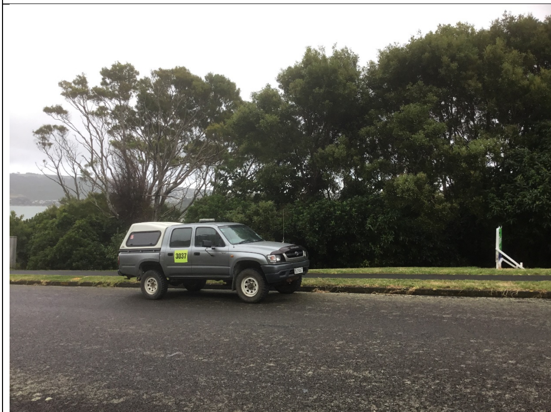
Photo 2. View of the top of Australian blackwood forest and treeland community from the road.