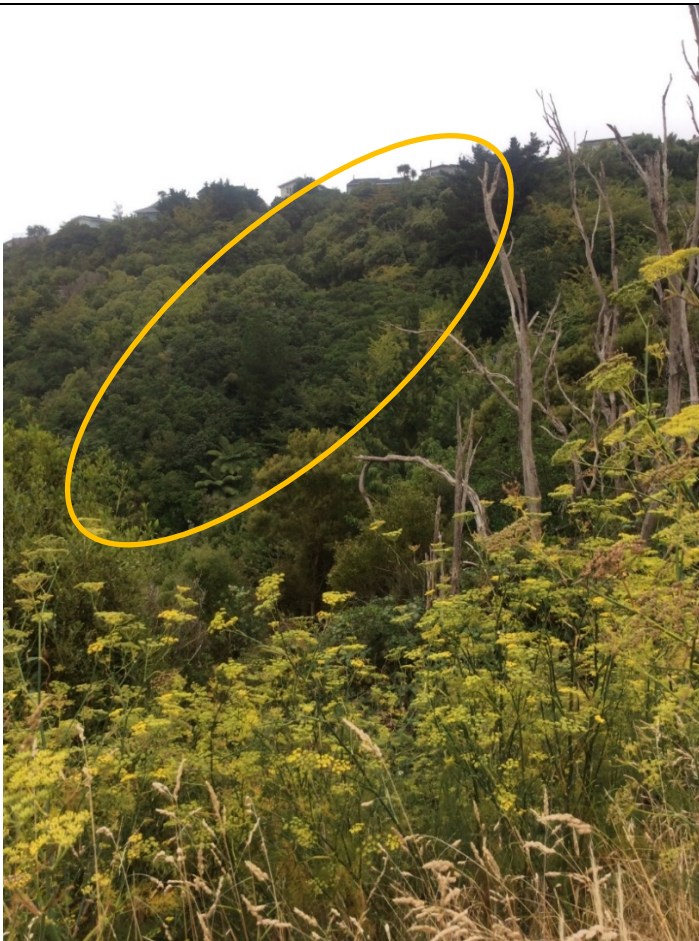
Photo 10. The approximate extent of the mahoe -fivefinger scrub and low forest which sits on slopes below Moray Place Playground. Most of the trees at the top of the image are a planted area around the playground.