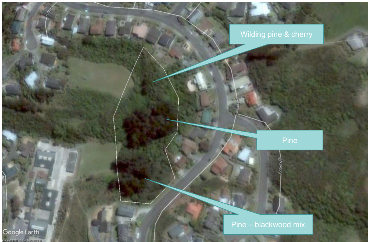
Figure 1: Distribution of Blackwood, Pine and wild cherry in 2002. The surrounding communities cannot be determined from this image.

Figure 2, on the following page, shows the current vegetation communities found within the 82 Eskdale Road property. We understand that the proposed residential development would occur along Eskdale Road, entirely within Plant Community 1: Australian blackwood treeland and forest .