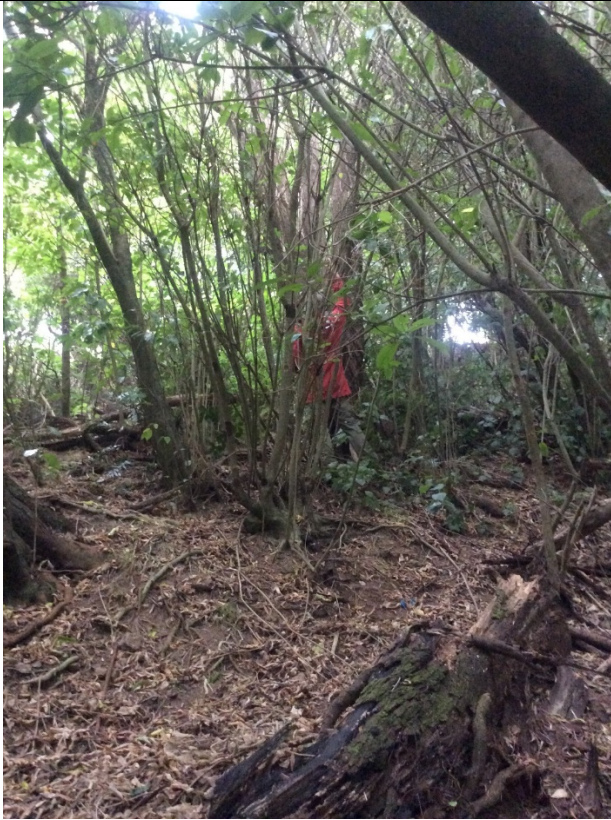
Photo 3. The interior of the Australian blackwood forest and treeland. Rotting pine in foreground. Larger stems of blackwood canopy. Smaller stems are mahoe understory.