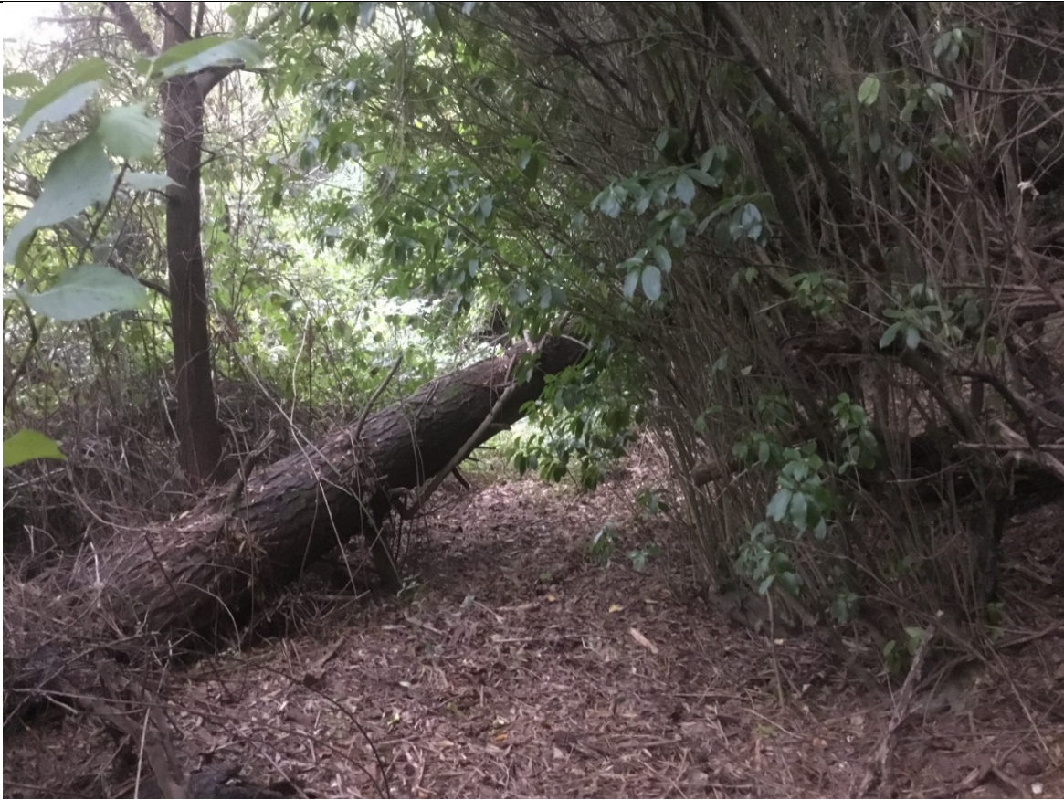
Photo 5. A felled pine tree within the Australian blackwood forest and treeland community. Typical mahoe shrub in the understorey on the right. Deep leaf litter of Australian blackwood.