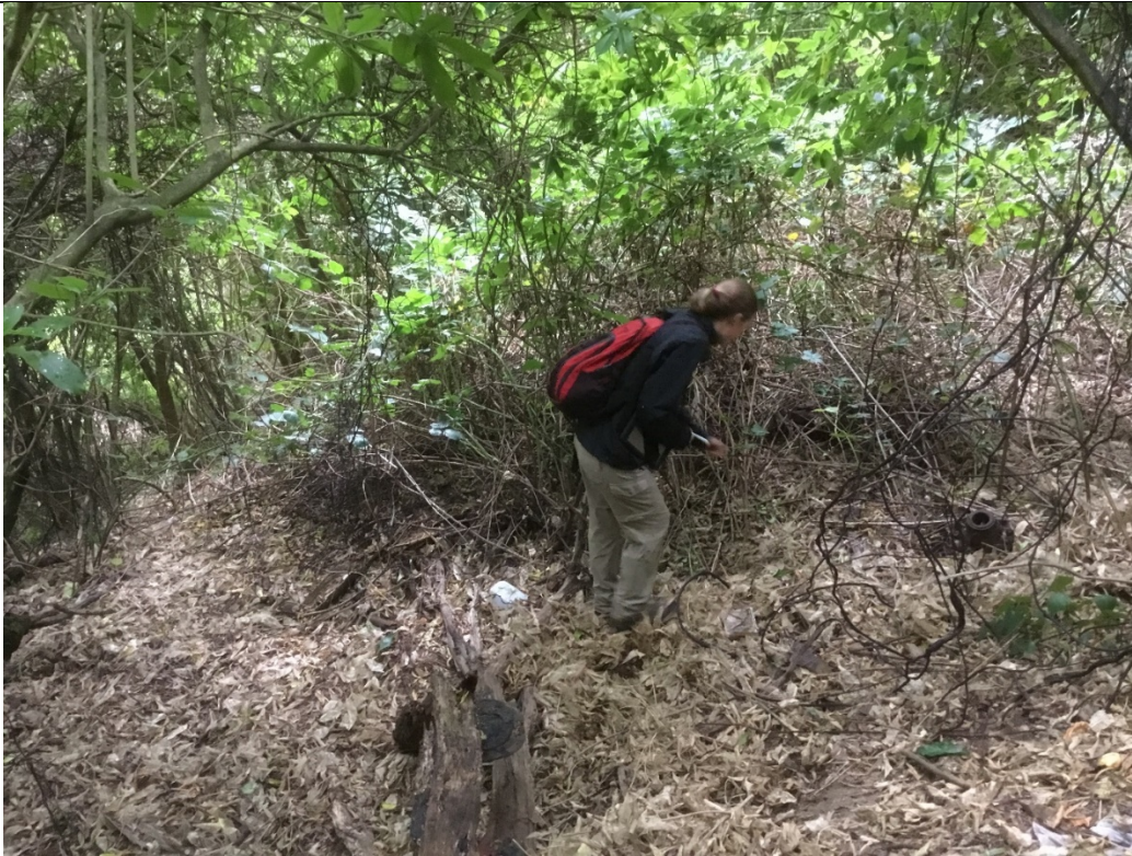
Photo 9. The edge of the blackberry and pohuehue community. Deep leaf litter of Australian blackwood treeland over mahoe.