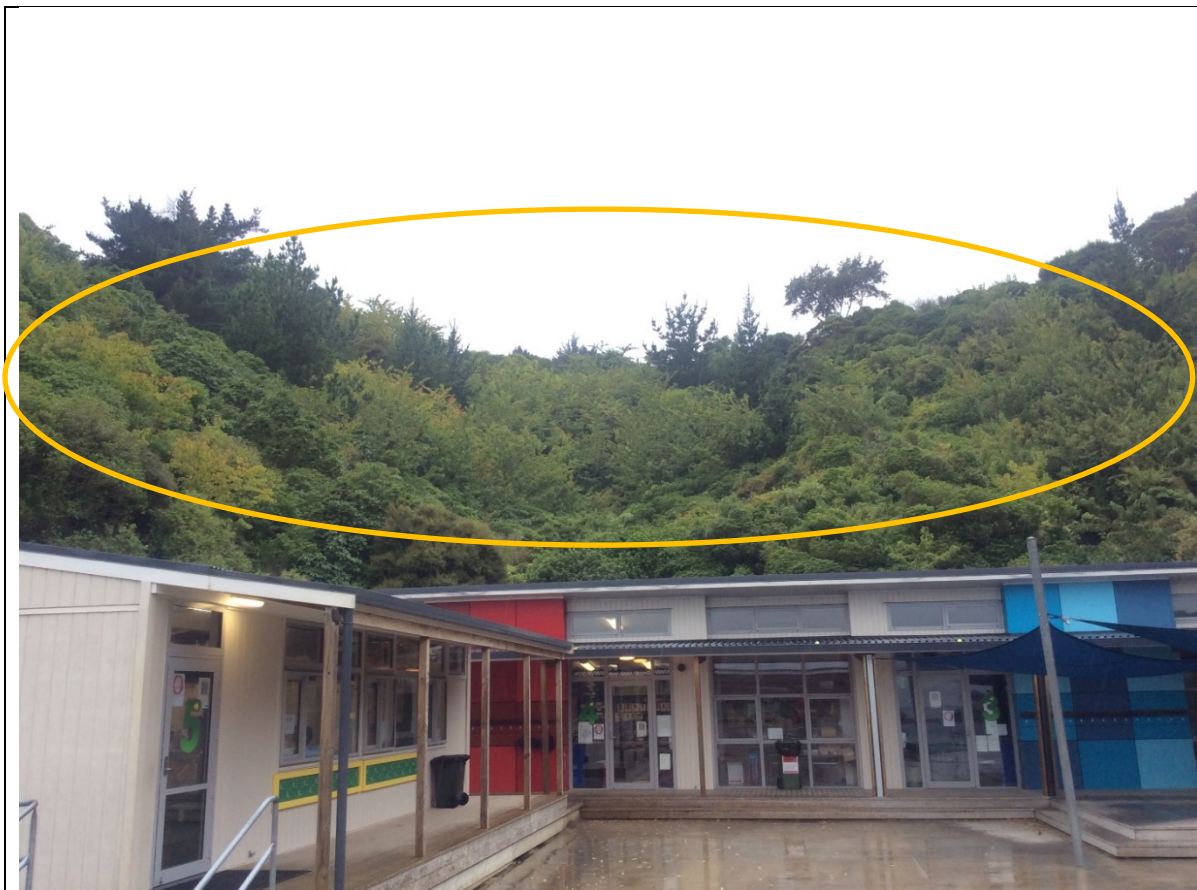
Photo 7. The approximate extent of the wild cherry forest and treeland community in the upper gully as viewed from Papakowhai Primary School.