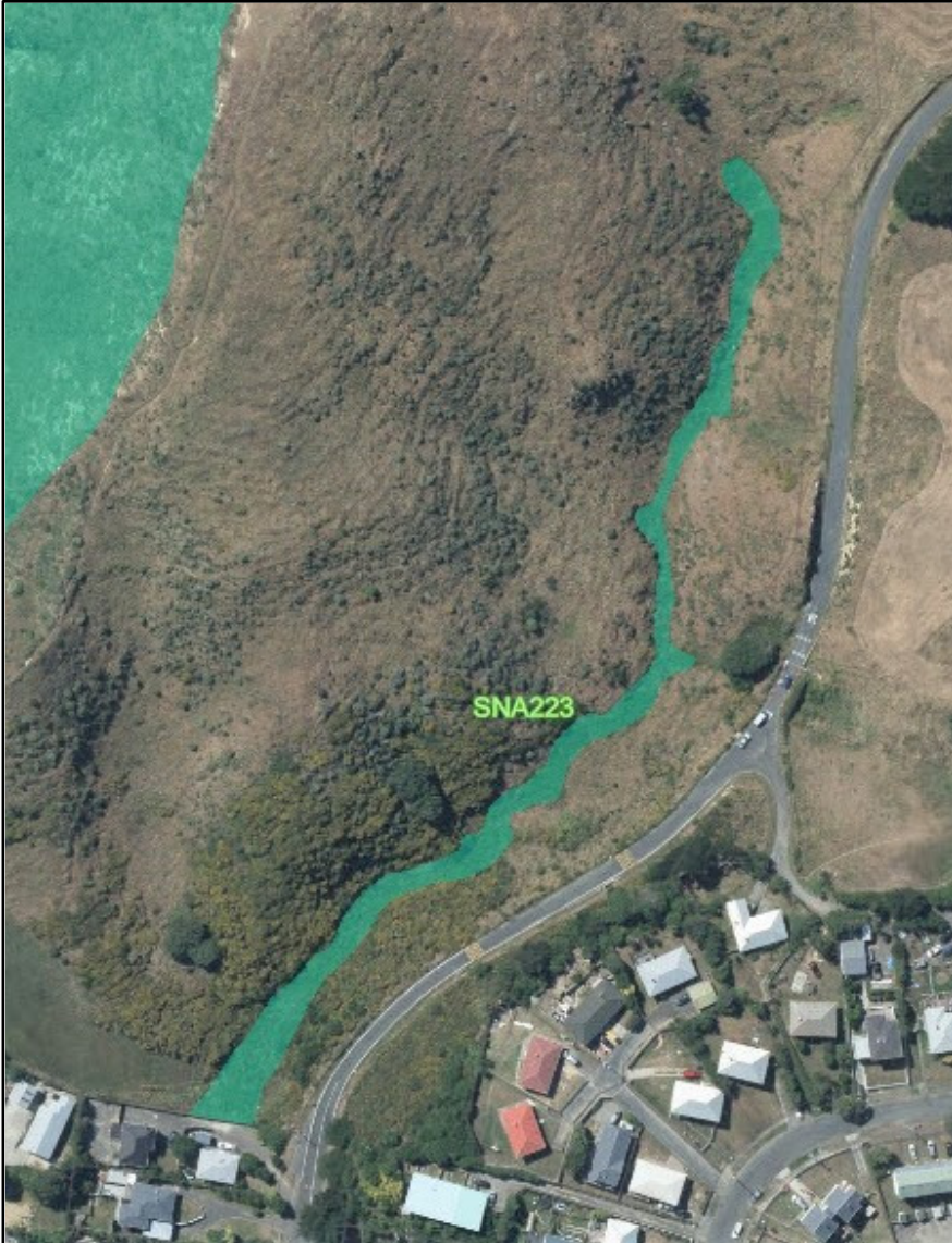
Figure 6: SNA223

A description for SNA223 must be included in SCHED 7.