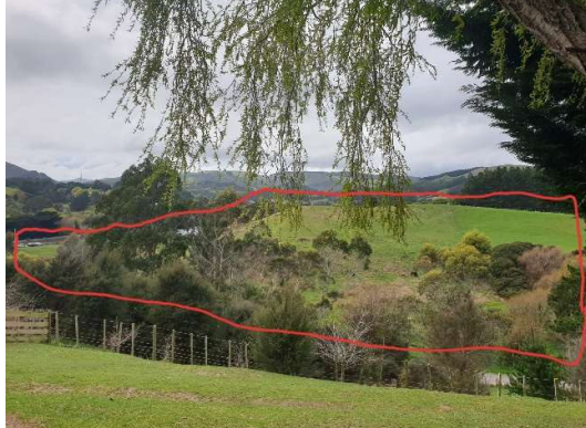
View from 42 Murphys Road of 10 Murphys Rd.

In particular No. 35 and 41 Murphys Road which are mainly hills and both of which have waterways/streams running through them. This part of Murphys Road is particularly affected by flooding when there is a major weather event.