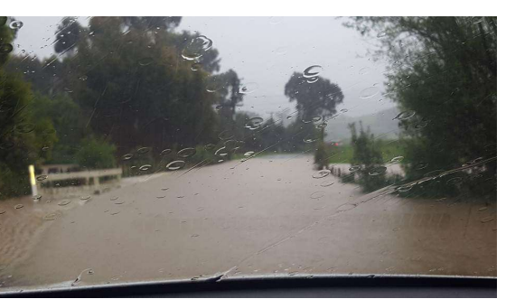
Flooding lower Murphys between 10 and 42

Added to these are No. 2 and 50 Flightys Road and No. 237 Paremata Haywards Rd, which also have a stream running through them and are prone to major flooding.