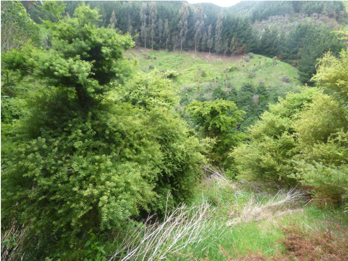
Fig. 3. Plantation of totara, with some Rewarewa and Acacia (Block E). A block of Puriri in mid-background.