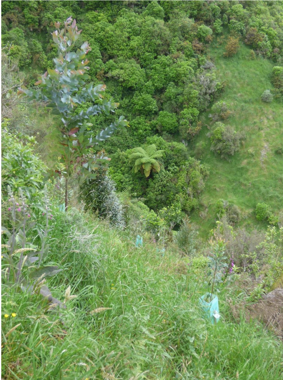
Fig. 6A Looking S down eucalypt windbreak W8 from the track.. Also visible are Banksia and further down, Rewarewa plantings.