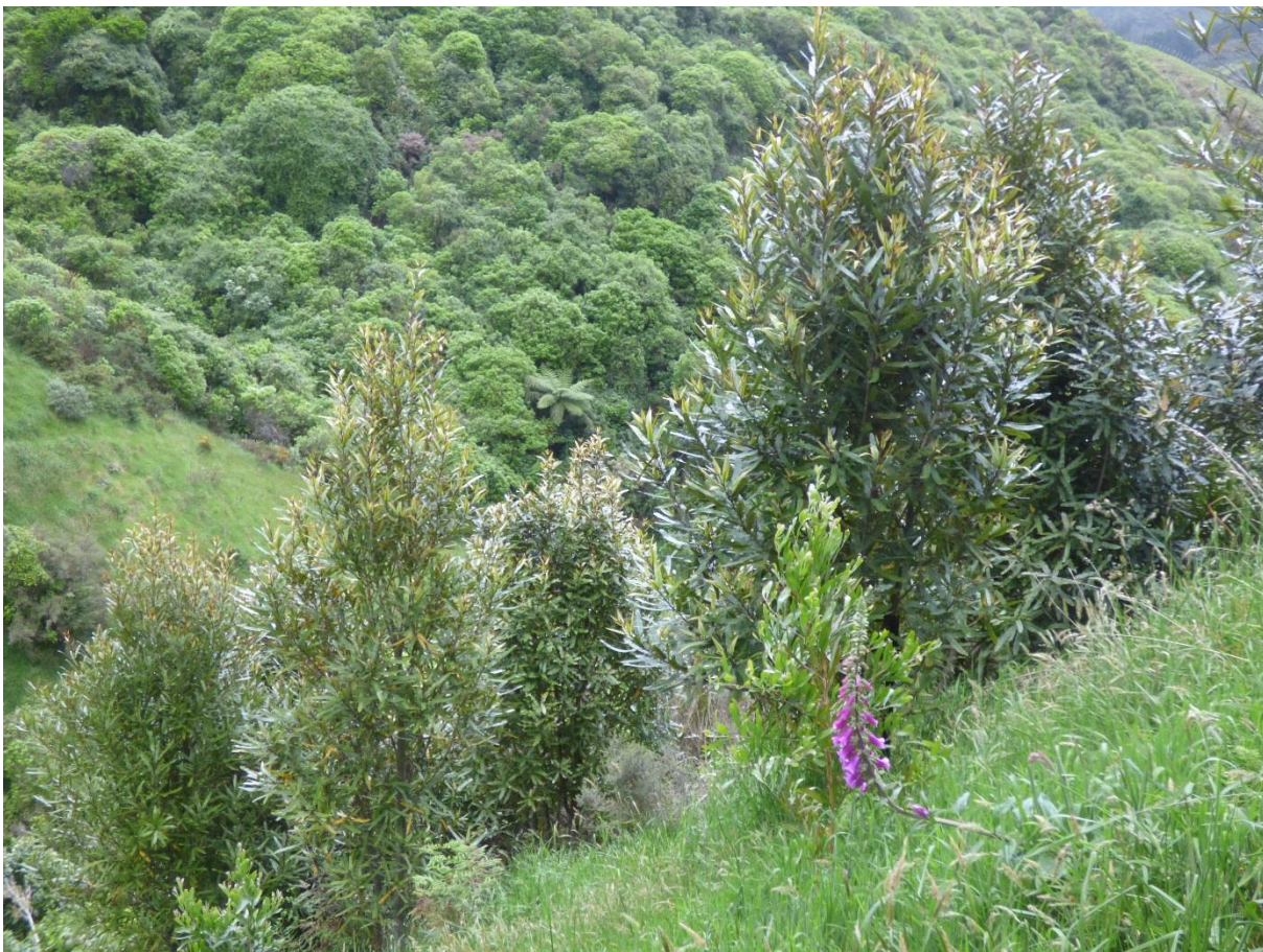
Fig. 4 Plantation of Rewarewa and Acacia melanoxylon forming the southern third of Block B.