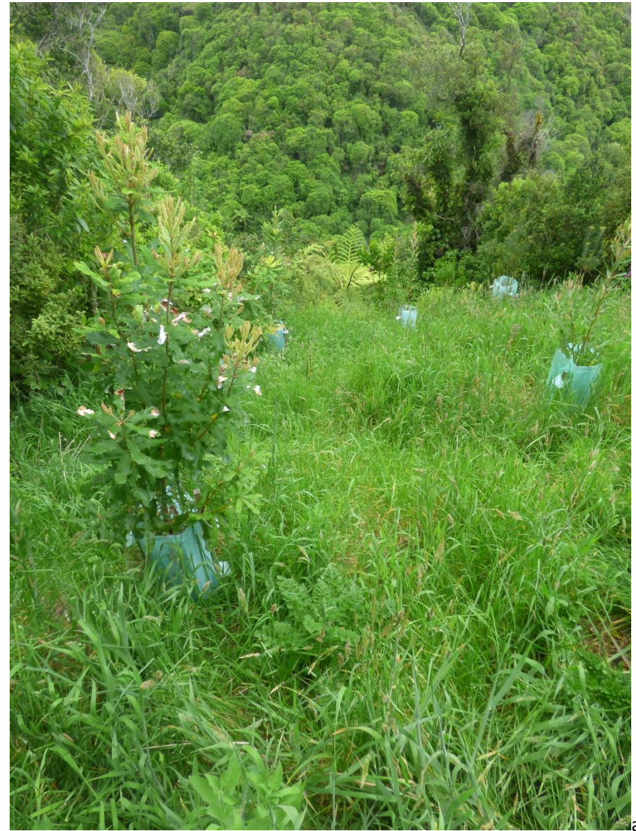
Fig 6B Looking S into Block B from the track. In the foreground are Banksia with planted Rewarewa and Acacia further down.