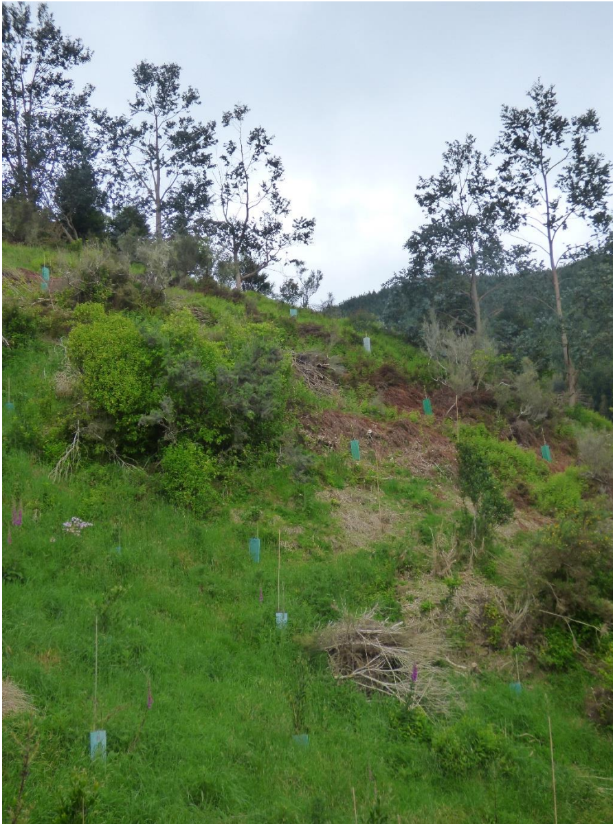
Fig. 5A Looking E to part of ridgeline windbreak W2 within the SNA, with Acacia and some Matai plantings in the foreground (Block C E )