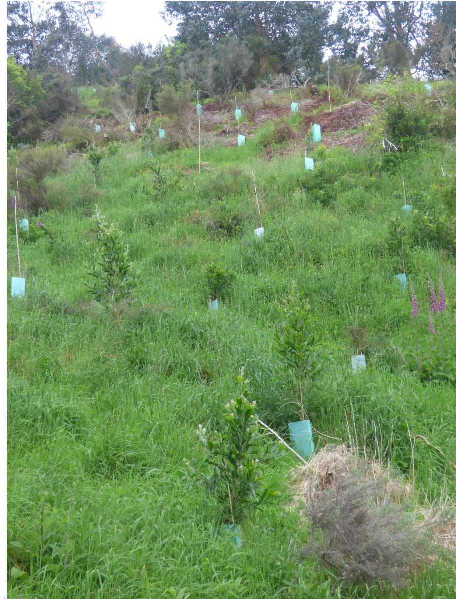
Fig 5B A closer view of plantings of Acacia melanoxylon , also some Matai, in Block C E .