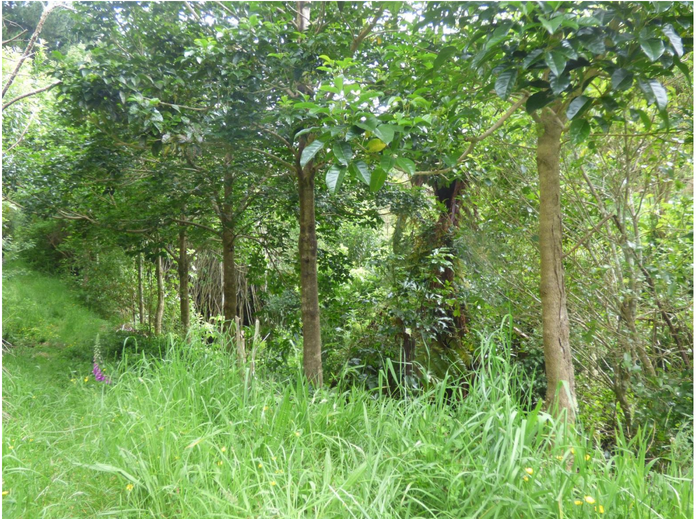
Fig. 2. Planted Puriri inside the proposed SNA 216 and located in Block F (refer to Fig. 1).