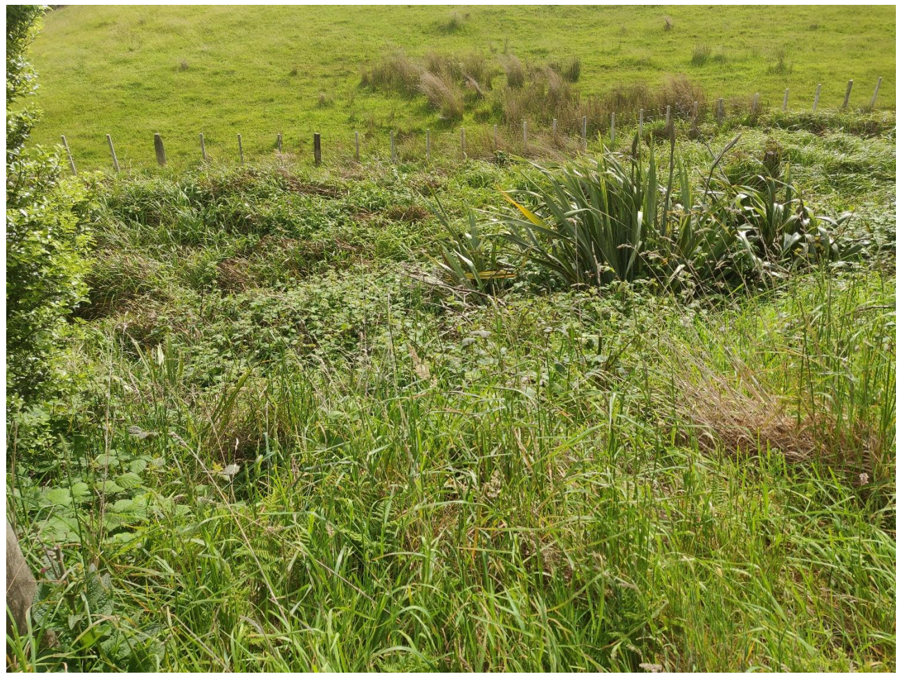
Page 7 of 10