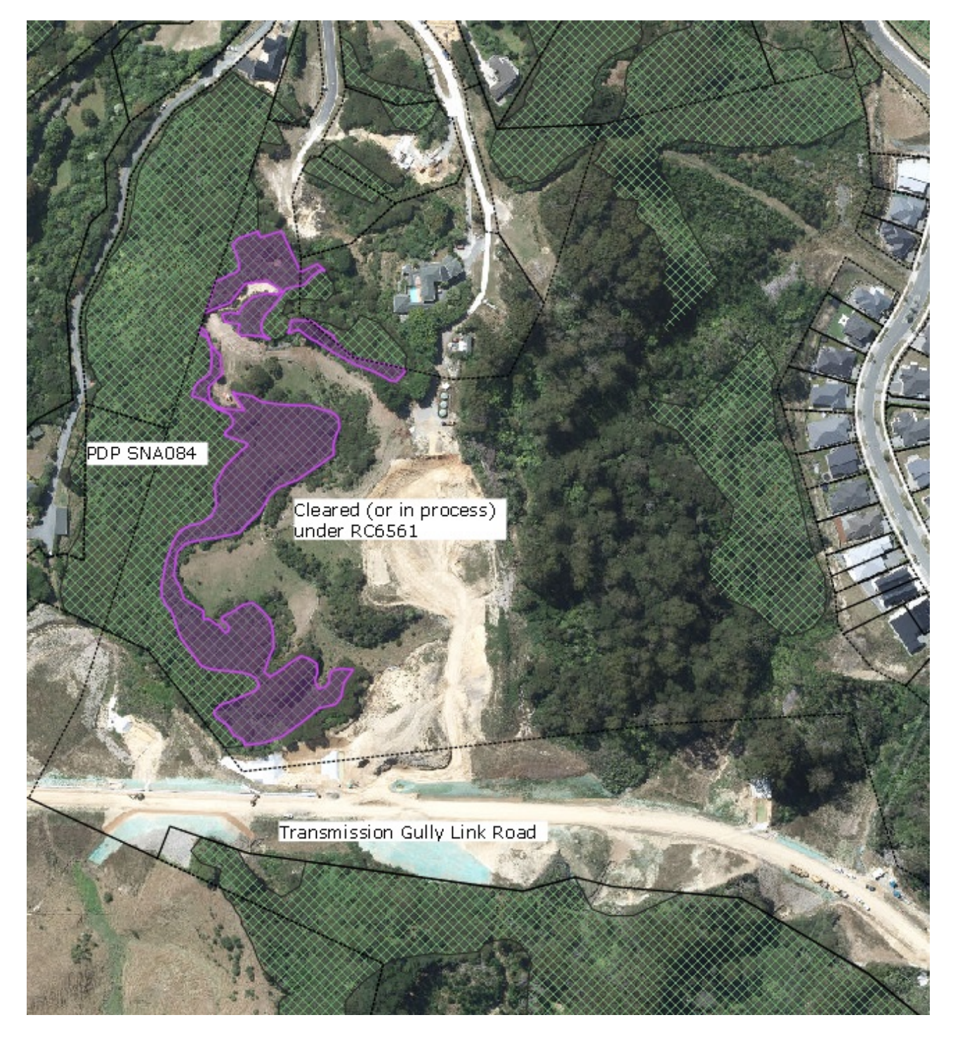
Figure 1: SNA084 requested adjustments shown in purple.

Some of the reasons that the council's analysis is wanting are set out below.