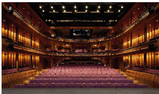
Project name: Royal Opera House 'Open Up' Architect name: Stanton Williams Category: Culture Country: UK