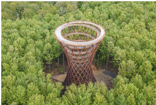
Project name: Camp Adventure Forest Tower Architect name: EFFEKT Arkitekter Category: Landscape: Rural Country: Denmark

A jury will hear presentations by each and the winning project will be announced on December 6 th 2019.