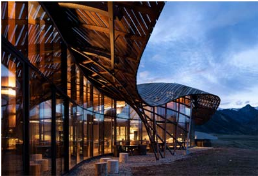
Project name: Lindis Lodge Architect name: architecture workshop Category: Hotel and Leisure Country: New Zealand