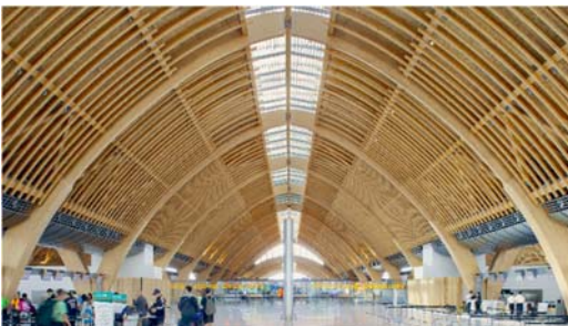
Project name: Mactan Cebu International Airport - Philippines Architect name: Integrated Design Associates Category: Transport Country: Hong Kong S.A.R., China