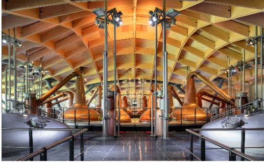
Project name: The Macallan Distillery & Visitor Experience Architect name: Rogers Stirk Harbour + Partners Category: Culture Country: UK