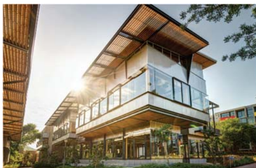
Project name: Future Africa Campus Architect name: Earthworld Architects Category: Higher Education and Research Country: South Africa