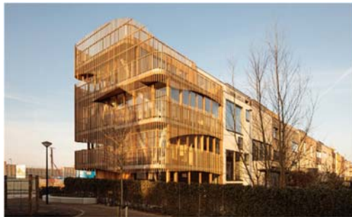
Project name: Freebooter Architect name: GG-loop Category: House Country: Netherlands