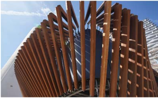
Project name: Harbour Kiosk Architect name: LAAB Architects Category: Shopping Country: Hong Kong S.A.R., China