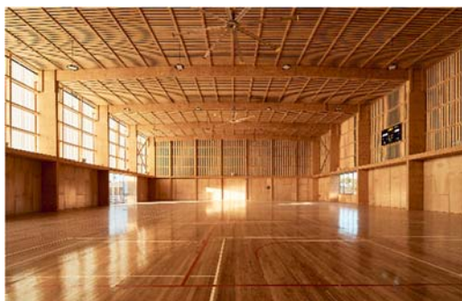
Project name: Pingelly Recreation & Cultural Centre Architect name: iredale pedersen hook architects Category: Sport Country: Australia