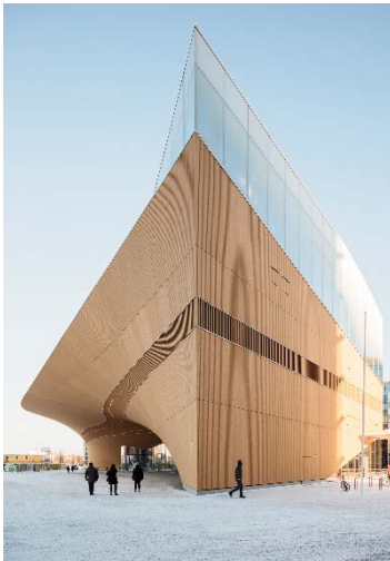
Project name: Helsinki Central Library Oodi Architect name: ALA Architects Category: Culture Country: Finland