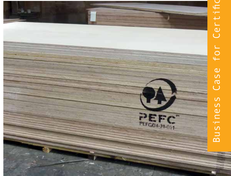
Certified plywood with PEFC logo

As a leading manufacturer of plywood products, Besgrade Products Sdn. Bhd. acknowledges that PEFC certification has placed the company in a better position in terms of both market access and market share for its products.