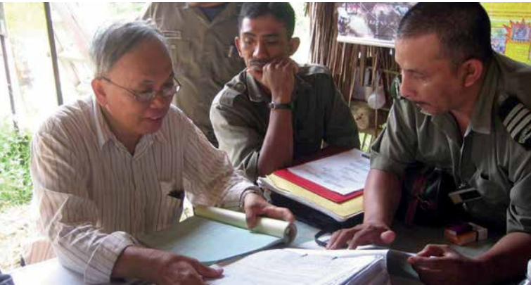
Independent auditing in progress

A key component in the implementation of the MTCS involved the standards development process, requiring broad-based consultations among the social, environmental and economic stakeholder groups, and relevant government agencies; spearheaded by a multi-stakeholder standard development/review committee, and through consultations conducted at the regional and national levels. MTCC has always ensured that the standard development/review process under the MTCS