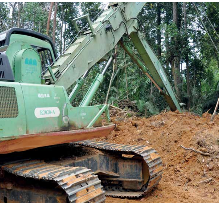
Reduced impact logging (RIL) using the Rimbaka system

The forestry and timber sector is economically very important for the Pahang State Government, contributing 19.5% to the total state revenue in 2011. As such, the sustainable management of the forest resources is crucial to ensure that the resource continues to contribute towards the economic, social and environmental well-being of the state and its people.