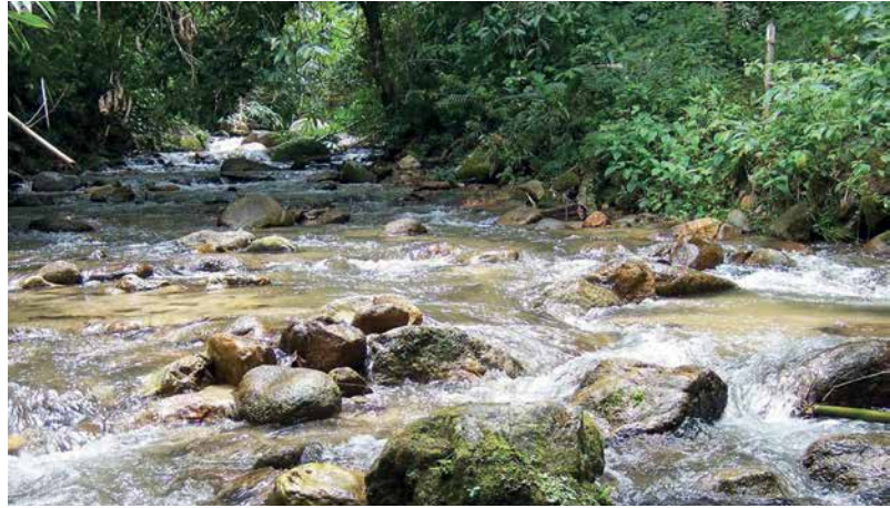
Forest - source of clean water

Malaysia has more than half of its total landmass of nearly 33 million ha still covered with natural tropical forest, which is an important source of revenue for the developing country through its long-standing timber industry. It is one of the major contributors of Malaysia's export earnings and in 2012 generated over RM 20 billion in export earnings, or roughly 1-2% of GDP and close to 2.9% of the country's total exports.