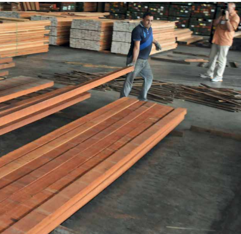
PEFC-certified Victory sawmill in Kuala Lumpur, Malaysia

Even if your company is not yet sourcing certified material, implementing PEFC Chain of Custody requirements and becoming certified helps to demonstrate your alignment with the European Union Timber Regulation (EUTR) and other illegal logging legislation, by implementing a Due Diligence System and delivering PEFC Controlled Source material.