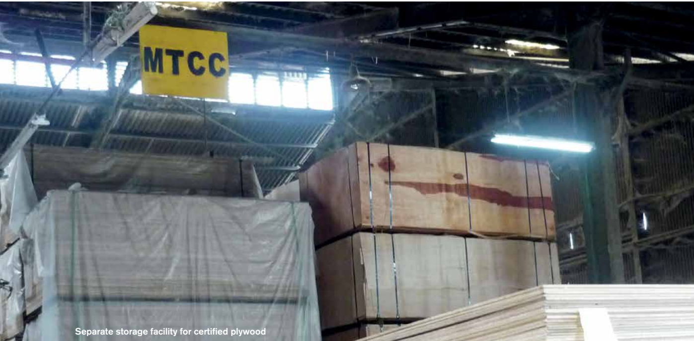
Separate storage facility for certified plywood

With buyers increasingly demanding that products are sourced from sustainably managed forests, exporting timber products today requires more than just obtaining an export license.