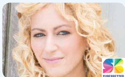
Jane McGonigal , PhD, New York Times Bestselling Author of SuperBetter