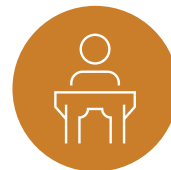
Emerging Professional Sessions