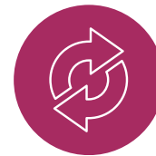
Engage and Exchange Sessions