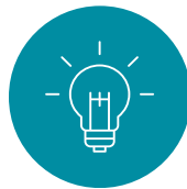
New Learning Formats