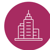
400+ Exhibiting Companies