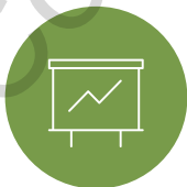
Professional and Student Posters