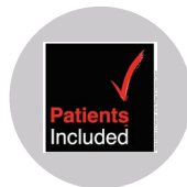
Patients Included Designated!