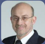
Steven E. Nissen, MD, MACC Top Cardiovascular Physician - Scientist & Pioneer of IVUS