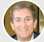
DONATO TRAMUTO CEO TIVITY HEALTH