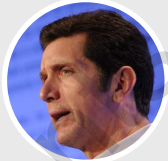
ALEX GORSKY Chairman and CEO JOHNSON & JOHNSON