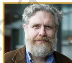
George Church, PhD Robert Winthrop Professor of Genetics Harvard Medical School