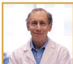
Robert Langer, PhD David H. Koch Institute Professor MIT