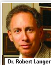
Dr. Robert Langer

"I am extremely proud of the pioneering work