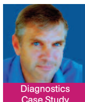
Diagnostics Case Study