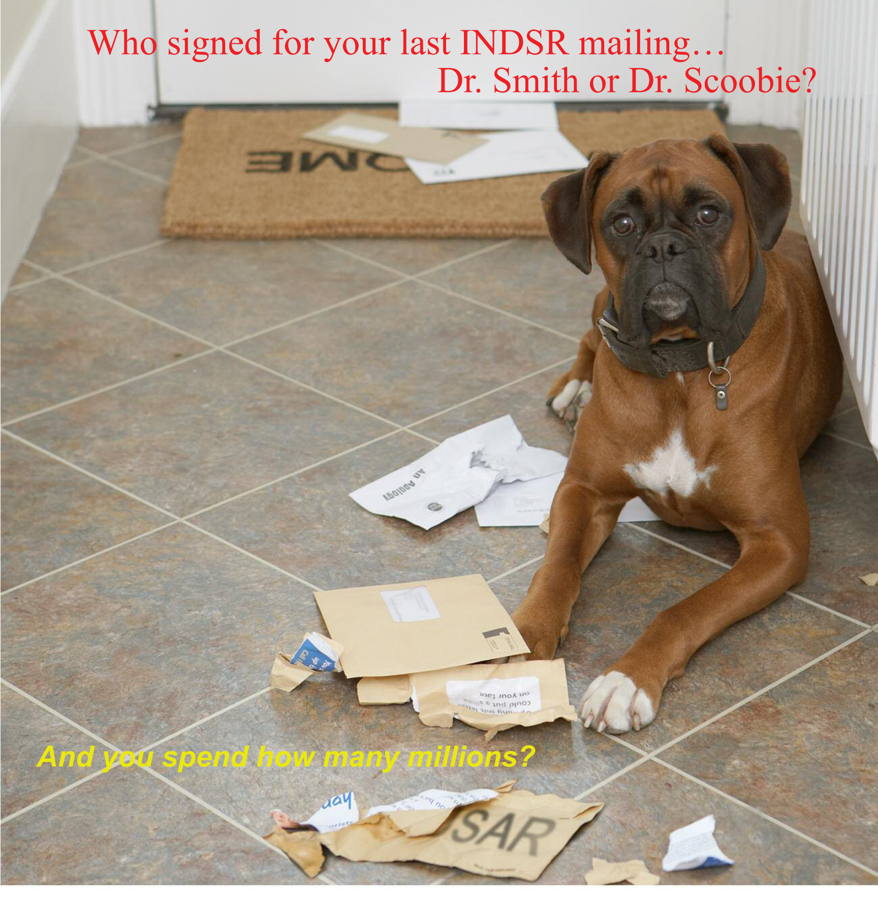
21 CFR Compliant Online Safety Letter Distribution & Tracking