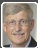
Dr. Francis Collins is excellent at spotting split infinitives.