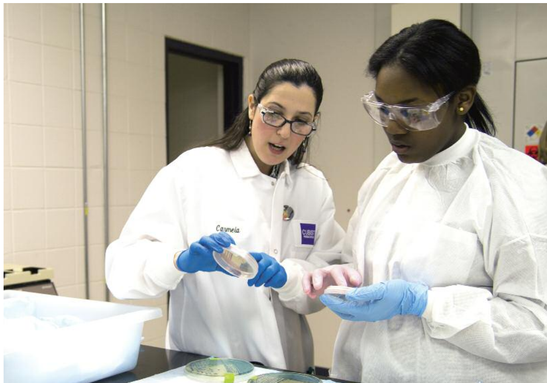
Since 2008, Cubist has awarded more than $1 million to STEM programs.