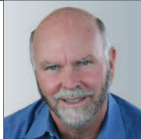
INNOVATION ACCELERATOR J. Craig Venter Founder, Chairman, and President, J. CRAIG VENTER INSTITUTE; Founder and CEO, SYNTHETIC GENOMICS INC.