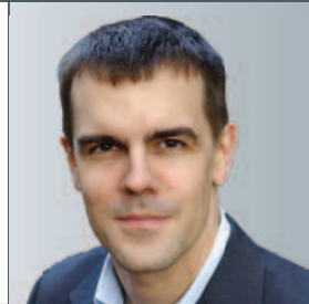
INTELLIGENT COLLABORATOR James Surowiecki Columnist for The New Yorker , Author, The Wisdom of Crowds