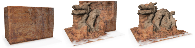
Figure 3: An example of sculpting by using wind. The dragon embedded in the block of stone reveals itself after being interactively eroded out by the user.

Geforce 780 GPU in our graphics framework. We used OpenGL 4.2 for rendering and employed modern GPUs' compute capabilities based on CUDA for modeling.