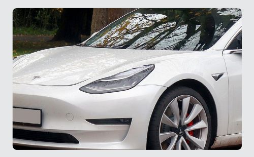
25 million Tesla Model 3 cars, 2019 model<sup>(29)</sup> = 1 for everyone in Australia.<sup>(30)</sup>