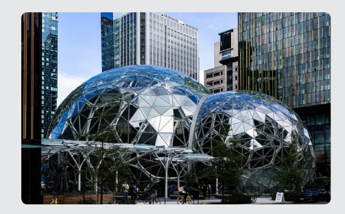
A Microsoft, an Apple or an Amazon.<sup>(31)</sup>

The GDP of Indonesia in 2017<sup>(32)</sup> - SE Asia's biggest economy and a country with a population of 264 million.