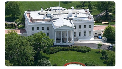
65 White Houses(45)