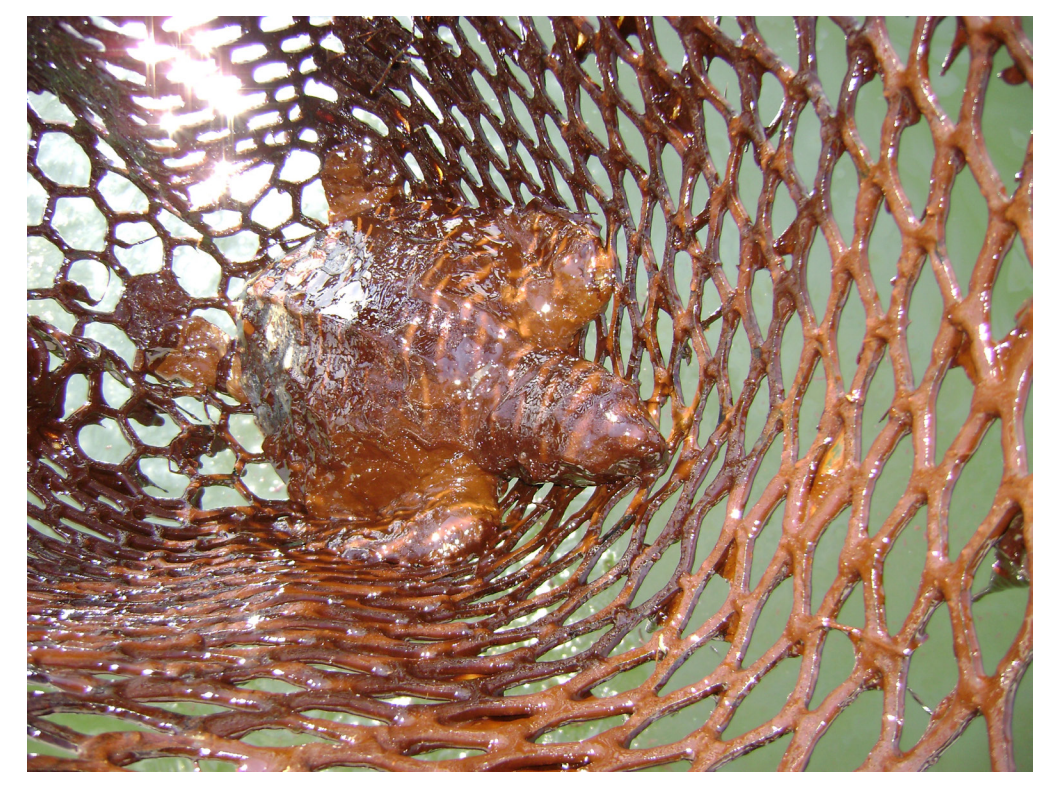
A Kemp's Ridley turtle rescued from the BP Deepwater Horizon oil spill

Sea turtles are close relatives of tortoises, having traded their legs for flippers, and there are seven species alive today: leatherback, green, loggerhead, hawksbill, Olive ridley, Kemp's ridley and flatback.<sup>1</sup> Turtles have existed for more than 100 million years, once sharing the world with the dinosaurs and appearing in the stomachs of fossilised ichthyosaurs.<sup>2</sup> The dinosaurs were wiped out 65 million years ago during the last great extinction, but turtles survived, forming huge populations and becoming a crucial part of the ocean's ecosystem.<sup>3</sup> However, the tide started to turn for turtles once they began interacting with humans. Turtle populations in the Americas and Australia were decimated after coming into contact with European colonists who fished them relentlessly,<sup>4</sup> and global numbers continued to fall over the following centuries.