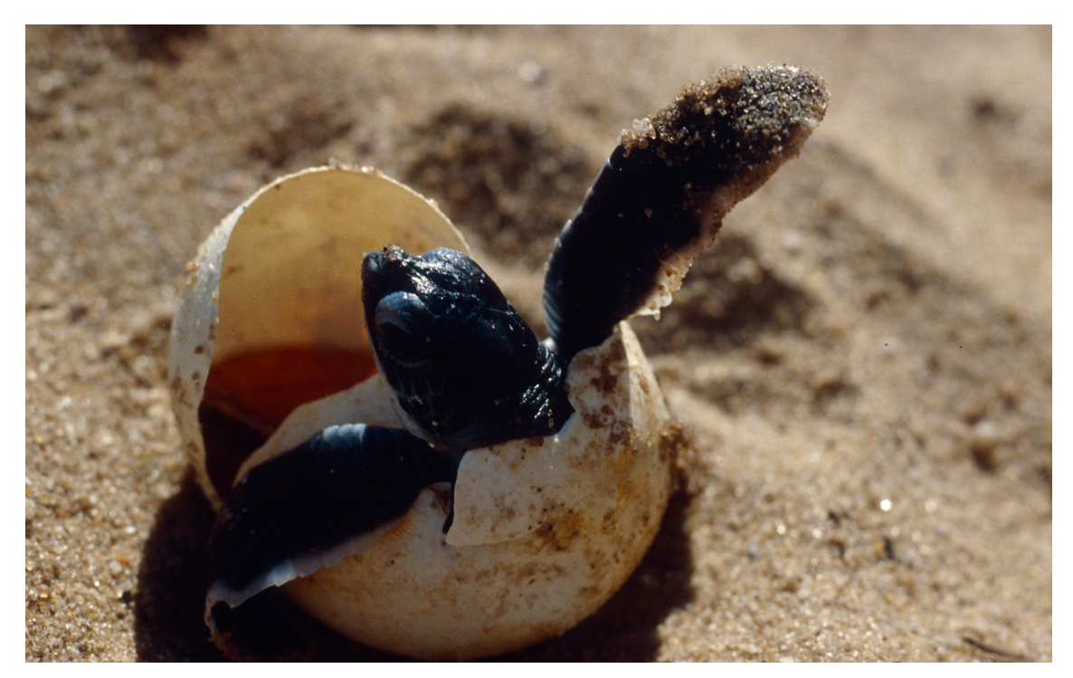
High temperatures make female hatchlings more likely

The dangers from climate change outlined above are shared by many of the world's marine animals; however, sea turtles face a particular tragedy of their own. The sex of an individual is not determined at