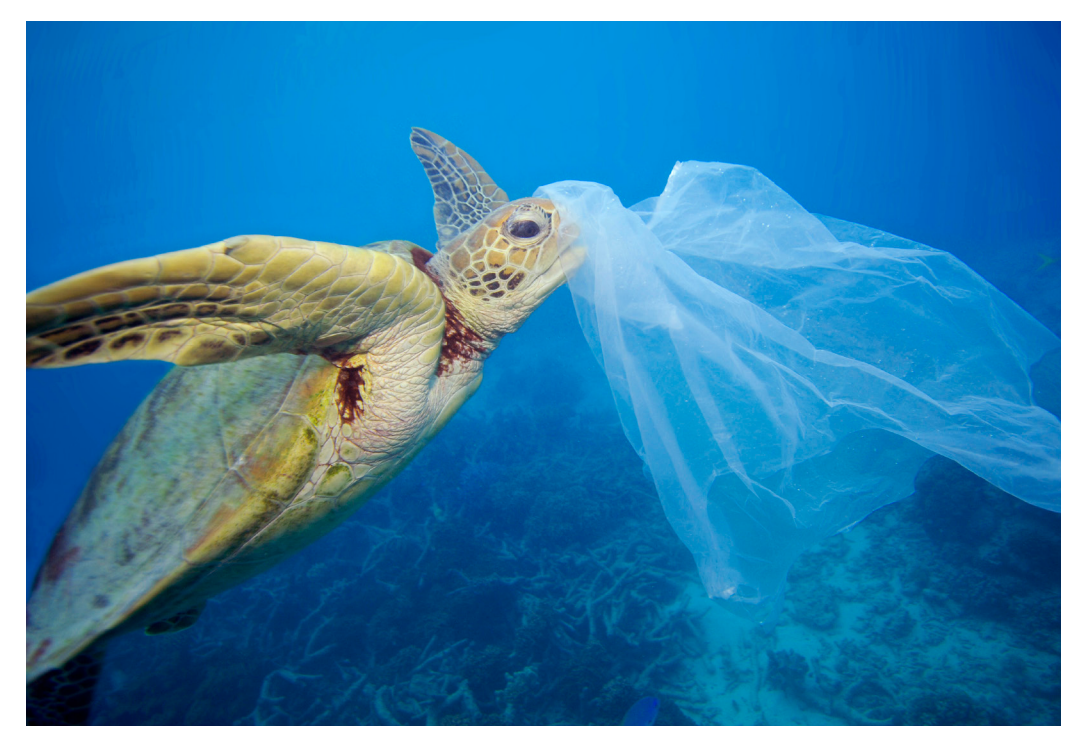
Turtles often mistake plastic for food