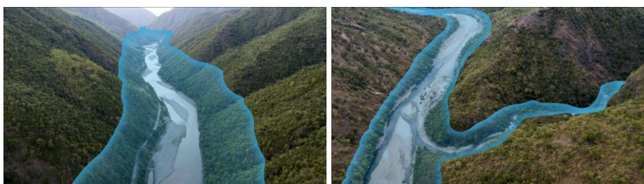
Figure II: A visualization of flooding (blue area) in the valleys of the Shiyang and Xiaojiang rivers after routine storage operations of the Jiasajiang Level 1 Hydropower Station