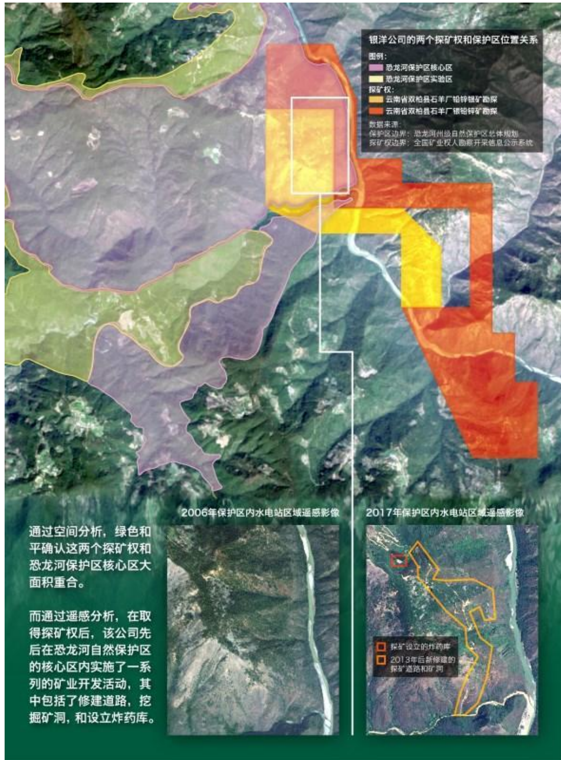
Figure III: A map derived from remote-sensing data showing the spatial relationship between Yinyang's mining activities and the nature preserve

Province of PRC on Natural Reserve, and it has caused irreversible damage to the core area of the reserve.