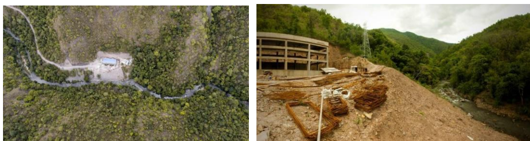
Left: June 17, 2017. A new power station is in the valley of Xiaojiang River, a tributary of Shiyang River. This construction project abuts the nature reserve, and the roads that it uses cuts into the core area of the reserve.