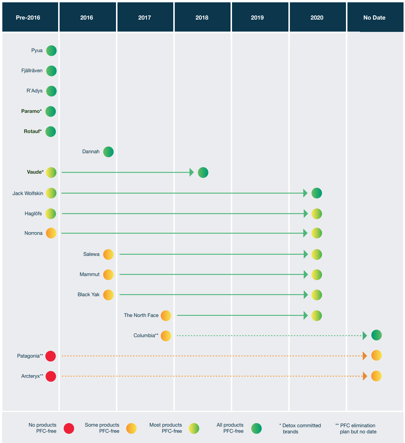
Figure 1 : Outdoor brands with PFC-free products on the market and the status of their commitments to eliminate PFCs (for details see Annex. Table 1).

Note : the positioning of the brands in this diagram does not represent a ranking: for Greenpeace's evaluation of the progress being made by major outdoor brands towards Detox see the Detox Outdoors website.