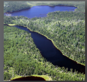
image: Intact forests like this one are increasingly at risk from industrial-scale logging.

Now FSC supporters need to work together to keep the FSC strong as it continues to grow.