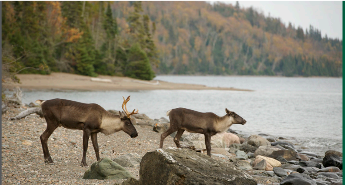
image: The threatened woodland caribou is being pushed to extinction because of destructive logging practices and other industrial developments.

In Ontario, where the Thunder Bay mill complex is located, there are insufficient protected areas in place to prevent the decline of the majority of woodland caribou herds. In fact, Ontario does not contain a single protected area that is large enough to ensure long-term caribou survival. 9 The Government of Ontario's own Woodland Caribou Science Panel found the province's approach to conserving caribou populations was "bound to result in failure to recover caribou populations," including its failure to adequately protect habitat areas. 10