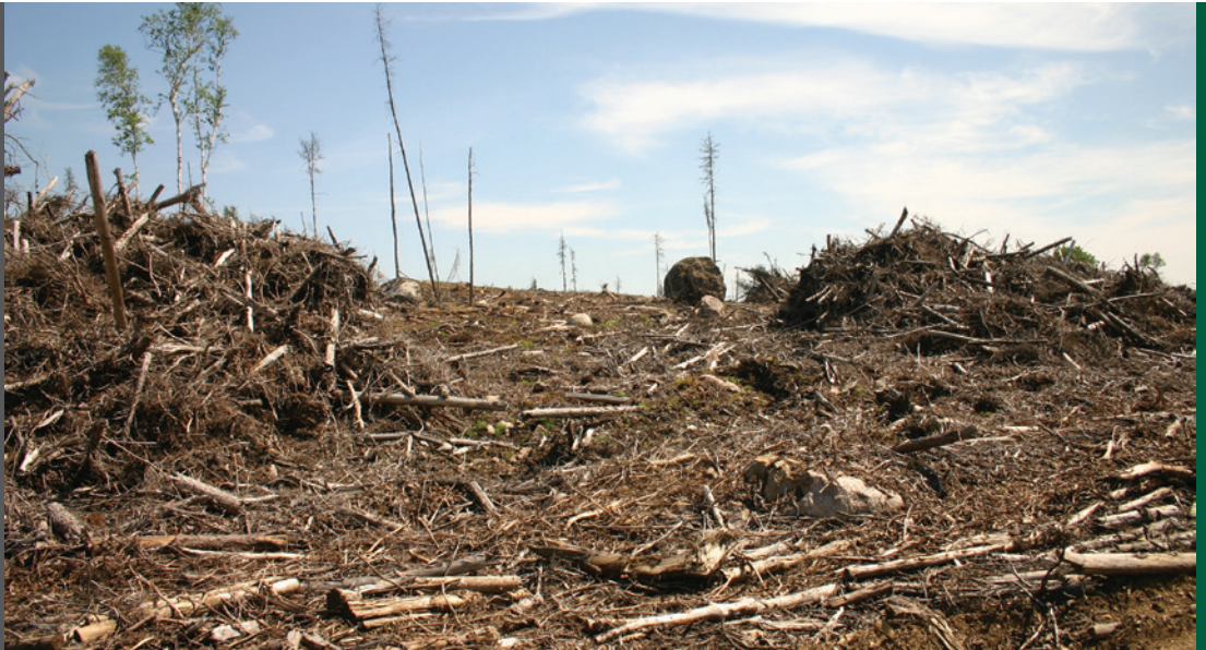
image: An example of a clearcut carried out on Grassy Narrows First Nation traditional land without consent in 2006