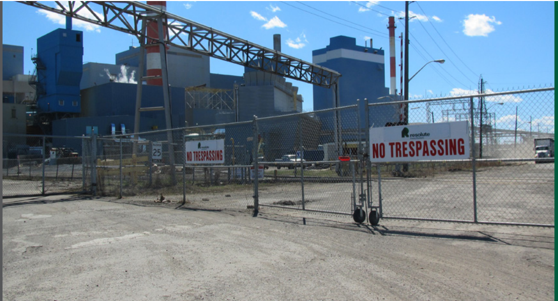
image: Resolute's Thunder Bay mill is able to mix or link controversial wood with FSC-certified material, putting the integrity of the FSC label at risk.