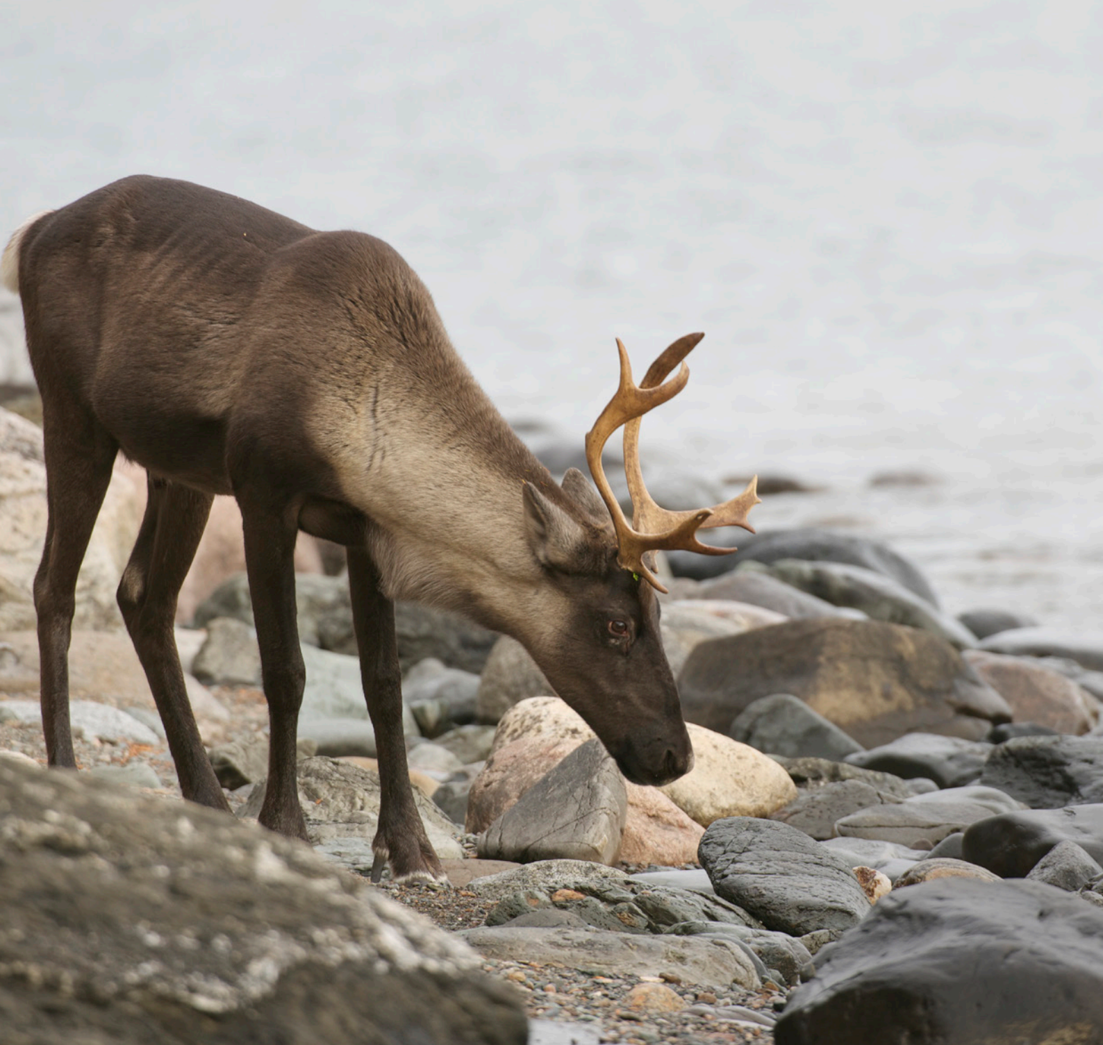
image: The threatened woodland caribou is extremely sensitive to disturbances such as clearcuts and roads