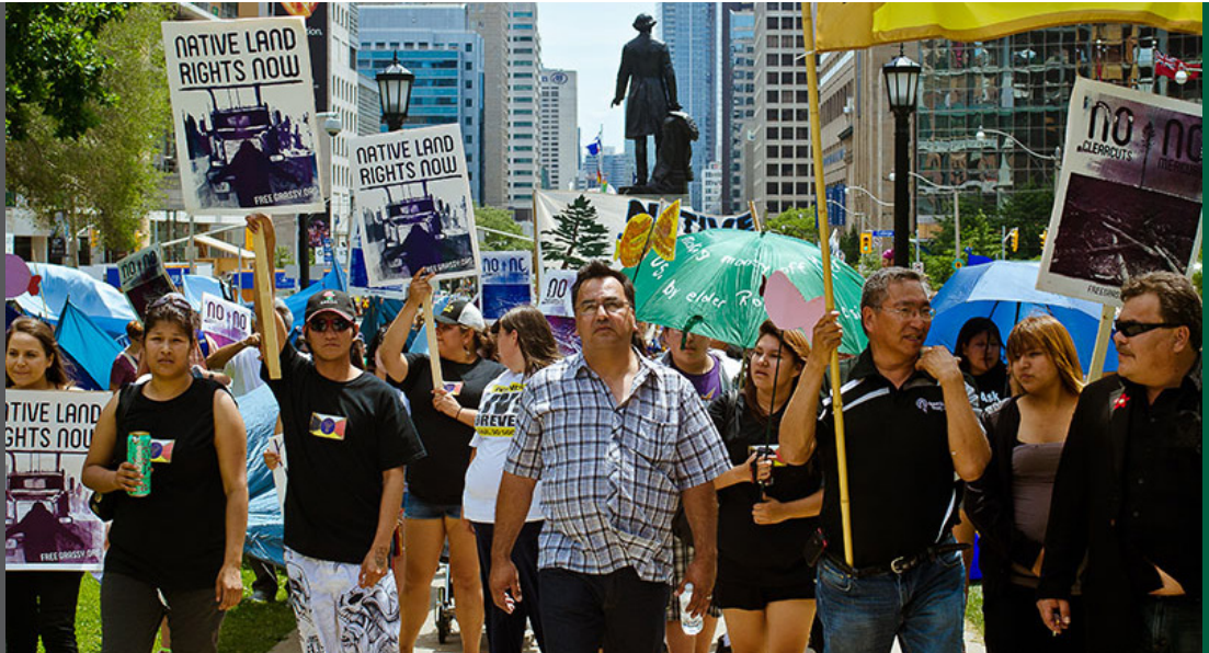
image: Grassy Narrows First Nation and supporters rally in Toronto against logging without consent on their traditional territories. June 2012

Resolute has clearly ignored two main low-risk indicators related to the CW social category wood, including: (i) a recognised dispute resolution process by affected parties to resolve conflicts of substantial magnitude pertaining to traditional rights; and (ii) there is no evidence of violation of the ILO Convention 169 on Indigenous and Tribal Peoples taking place in the forest areas in the district concerned.