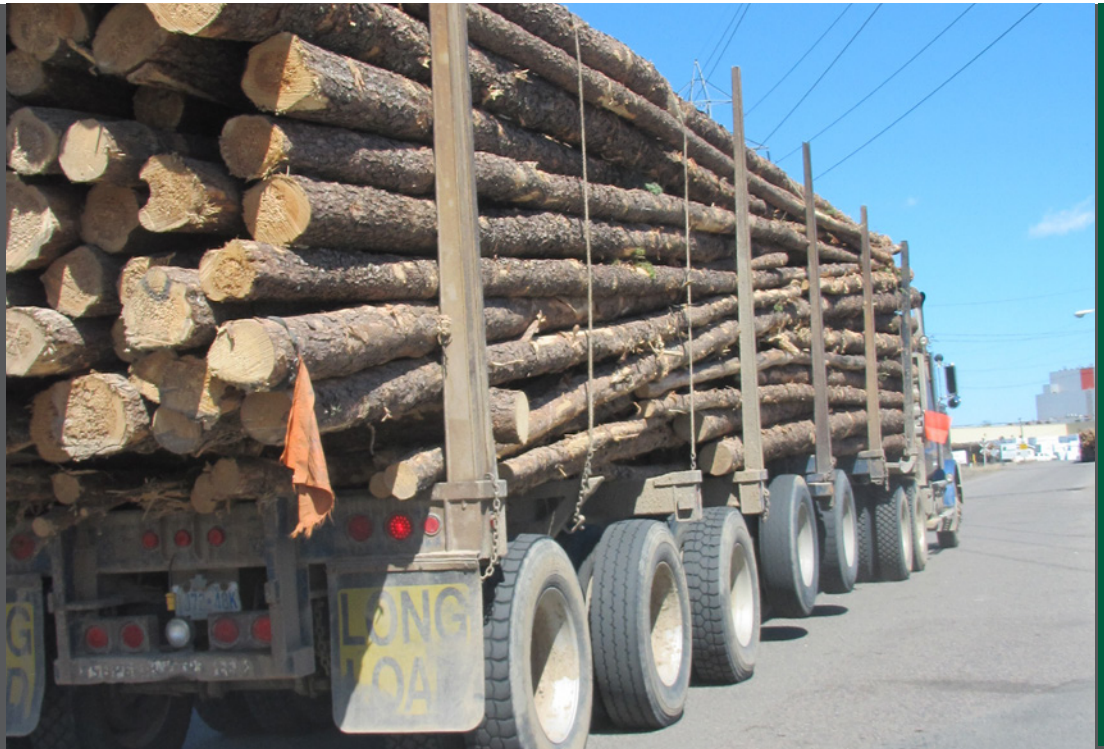
image: There is a high risk that wood on this truck destined for the Thunder Bay mill comes from threatened woodland caribou habitat.