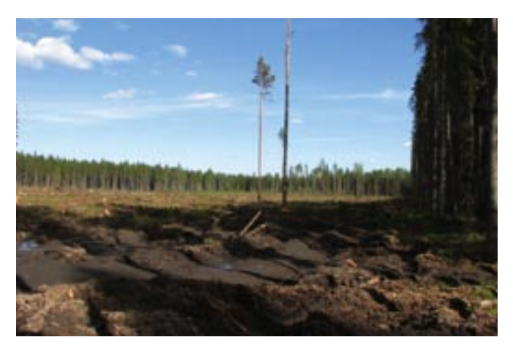
Russian clearcut logged in violation of Russian Federal law, June 2006