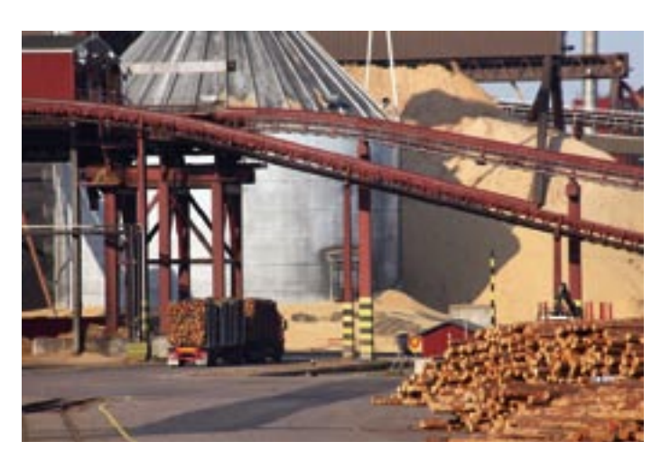
Truck loaded with illegally logged timber entering UPM-Kymmene Kaukas mill, Lappeenranta.

This 'advocacy' appears to have succeeded, resulting in a hands-off policy in Finland. Recent FFIF statements do recognize that illegal logging is a problem, but continue to advocate voluntary industry initiatives. The Government position clearly reflects the interests of the industry when it states: