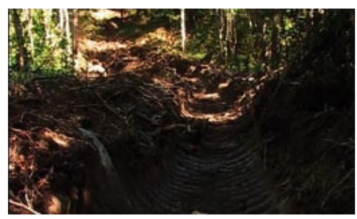
Soil damage in 'renovation' logging site.

The spruce logs from this logging site were loaded onto a red Volvo truck, [registration front: TGK-266, trailer WKY-999] and the truck was tracked to the Russian border and documented arriving in Finland.