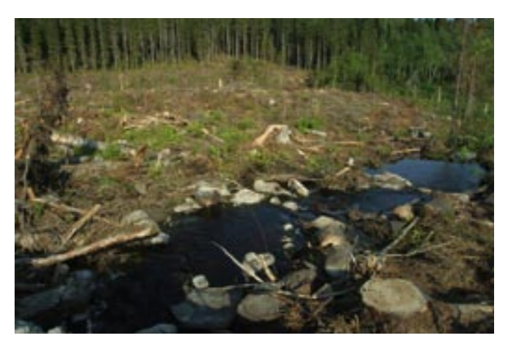
Clearcut in water protection zone, Republic of Karelia, Russia.

are in the range of $US200-270 million as a result of lower market prices.23 In 2004, the United States Department of Agriculture taking a more global approach, stated: