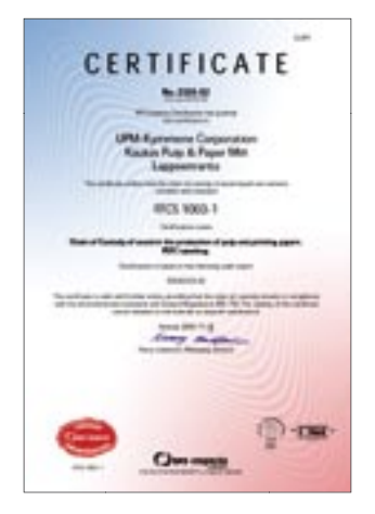
PEFC certificate for UPM-Kymmene pulp and paper mill, Lappeenranta.

In forest management, UPM requires that timber suppliers comply with the forestry guidelines of each country, national legislation and the requirements of the authorities.