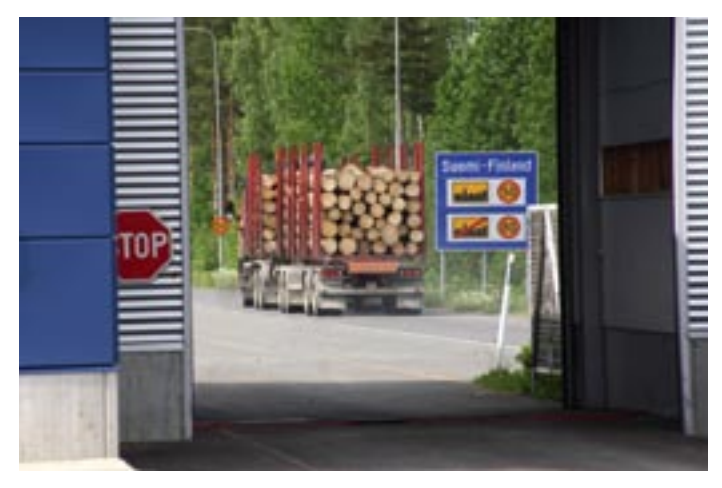
Stora Enso truck loaded with illegally logged timber entering Finland, June 2006

• The illegal timber entered facilities belonging to Stora Enso and UPM, both of which are certified by the PEFC (Programme for the Endorsement of Forest Certification) Chain of Custody certification systems.