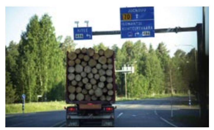
Stora Enso truck loaded with 'so called' renovation thinnings