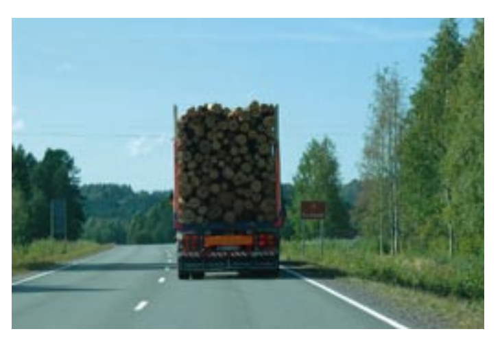
Truck loaded with illegally logged timber on its way to UPM-Kymmenne mill.

Illegal logging is a well-recognised phenomenon in Russia, yet Finland continues to source around twenty per cent of its timber resources there, taking legality and sustainability on trust from the industry. Estimated rates of illegality vary greatly. In 2003, Greenpeace estimated that seventy-five per cent of the Russian timber imported into Finland was produced in violation of the law. In Russia overall, Government sources estimate that up to ninety per cent of logging could violate forest laws. However, lower estimates also exist. One report puts 'timber of unknown origin' at around ten to fifteen per cent. Another industry commissioned report puts a figure of twenty-five per cent on logs imported into the EU from illegal Russian sources.