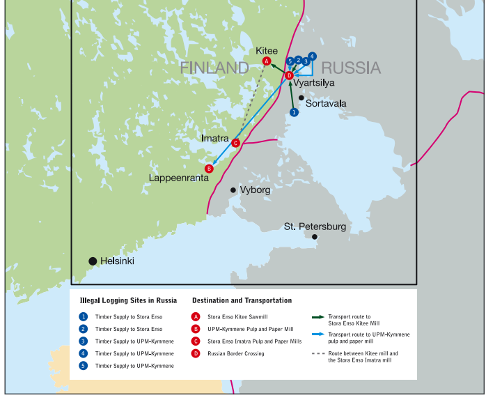
Map showing timber trade flows

All relevant law for the following Forest Crimes are listed in Appendix A.