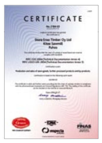
PEFC Chain of Custody certificate for Stora Enso Kitee sawmill, from the Stora Enso website.

Therefore this logging was illegal commercial logging under the guise of renovation or maintenance logging. Renovation logging is allocated under Forest Management Plans, therefore the absence of the EIA in the planning process renders the logging license illegal. An additional illegality at this site was excessive soil damage on the skidding roads.<sup>40</sup>