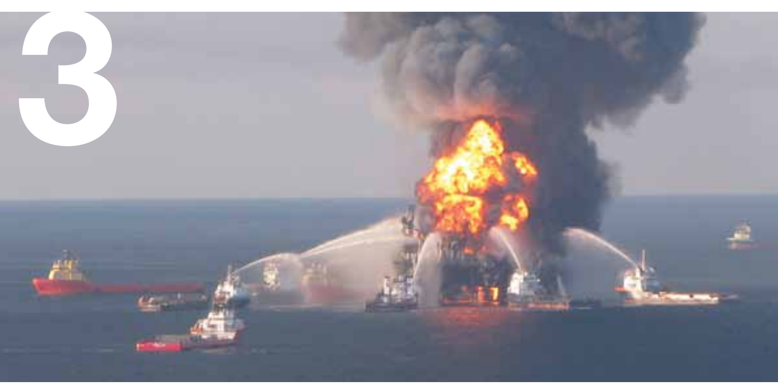
Fire boat response crews battle the blazing remnants of the off shore oil rig Deepwater Horizon.

On 20 April 2010, the world was forced to wake up to the inherent dangers of deep-sea oil drilling and the unique difficulties of containing a deep-water spill when BP's Deepwater Horizon rig suffered a catastrophic blowout that killed 11 crew members. Over the next three months the spill ran unchecked, disgorging 660,000 tonnes of oil into the Gulf of Mexico, devastating both wildlife and local fishing and tourism. In March 2012 BP agreed to pay $7.9 billion USD to settle claims from 110,000 individuals and businesses affected by the spill but total costs have been estimated to run to over $37 billion USD<sup>14</sup>.