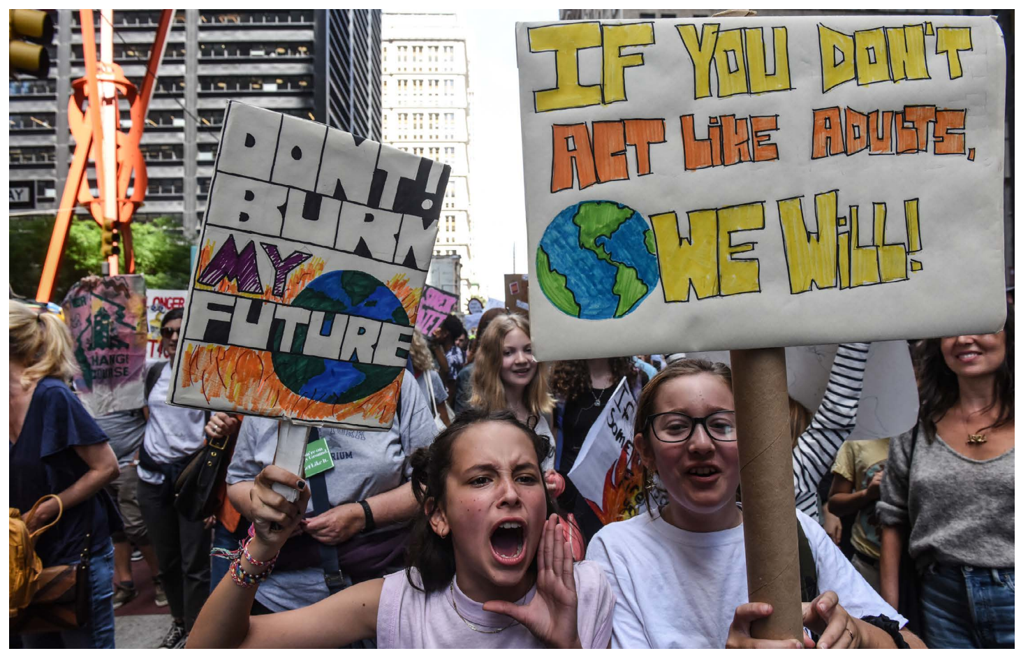
Global Climate Strike in New York

Koch Industries : Koch Industries is a leader among the dozen fossil fuel companies that have persistently lobbied for "critical infrastructure" legislation since 2017. It's also the second largest contributor to anti-protest bill sponsors in the most recent election cycle.<sup>118</sup>