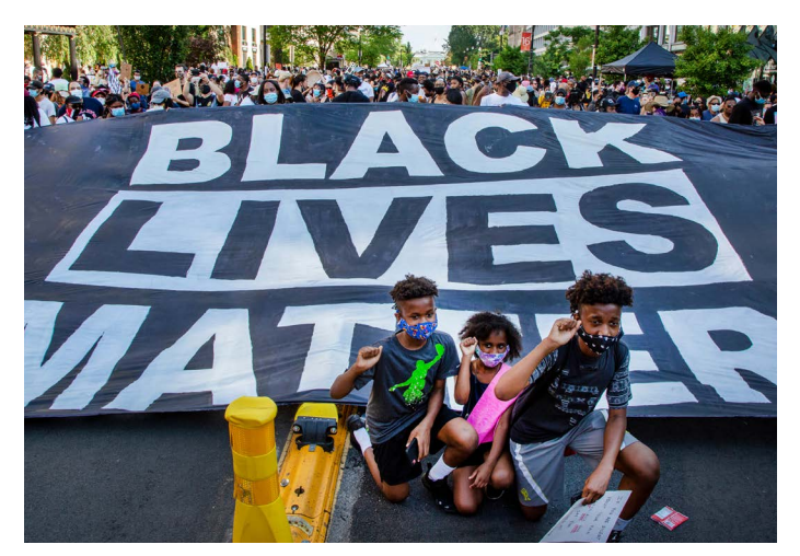
Black Lives Matter Protest in Washington DC

Another Indiana bill, S.B. 198, gives the state's Attorney General concurrent jurisdiction to prosecute any "criminal offense" committed by members of an "unlawful assembly," allowing them to step in and charge protesters if local prosecutors decline to do so.<sup>87</sup> Other bills create new penalties for government officials who try to "stand down" police (North Carolina H.B. 321), undermining local officials' ability to participate in decisions over policing of protests and potentially incentivizing aggressive police responses.<sup>88</sup>