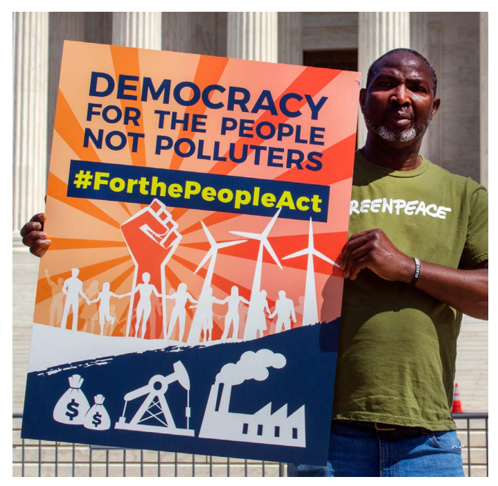
Supporting American Democracy in Washington DC

This year, demands for racial justice and climate justice have also begun to expose the relationship between polluters opposed to government action on climate change and the recent racist attacks on democracy.