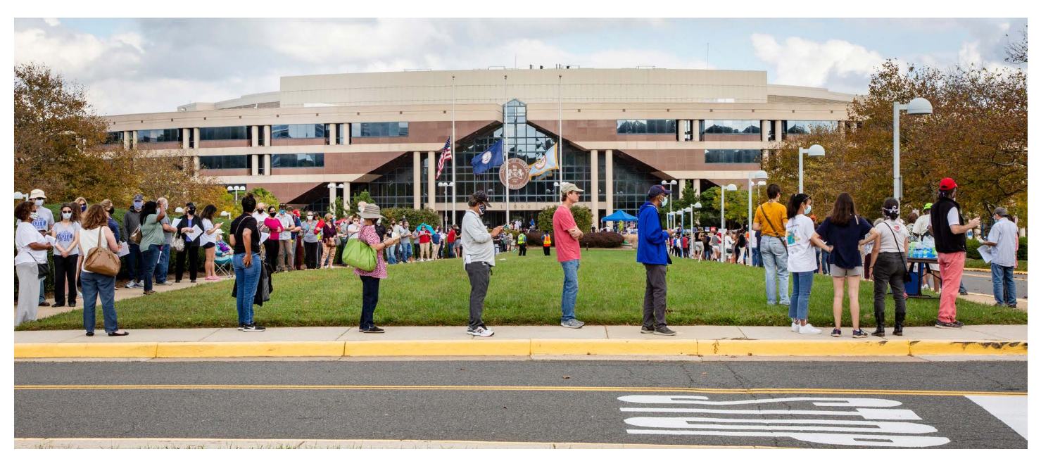
Early Voting Lines in Virginia.

After white supremacists stormed the Capitol during the failed insurrection of January 6th, it was revealed that fossil fuel companies and other corporations and conservative groups contributed to groups that helped organize and promote the "Stop the Steal" rallies that led to the siege of the Capitol.<sup>7</sup> Later on January 6, when Congress reconvened, the "insurrection caucus" that refused to certify the 2020 election results was led by many members who have taken exorbitant amounts of money from the fossil fuel industry.8 According to a recent analysis by the Center for American Progress, 82 members of the U.S. House of Representatives and six U.S. Senators are both climate deniers and members of the "insurrection caucus" - those who denied the certified results of the 2020 general election, supporting President Trump's attempt to overturn the election.<sup>9</sup> Many of these same politicians have also spent years undermining voting rights and campaign finance reform, opening the doors to the plutocrats who have polluted our politics as much as they have contaminated our air, water, and land.<sup>10</sup>