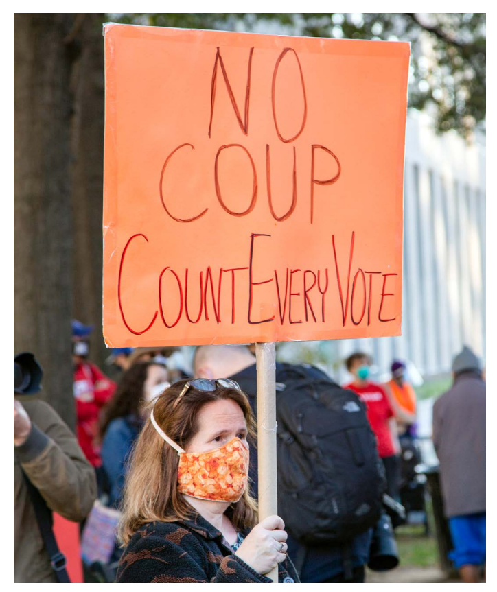
No Coup Vote Count Post Election in Washington DC

As corporate leaders increasingly understand, their employees, shareholders and other stakeholders expect companies to step up when political leaders fail to do so. A 2020 poll of over 2,000 US adults conducted by JUST Capital found that 3 in 4 Americans believe that large companies "have a role to play in preserving and protecting democracy."<sup>49</sup>