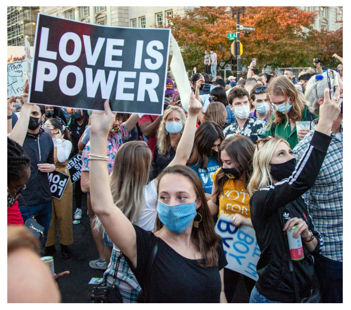
Biden-Harris Election Win Announced - Celebrations in Washington DC

Many bills not only expand law enforcement's ability to stifle speech and stop dissent, they often include incentives to do so. Indiana H.B. 1205, for example, allows businesses to sue governments for failing to enforce the law against unlawful assembly if the failure constitutes "gross negligence," a measure would encourage local governments to adopt overly aggressive responses to protests in order to avoid being sued.<sup>86</sup>