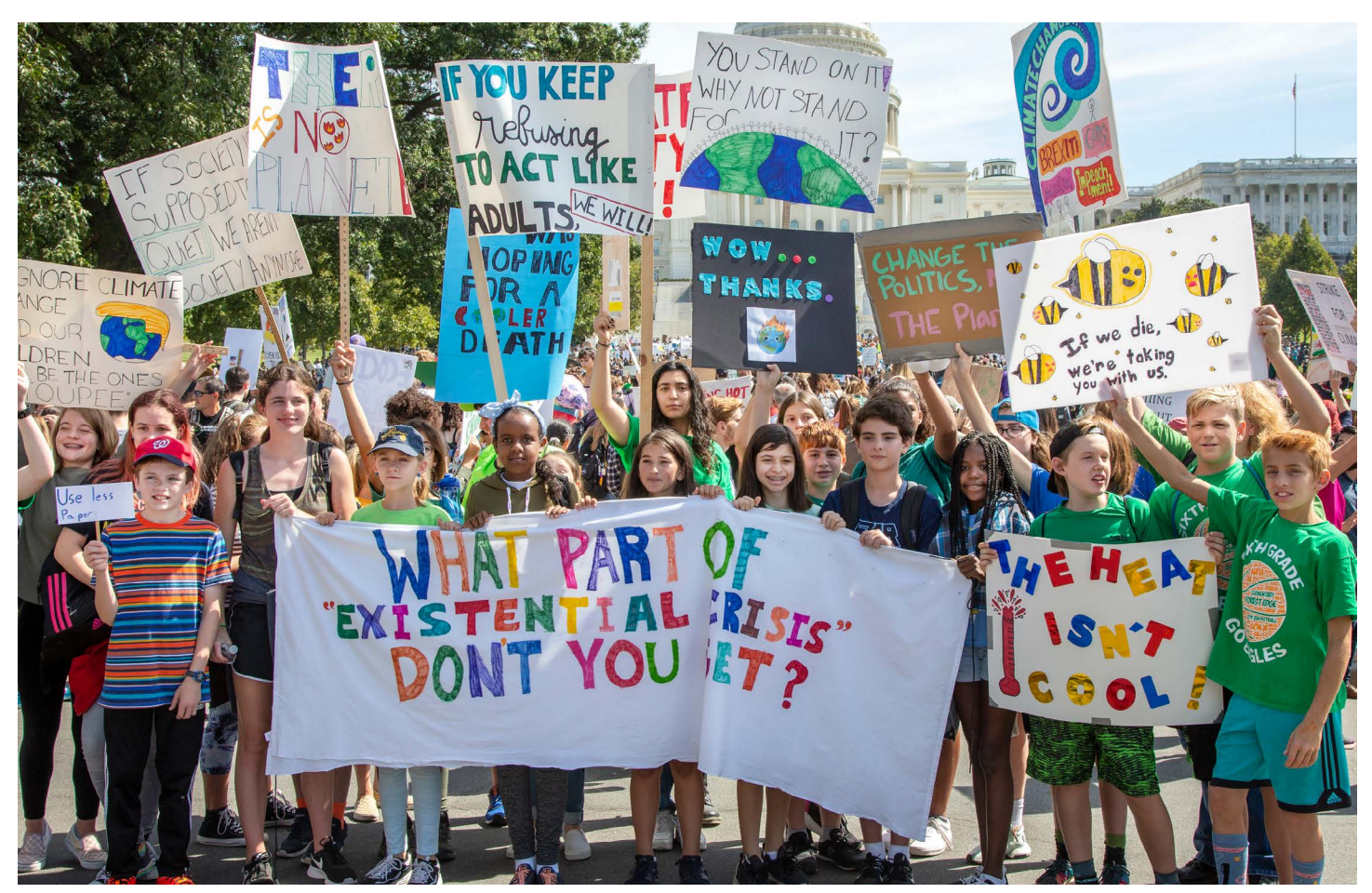
Global Climate Strike in Washington DC

Companies cannot have it both ways: You cannot pretend to be a climate champion by pointing to reduced carbon emissions while contributing to politicians who block climate policies or attack the rights of Indigenous land and water protectors and climate activists. You cannot claim to be committed to racial justice while supporting politicians who sponsor bills designed to criminalize and strip away the constitutional rights of Black and Brown protesters. What follows are specific recommendations for companies to take under consideration in determining how their actions measure up to their commitments.