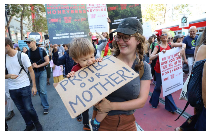
Global Climate Strike in San Francisco

Unfortunately, this was after at least 12 of these companies contributed to the sponsors of 43 state antivoter bills analyzed: Amazon, American Express, Bank of America, Facebook, Ford, General Motors, HP, J&J,