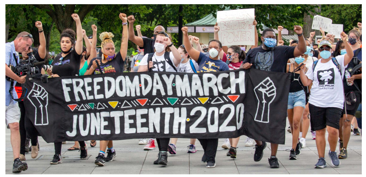
Juneteenth Protests in Washington DC

One egregious example of this new wave of anti-protest laws was signed into law by Florida Governor Ron DeSantis on April 19, 2021. DeSantis initially proposed the bill in September 2020, in response to statewide protests for racial justice, to immediate criticism by civil liberties groups and even a few law enforcement officials.<sup>80</sup> The law carries a sentence of up to five years for peaceful protests, and could strip activists of their voting rights even if they didn't engage in any violent or disorderly conduct. It also carries a threat of up to 15 years in prison for even temporarily blocking traffic in a group of 25 or more persons.<sup>81</sup>