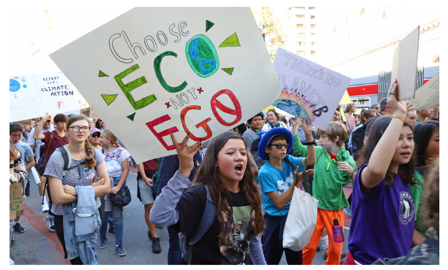
Global Climate Strike in San Francisco

Similarly, peaceful protests against oil and gas pipelines have been deemed threats to "critical infrastructure" by a slew of bills designed to quash those protests. These laws distort the definition of a term originally used to safeguard communities from the risks associated with sabotage and attacks on petrochemical plants and other industrial infrastructure. For corporate polluters, these laws targeting peaceful protesters help divert attention away from their own responsibility for threats to community safety, including chemical accidents and spills, along with the toxic pollution they spew across nearby communities on a nearly daily basis. It also diverts attention from operational and technological changes companies could implement to make the nation's infrastructure and surrounding communities inherently safer and more resilient.