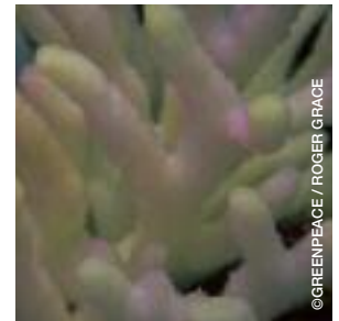
An example of coral bleaching from the Great Barrier Reef.