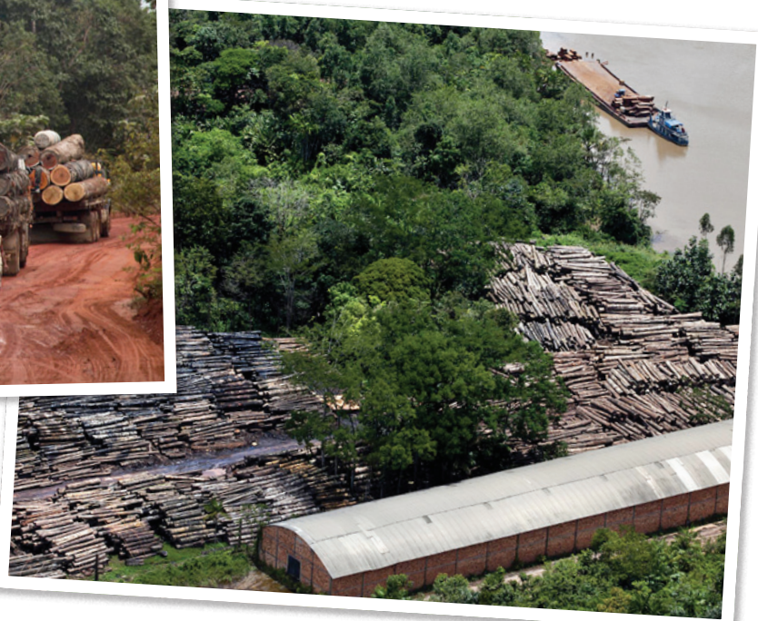
Right: A timber yard and sawmill in Marituba, Pará State. 04/01/2014