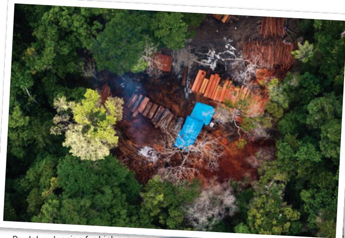
Predatory logging for high-value species degrades intact forest and opens it up to wholesale clearance for ranching and cash crop agriculture.