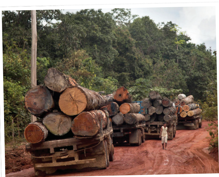
Left: Trucks loaded with timber near Santarém in Pará State. In 2011–12 nearly 80% of the area logged in the state was illegal. 03/27/2014

According to the Brazilian Institute of Environment and Renewable Natural Resources ( Instituto Brasileiro do Meio Ambiente e dos Recursos Naturais Renováveis – IBAMA ), the federal environmental agency responsible (alongside state environmental secretariats) for monitoring and inspecting the Amazon timber industry, in Maranhão and Pará states alone almost 500,000m 3 of timber had fraudulent documents in 2013 – enough to fill 14,000 trucks. 25 Given the magnitude of the fraud and corruption, there is no question that official documents issued in Brazil to certify the legality of timber are largely unreliable and cannot alone be considered as evidence of legality.