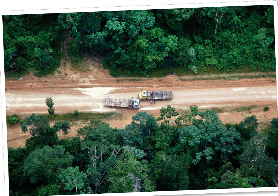
Logging trucks driving through forest in Uruará, Pará. In Maranhão and Pará states alone almost 500,000m 3 of timber had fraudulent documents in 2013 – enough to fill 14,000 trucks like these. 03/29/2014

A different way of approaching the forest and those whose livelihoods depend on forest products is not only possible, but absolutely necessary. Investment and capacity building need to be focused on giving communities the skills to undertake quality community forest management. The Brazilian government must strengthen the regulation of timber harvesting, and the enforcement of regulations. Command and control measures and monitoring systems should be transparent and able to operate in real time so that communities, civil society and other stakeholders can be sure that those harvesting timber are complying with rigorous government regulations. Such changes will give those purchasing Amazon timber greater reassurance that it is not linked to forest destruction and social conflict. Protecting the Amazon and creating a sustainable and fair development plan for the region could generate opportunities for forest-dependent peoples, at the same time as preserving the region's rich biodiversity and safeguarding its important role in the fight against climate change.