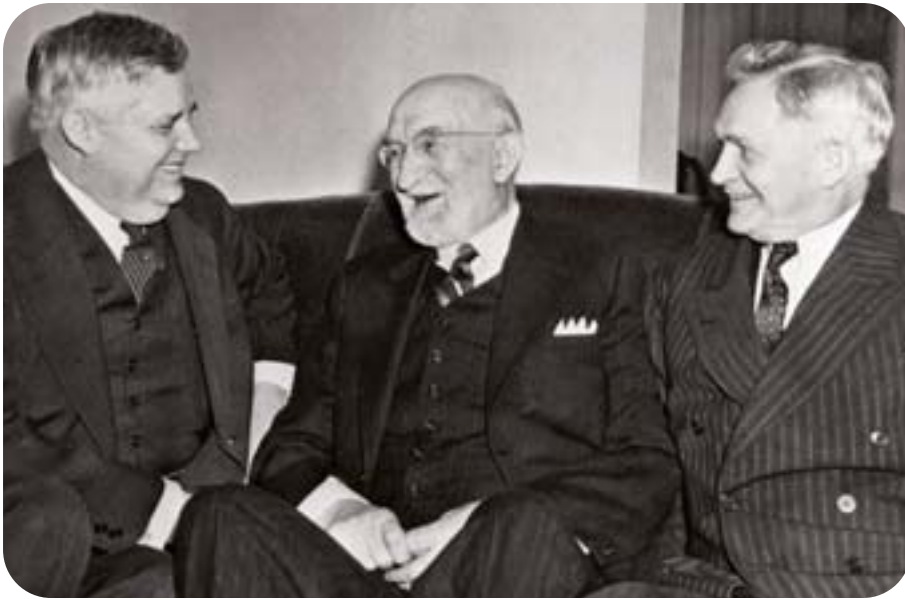
President J. Reuben Clark Jr. visits with Presidents Heber J. Grant and David O. McKay. Clark served as a counselor to each, as well as to President George Albert Smith.