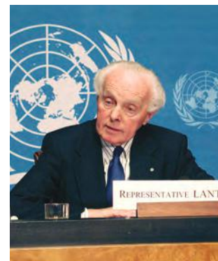
Representative Tom Lantos

One might view the Edict of Nantes as an early advancement of the right to freedom of religion and its revocation as a huge step backward, but by driving the Huguenots out of