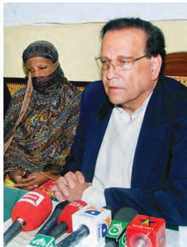
Salmaan Taseer, right, governor of the Pakistani Punjab province, talks to reporters after meeting with Pakistani Christian woman Asia Bibi, left, at a prison in Sheikhpura, Pakistan, Saturday, November 20, 2010.

But Minister Bhatti wasn’t the only Pakistani who forfeited his life that year for those reasons. Two months earlier Salmaan Taseer, the Muslim governor of the Punjab