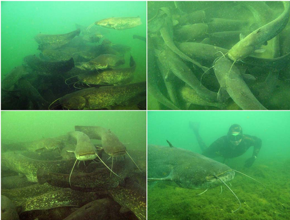
Figure 1. Wels catfish ( Silurus glanis ) aggregations. Bottom-right panel illustrates the size of Wels catfish in the aggregation. doi:10.1371/journal.pone.0025732.g001

one location while defecating in another [7,8]. Additionally, heterogenous spatial distribution of fish can also create biogeochemical hotspots, i.e. places where nutrient release by animals exceeds the need of primary producers [9].