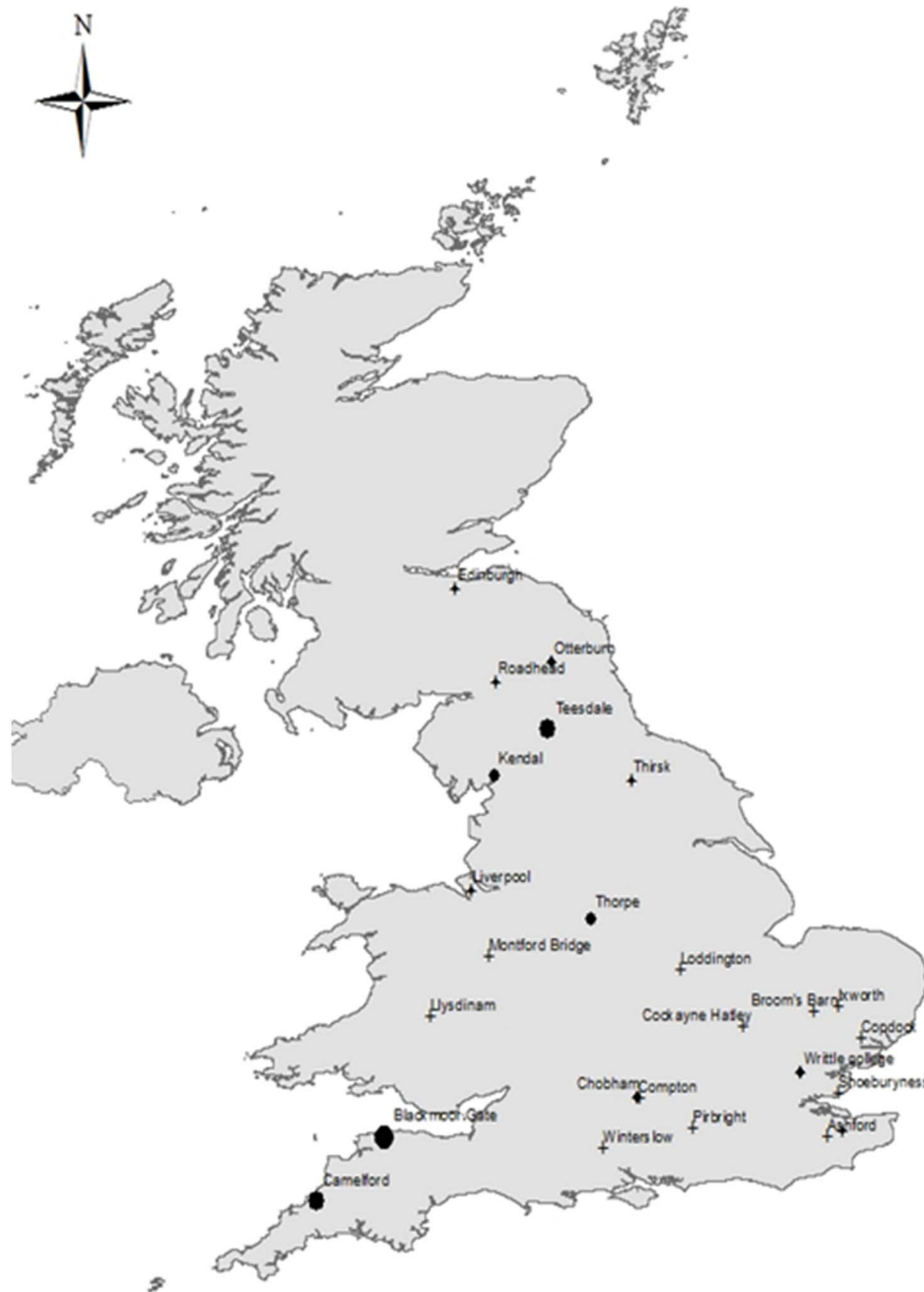
Figure 1. Locations of UK trapping sites for Culicoides surveillance (2006–2010). Circle area is proportional to maximum catch ever recorded per site, where complete yearly data were available. Sites with crosses lacked complete yearly trapping profile. doi:10.1371/journal.pone.0111876.g001

individual species in the Avaritia male dataset. The start of the season for Avaritia females was defined as the first day of the year in which more than five pigmented females were caught (in accordance with the definition used by European Union Council to define the start and end of the SVFP in Europe). Site-by-year combinations were only included in the analysis if at least two trapping nights prior to this date had been recorded. The end of the season for Avaritia females was similarly determined as the last day of the year in which more than five pigmented females were caught (with the site-by-year combination being excluded from analysis if there were less than two subsequent trapping nights