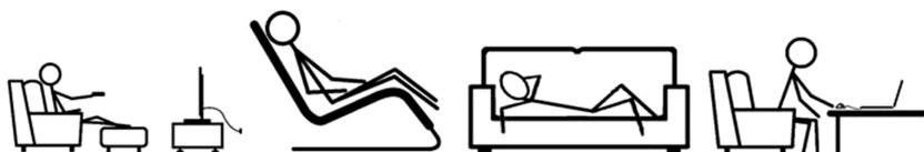
Fig. 1. Sample of images used in the manikin task.