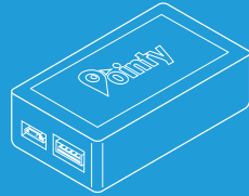
A Pointy Box