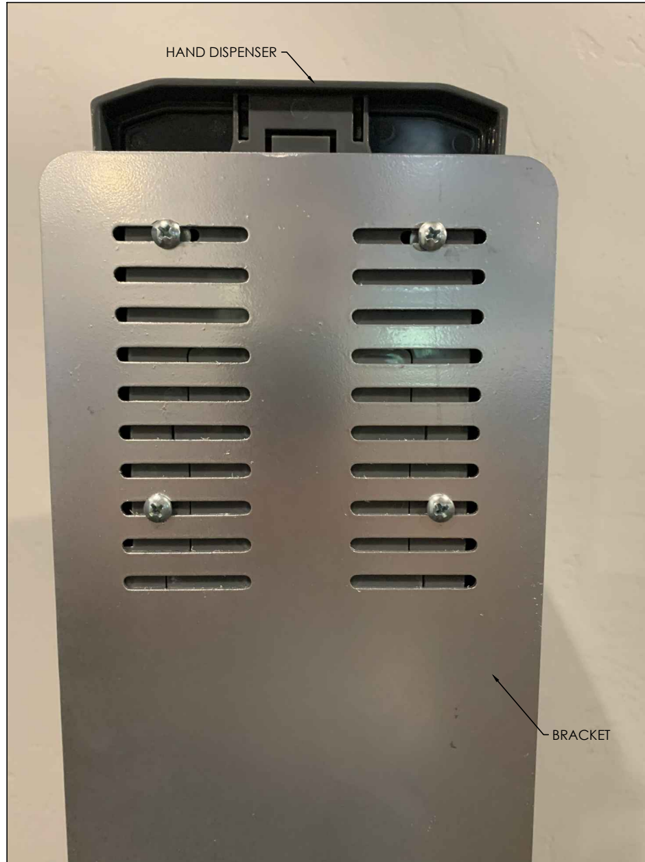
BACKSIDE OF DISPENSER SHOWN