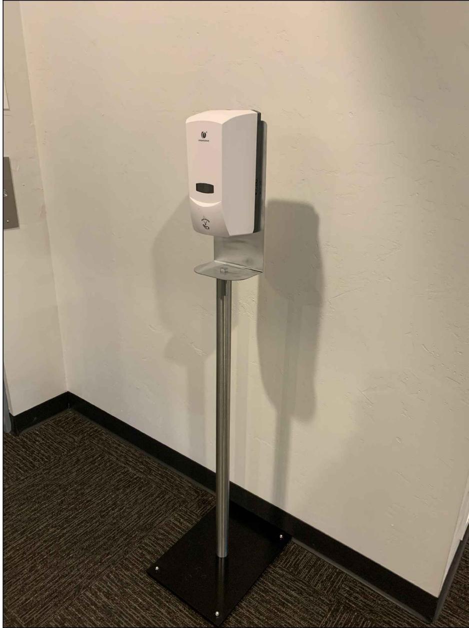
COMPLETE UNIT SHOWN