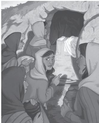
Lesson 1 Visual 1

DISPLAY: Show visual picture 3 or PowerPoint visual 3.