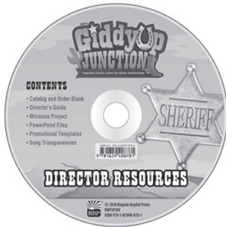
Director Resource CD (32102)

ACTIVITY: Divide the students into teams of four. Each team will take a turn coming to the front of the room. While being timed, teammates work together to put the lasso letters in the correct order of the words that begin with those letters.