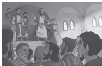
Lesson 1 Visual 3