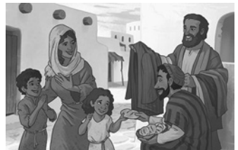
Lesson 1 Visual 4

ACTIVITY: Invite a student volunteer to come up front. Hand the volunteer the piece of paper and ask him or her to rip it in half. Then hand the volunteer a thick notebook, asking him to rip it in half as well without opening the notebook. If time allows, invite other students to try. ASK: Why was the notebook impossible to rip? ( A single, lonely page is easy to rip in half. But when there are a lot of pages all together, like in the notebook, they become almost impossible to rip. )