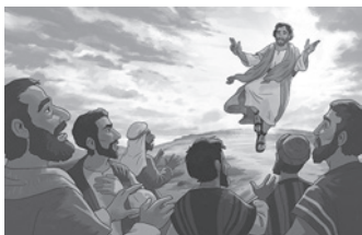
Lesson 1 Visual 2