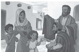
Lesson 1 Visual 4

DISPLAY: Show picture visual 4 or PowerPoint visual 4.