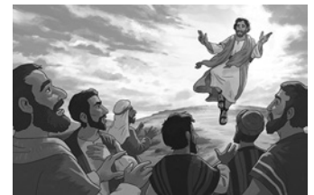
Lesson 1 Visual 2