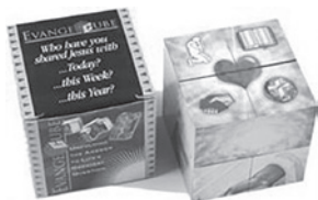
eCube BIG (8421)

DISPLAY: Hold the eCube. Follow the arrows on the cube to display the panels in the correct order.