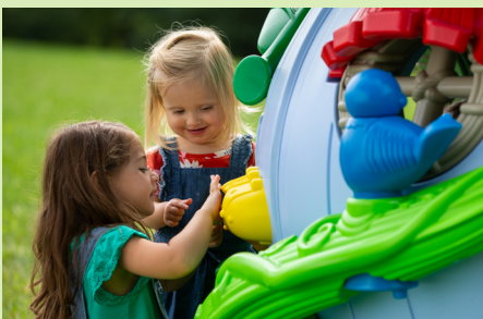
Gross Motor Skills