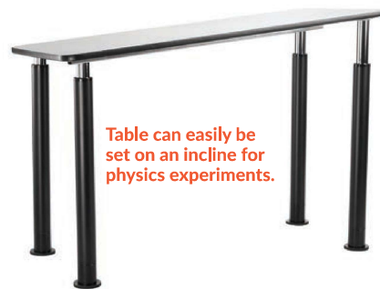
Table can easily be set on an incline for physics experiments.