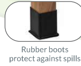
Model SLT1-4260C shown