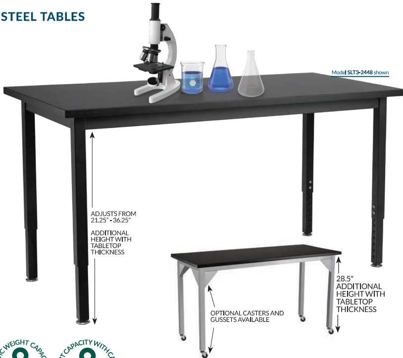
Model SLT3-2448 shown

ADJUSTS FROM 21.25" - 36.25" ADDITIONAL HEIGHT WITH TABLETOP THICKNESS