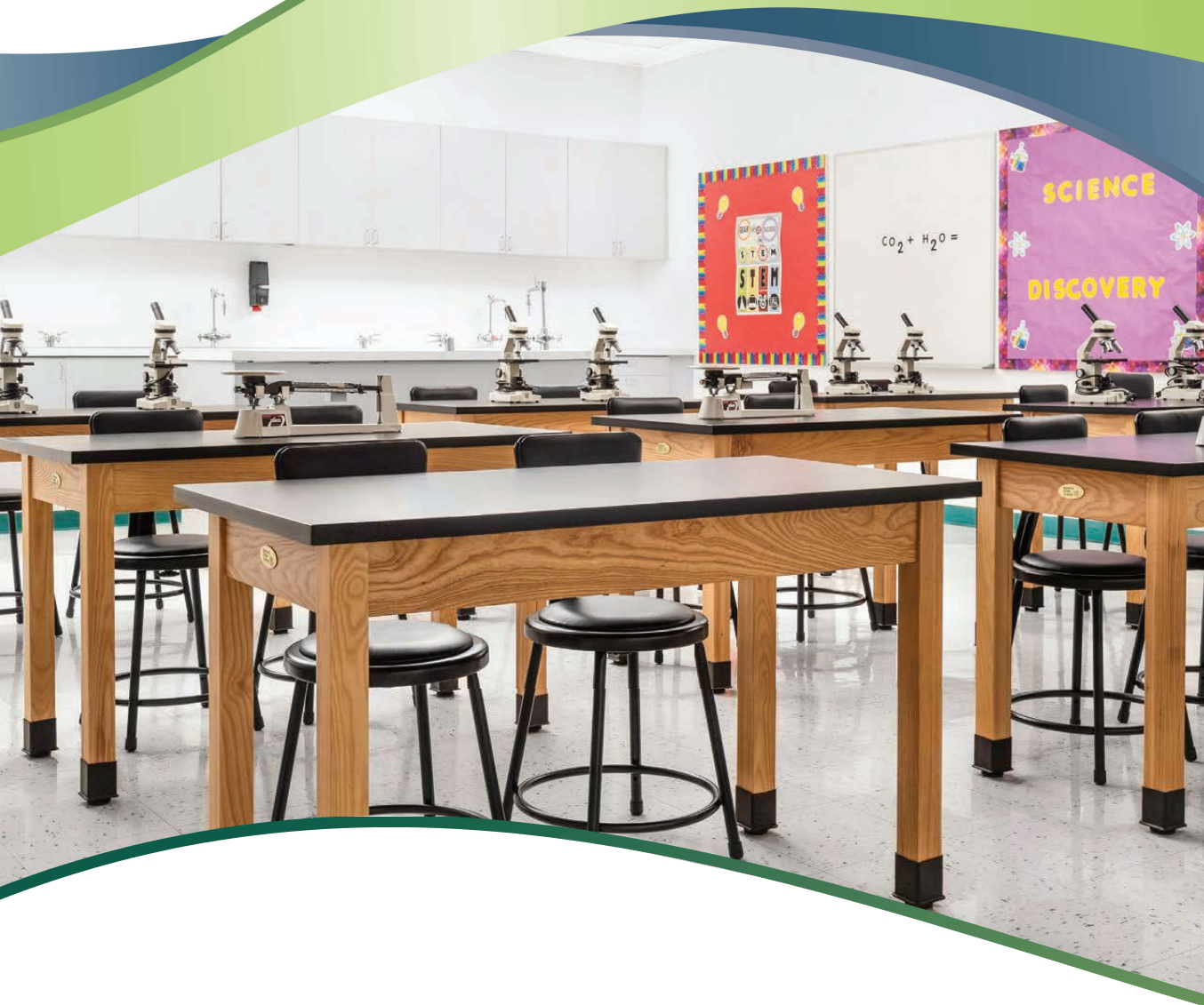
Wood Tables Series

Full line of science tables made for the most rugged environments.