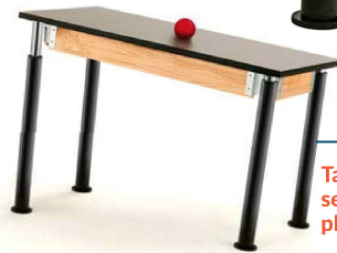
Model SLT4-2448P shown

Tops available in HPL, Chem-Res, Phenolic