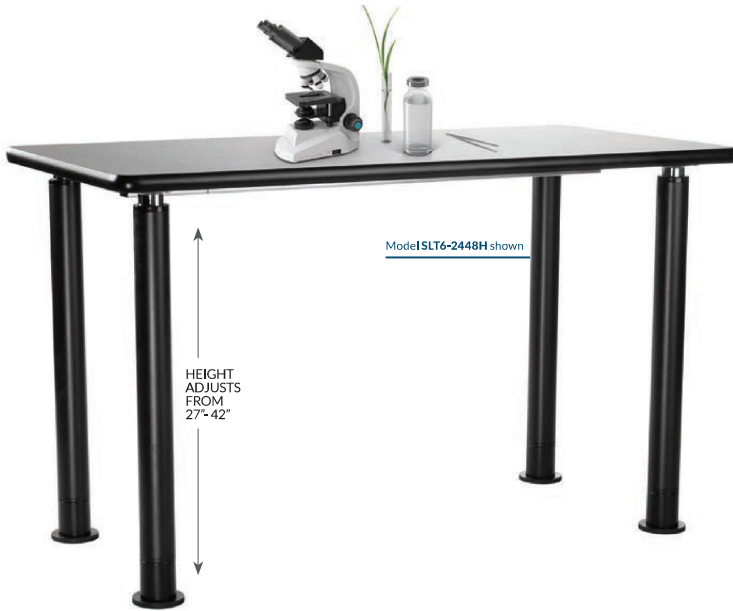
Model SLT6-2448H shown