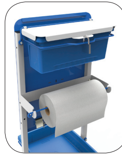
Back view (SAN100)