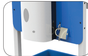
Dispenser accessible for use with lock out stored

Access to hand sanitizer is important but so is preventing students from draining the dispenser when nobody is looking, or worse, ingesting it. This safety feature is not found on generic hand sanitizer dispensers.