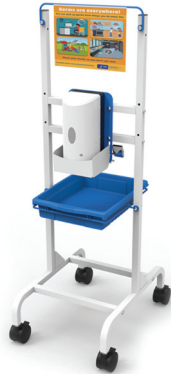
Base Model (SAN101)